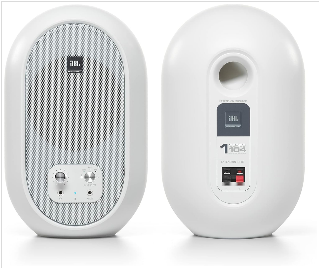
Figure 1: Front view of the JBL 1 Series 104-BT master monitor, showing the speaker grille, volume knob, input select knob, headphone jack, and Aux In port.