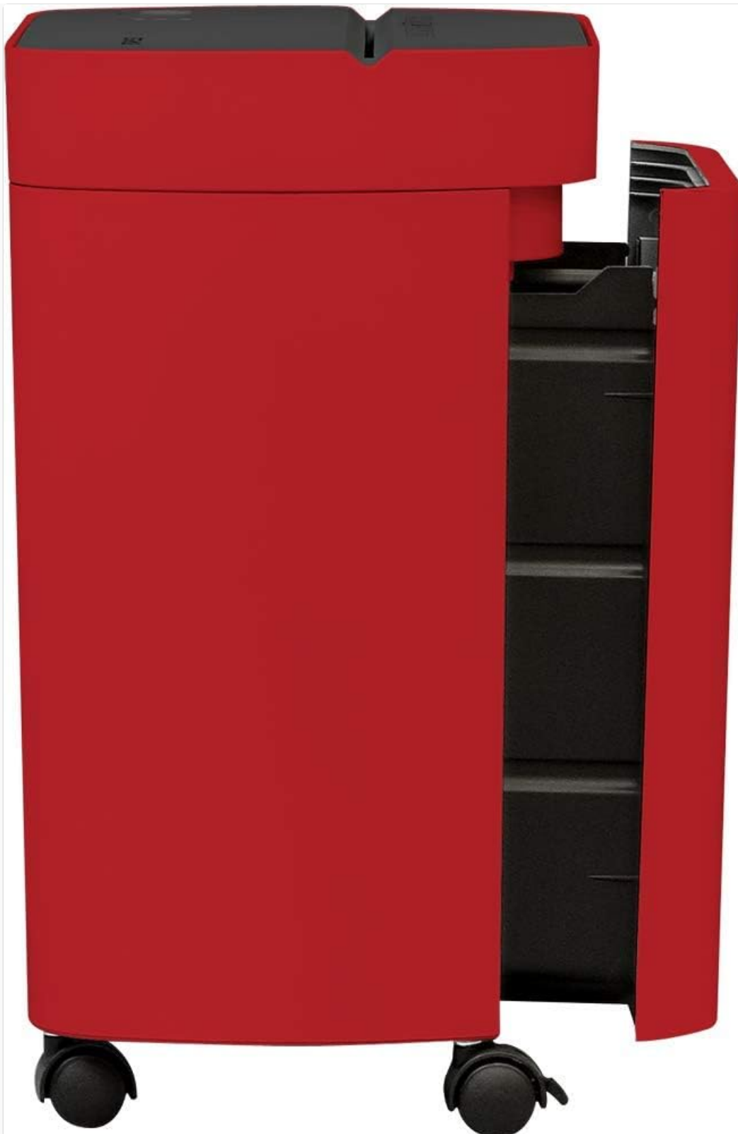
Figure 2: Side view illustrating the removable waste bin.