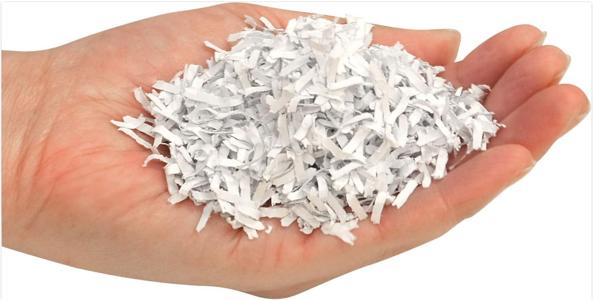
Figure 4: Example of Nanocut shredded paper particles.