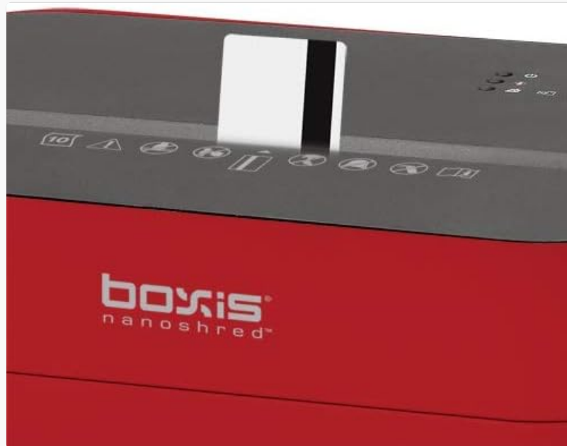
Figure 3: Inserting a credit card into the shredder slot.

Your browser does not support the video tag.