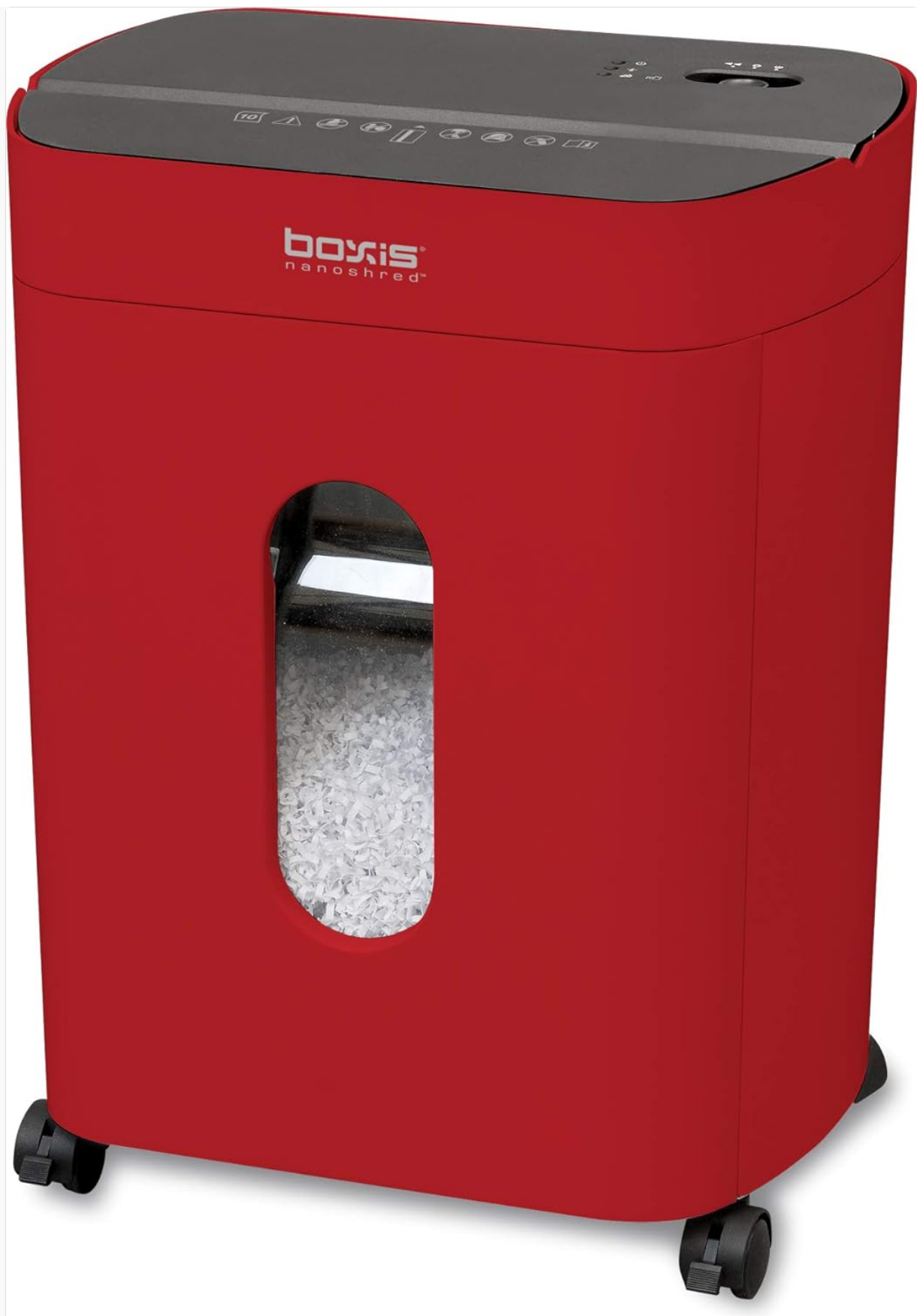
Figure 1: Front view of the Boxis Nanoshred 10-Sheet Nanocut Paper Shredder.