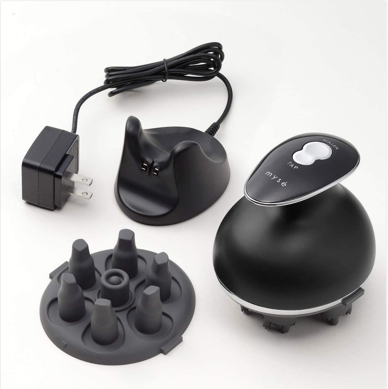
Image 2.1: All included components: main unit, head attachment, kneading attachment, and charging stand with power adapter.