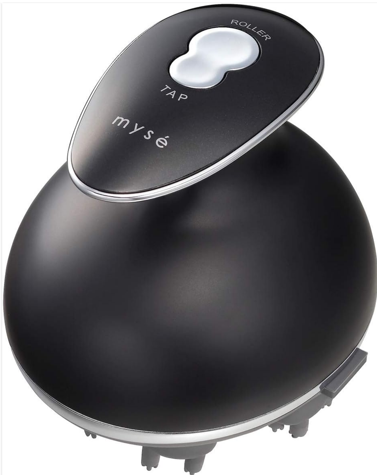
Image 1.1: Top view of the YA-MAN mysé Head Spa Lift for MEN device.