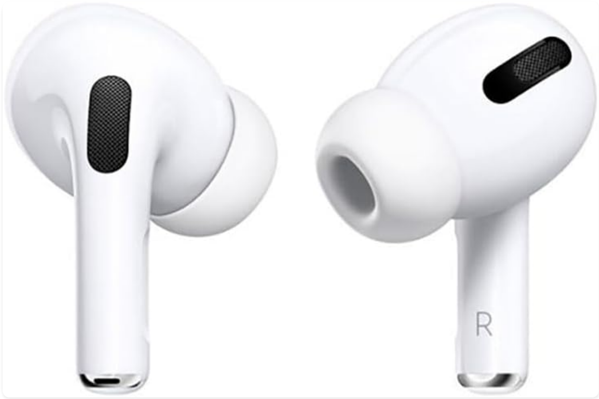
Image: Close-up view of two individual Apple AirPods Pro earbuds, highlighting the silicone ear tips.

Achieving the right fit is crucial for optimal sound quality and Active Noise Cancellation. Your AirPods Pro come with small, medium, and large silicone ear tips.