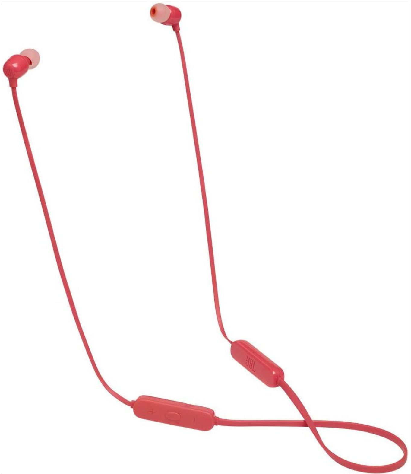
Figure 1: JBL TUNE 115BT Wireless In-Ear Headphones