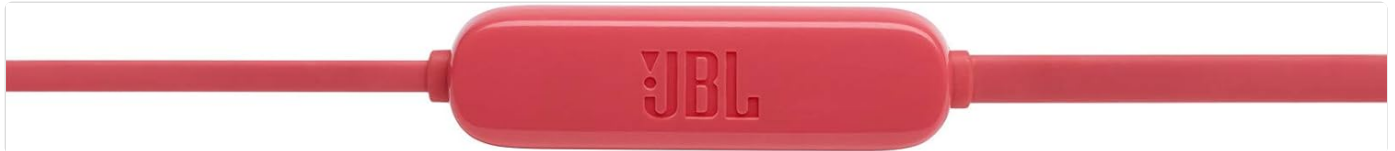
Figure 4: Inline Remote Control

The JBL TUNE 115BT features a 3-button inline remote with an integrated microphone for convenient control of your audio and calls.