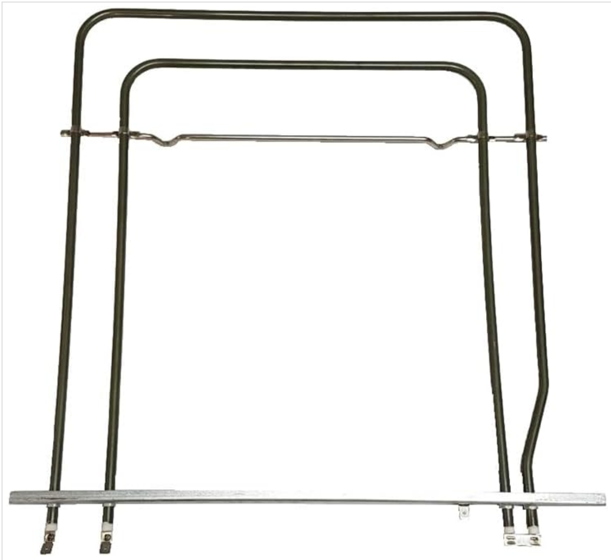
Figure 1: The REPORSHOP Balay Oven Heating Element, showing its general shape and terminals.