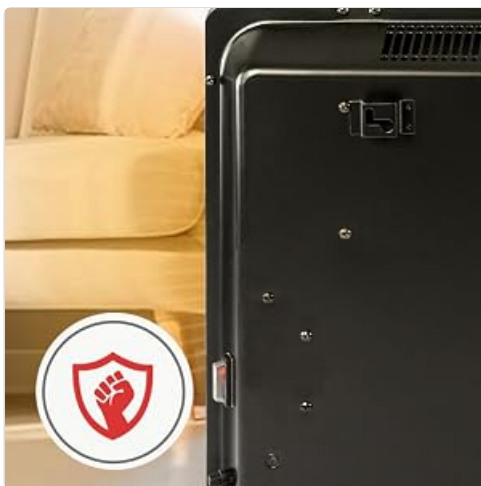
Image 1.1: Rear view of the heater, highlighting the main power switch for enhanced safety.