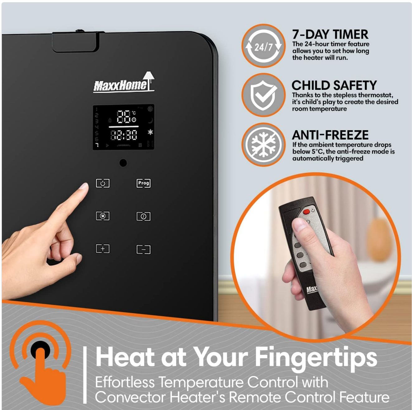
Image 4.1: The control panel and remote control, illustrating the buttons for various functions including timer, child safety, and anti-freeze mode.