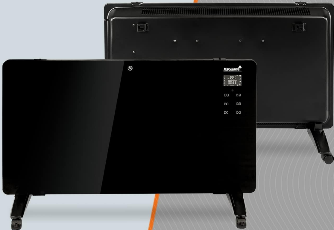
Image 2.2: Front and rear views of the heater, emphasizing its 2000W power output and quiet operation.