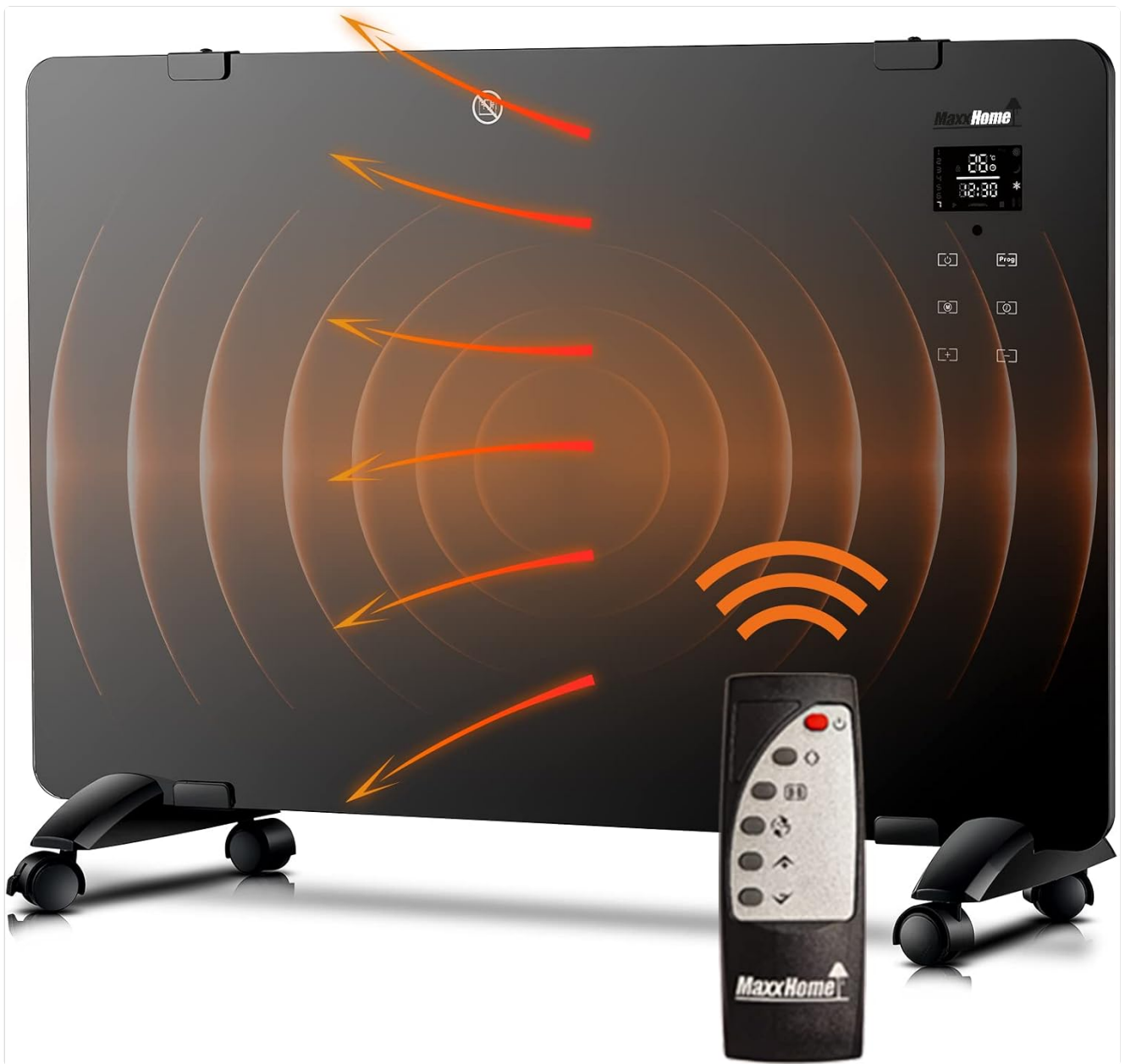
Image 2.1: The MaxxHome electric heater with its remote control, illustrating the warm air distribution.