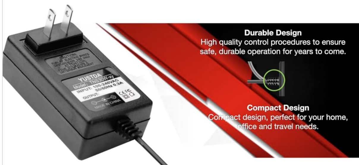
Image 3.3: Durable & Compact Design. This image highlights the robust construction and small form factor of the charger, emphasizing its suitability for various environments.