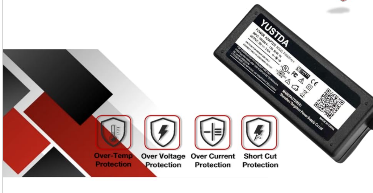
Image 3.2: Safety Design with Multiple Protections. This image shows the charger unit alongside icons representing various safety features: Over-Temp Protection, Over Voltage Protection, Over Current Protection, and Short Circuit Protection.