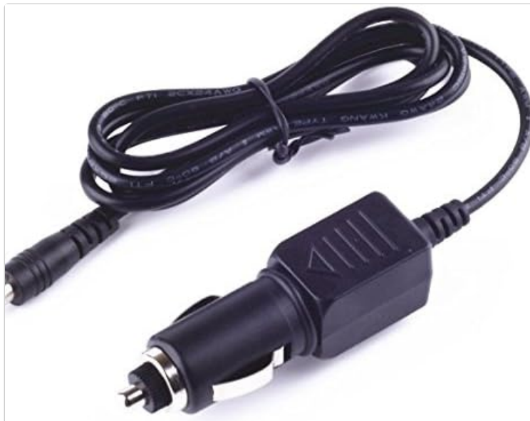
Image 1.1: YUSTDA Car Charger Power Adapter. This image displays the car charger adapter with its coiled cable and barrel connector.

This manual provides essential instructions for the safe and effective use of your YUSTDA Car Charger Power Adapter. This adapter is designed to provide power to compatible devices, specifically the RAVPower RP-PB048 550A Jump Starter, from a vehicle's 12-24V DC power outlet.