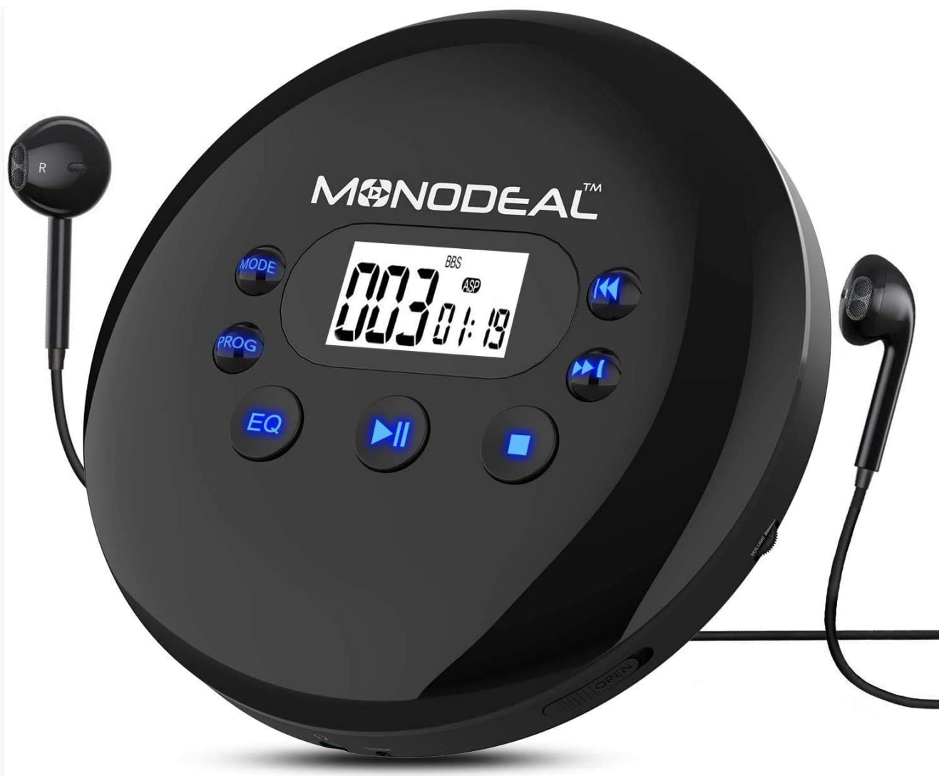
The MONODEAL MD102 Portable CD Player, shown with its included headphones.