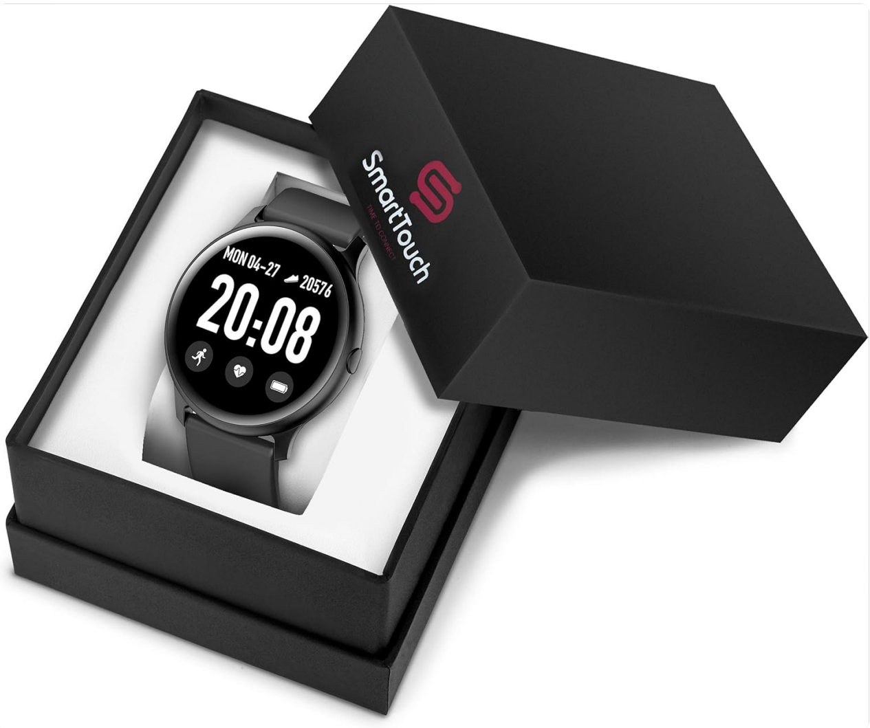
Image 1.1: The Smart Touch KW19 Smart Watch presented in its packaging.