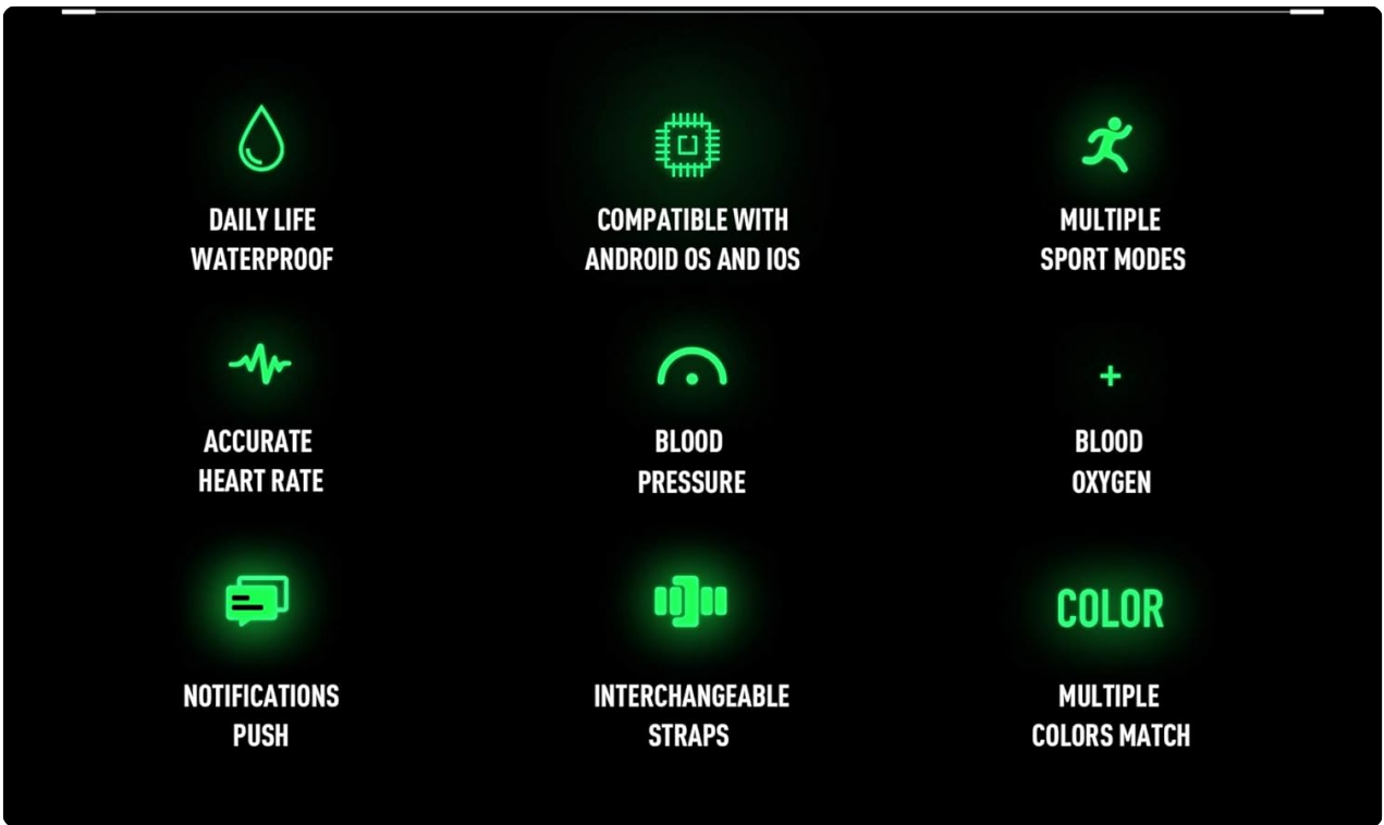
Image 5.1: Visual representation of key features of the KW19 Smart Watch.