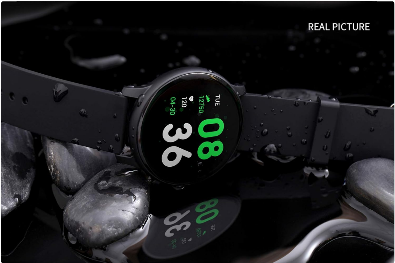
Image 6.1: The KW19 Smart Watch demonstrating its daily life waterproof capability.