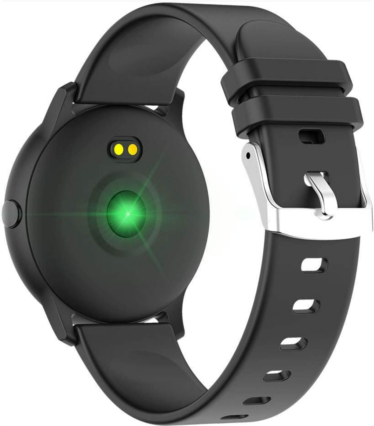
Image 4.1: Rear view of the KW19 Smart Watch, highlighting the heart rate sensor.