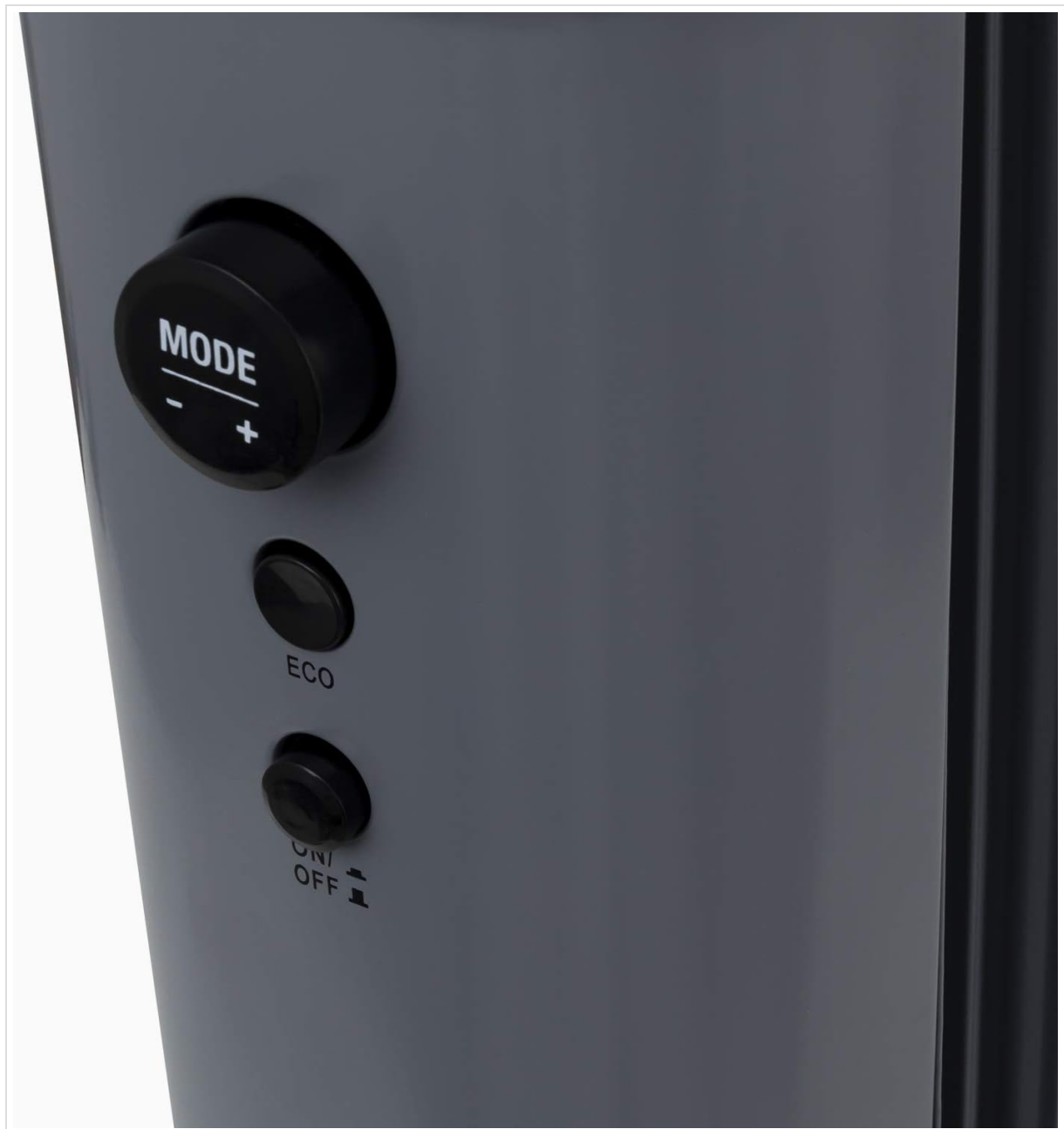
Figure 5: Close-up of the control buttons, including MODE (+/-), ECO, and ON/OFF.