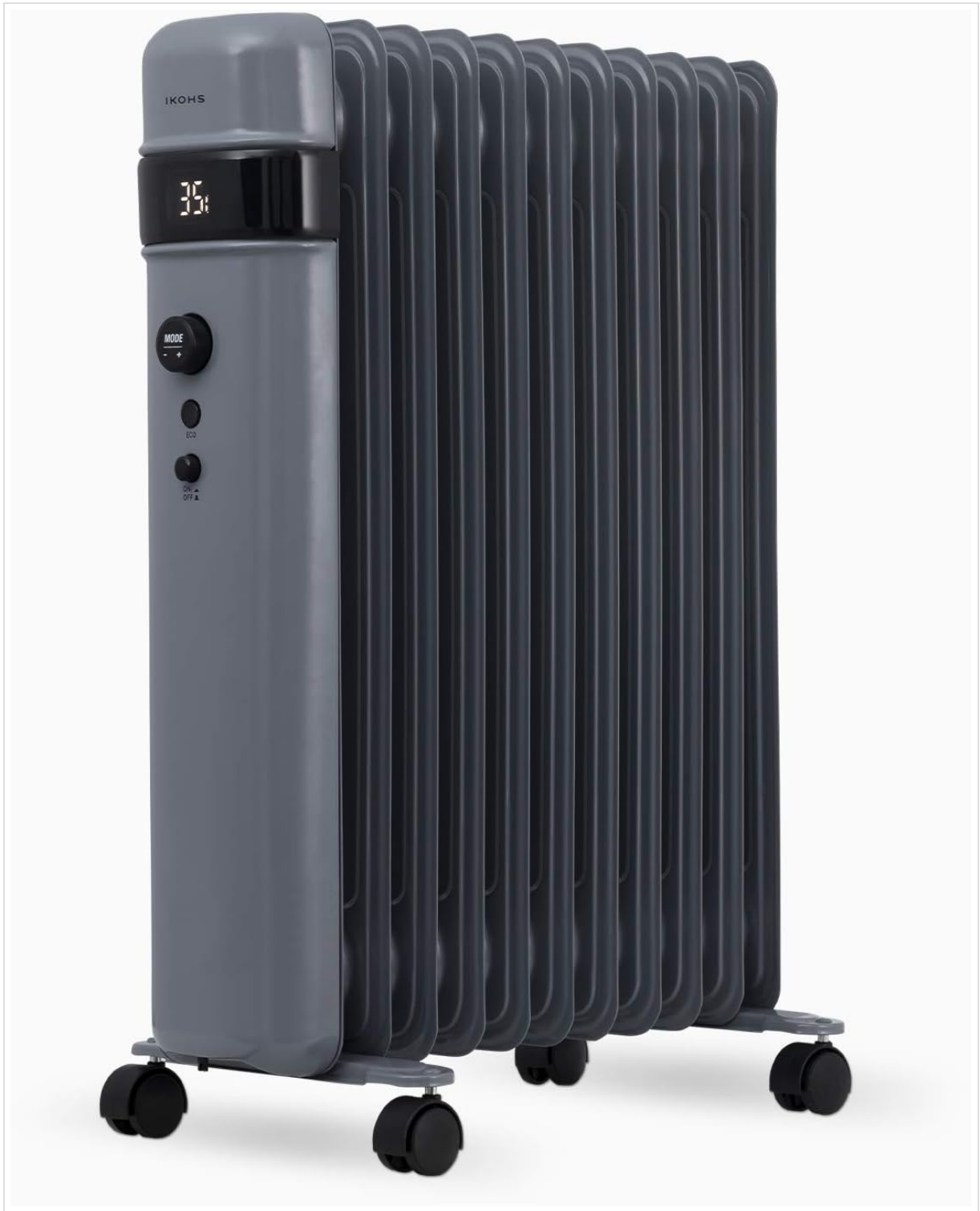
Figure 1: Full view of the IKOHS ORH2500 Oil Heater, showing its fins, control panel, and castor wheels.