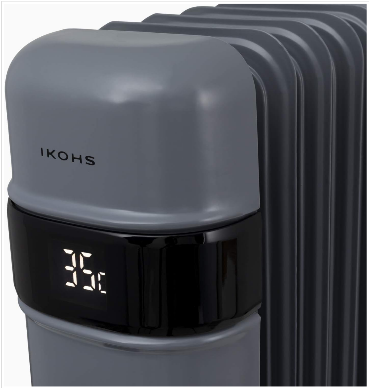
Figure 4: Detailed view of the digital display, showing a temperature reading of 35 degrees.