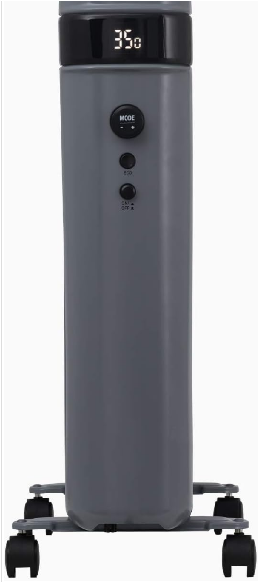
Figure 3: Close-up of the heater's control panel, featuring a digital display and control buttons.