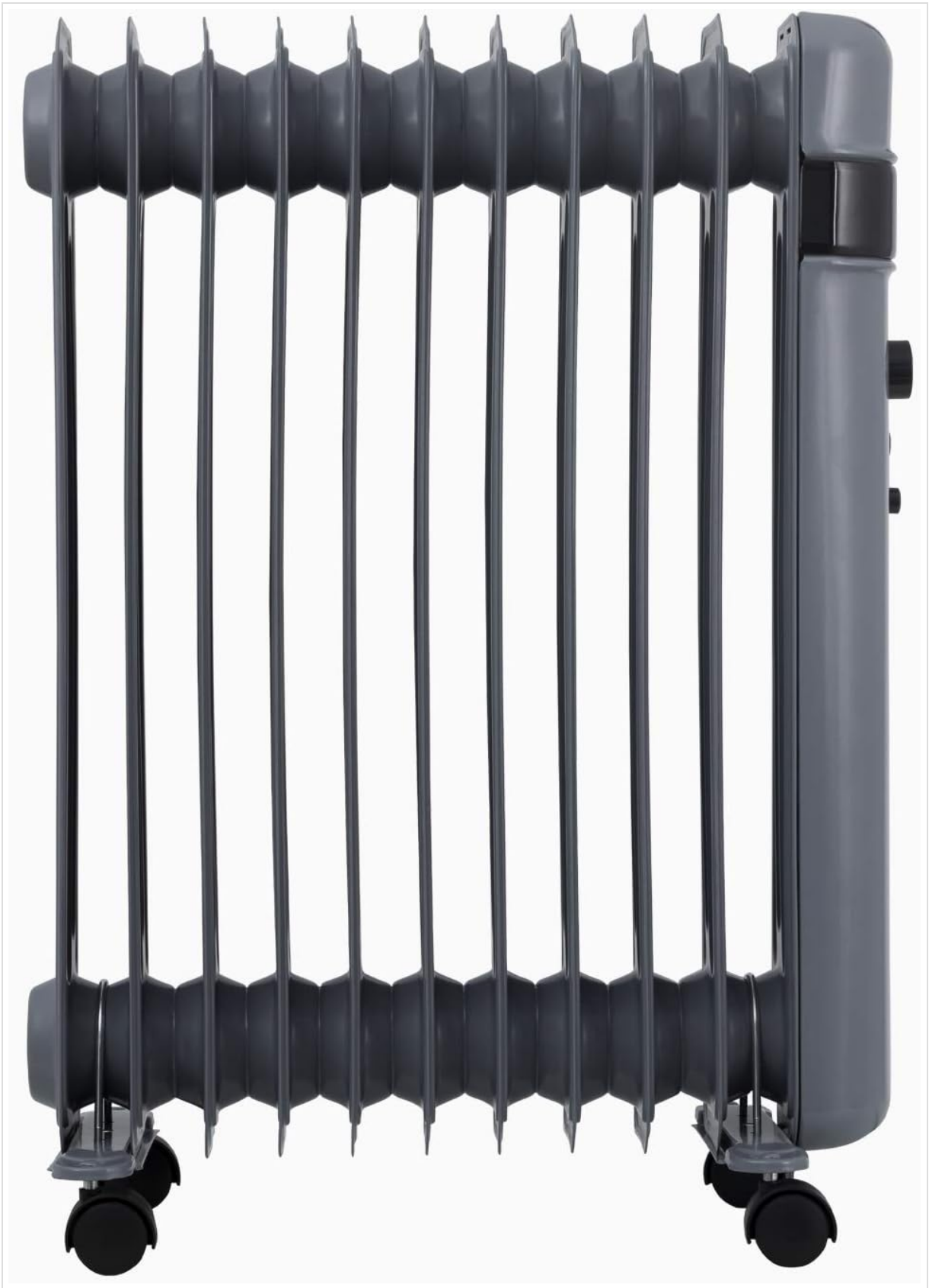
Figure 2: Side view of the heater, highlighting the multiple heating fins that radiate warmth.