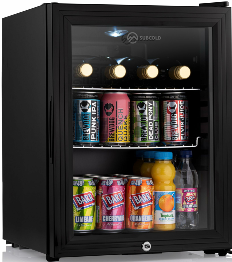
Figure 5: The fridge interior, demonstrating typical loading with beverages.