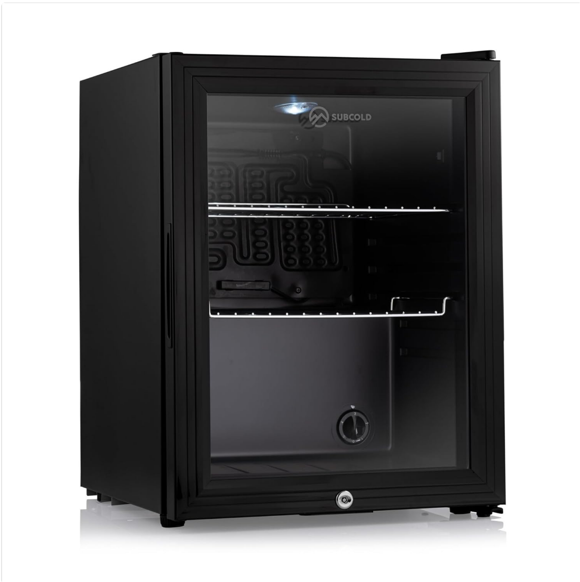
Figure 1: Interior of the fridge showing the removable and adjustable chrome wire shelves.