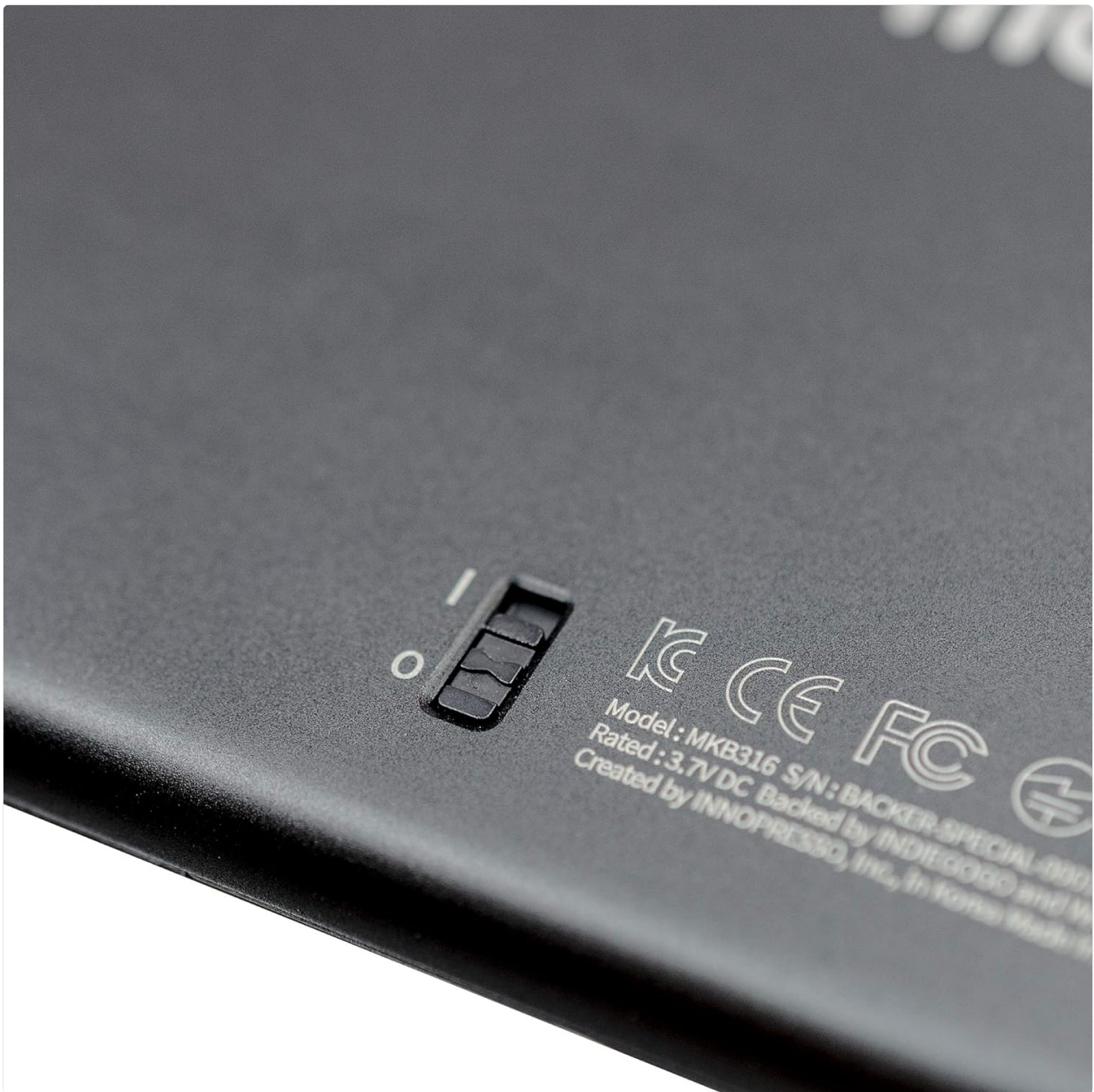
Image: Close-up of the back of the Mokibo keyboard, showing the power switch and product details including model number MKB316.