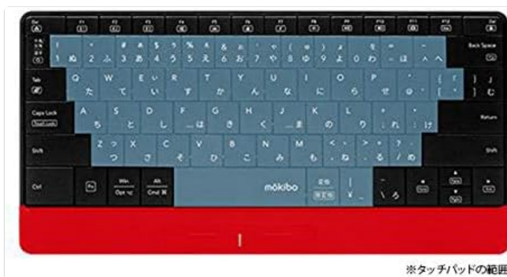
Image: An illustration highlighting the active touchpad area on the Mokibo keyboard, which covers the main key section.

Image: A hand demonstrating how to use the integrated touchpad feature on the Mokibo keyboard, where the keys themselves act as the touch surface.