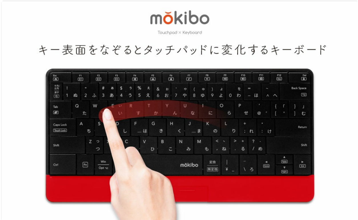
Image: A close-up view of the Mokibo keyboard keys, highlighting the keycap design for typing.

The Mokibo keyboard functions as a standard QWERTY keyboard for typing. The keys are designed for comfortable and efficient input.