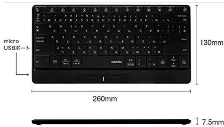
Image: The Mokibo keyboard showing its dimensions (260mm x 130mm x 7.5mm) and the location of the micro USB charging port.

Before initial use, fully charge the Mokibo keyboard using the included USB cable. Connect the micro USB port on the keyboard to a USB power source (e.g., computer, USB wall adapter).