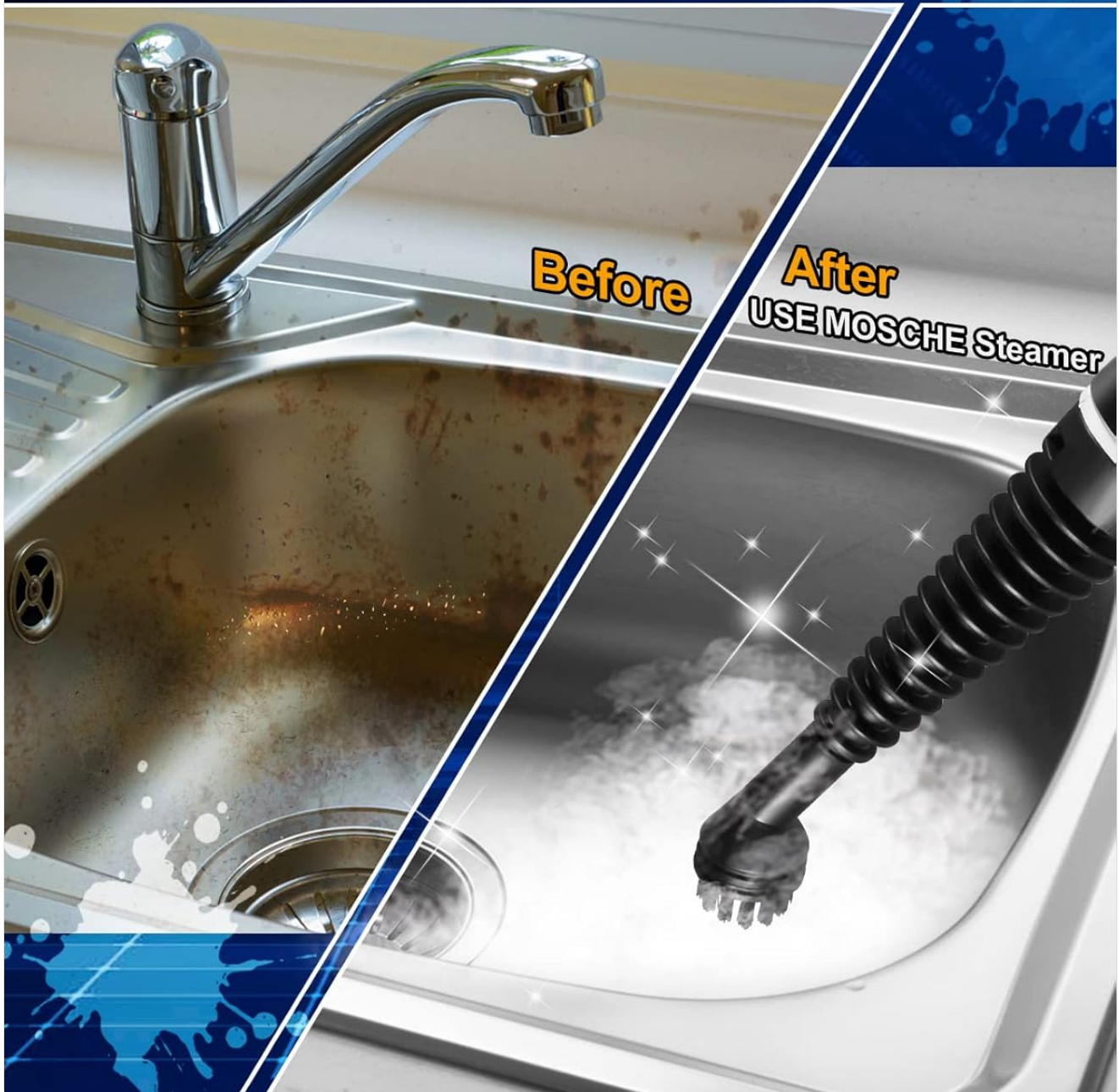
Image: A split image showing a stained kitchen sink before cleaning and the same sink sparkling clean after using the MOSCHE steam cleaner.