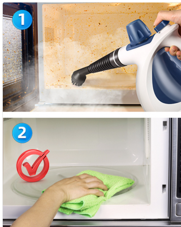
Image: Step 2 of cleaning a microwave, showing a hand wiping the interior with a cloth after steam application.