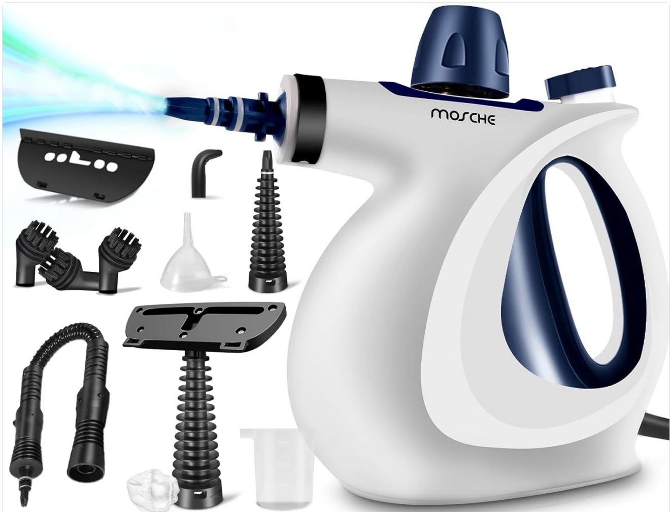
Image: The MOSCHE Handheld Pressurized Steam Cleaner shown with its complete set of 11 accessories, including various nozzles, brushes, and tools.