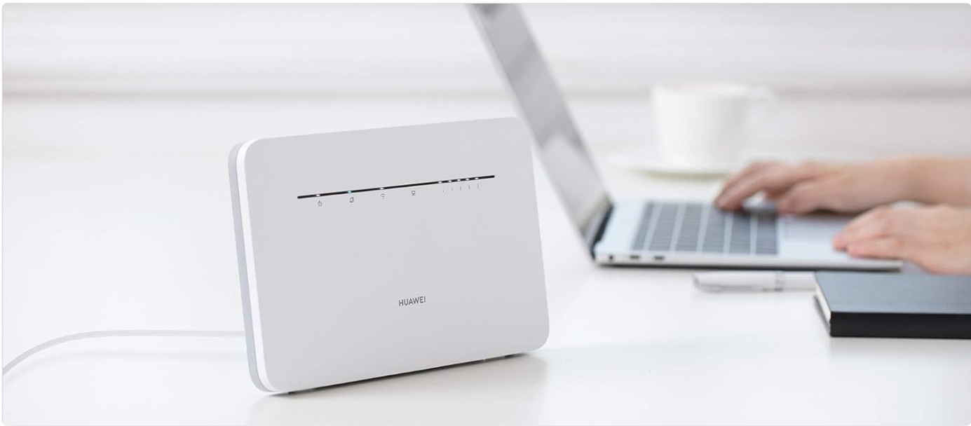
Image: The HUAWEI B535-232 router in an office setting, connected to a laptop, demonstrating its use for internet access.

The LED indicators on the front panel provide status information: