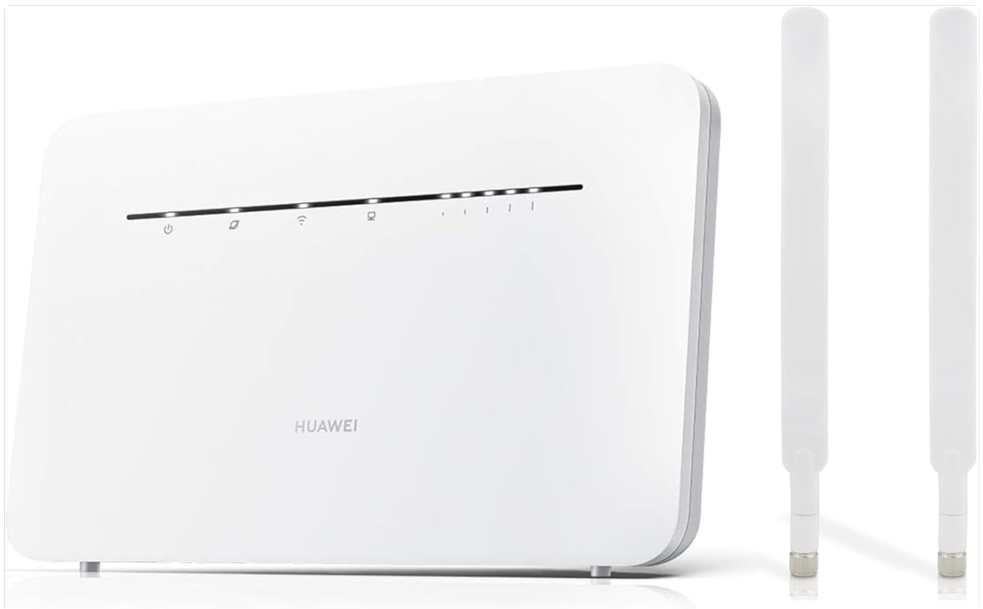
Image: The HUAWEI B535-232 router shown with its two external SMA antennas and stand bracket.