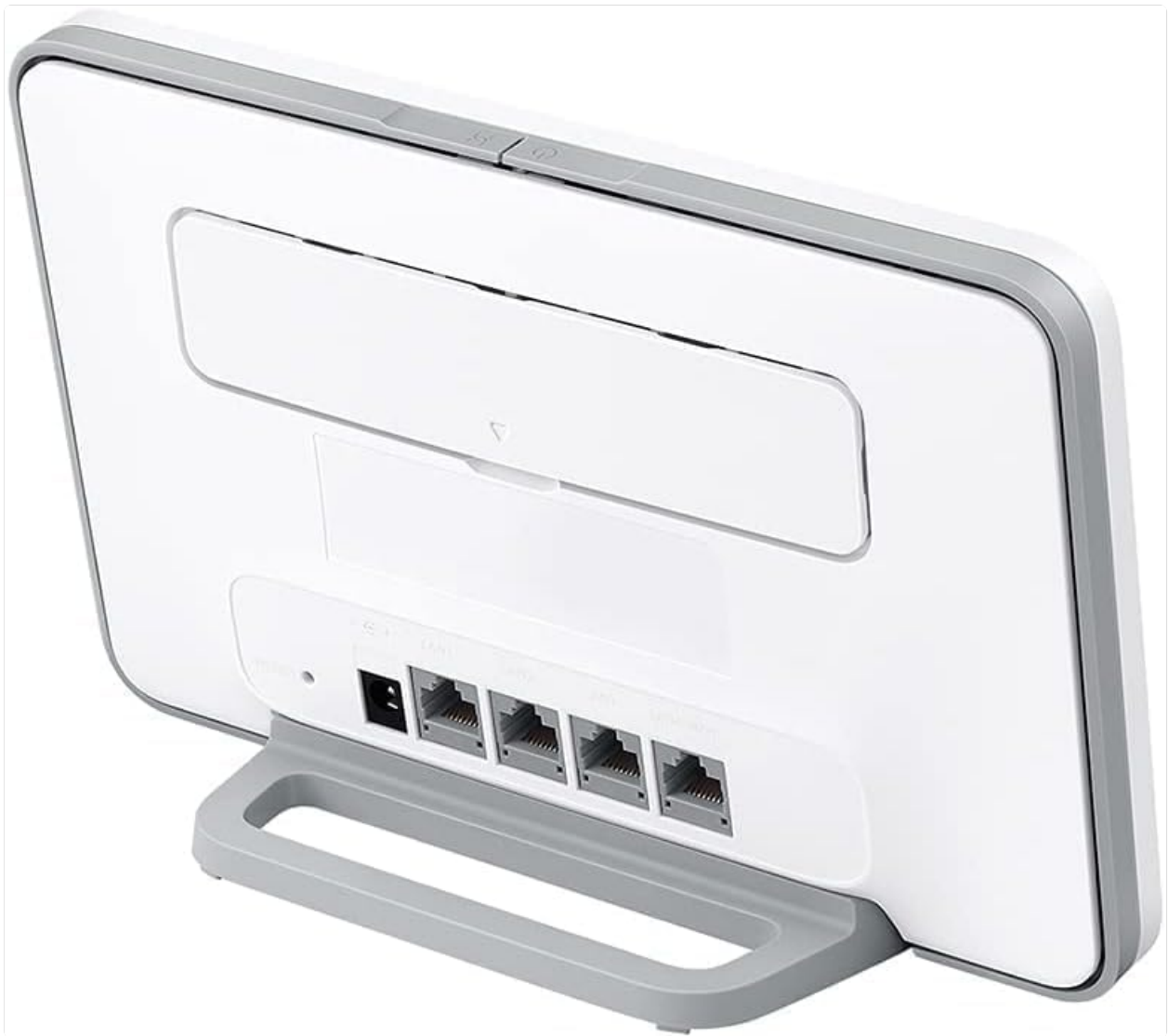
Image: Rear view of the HUAWEI B535-232 router, highlighting the antenna ports, LAN/WAN ports, and power input.