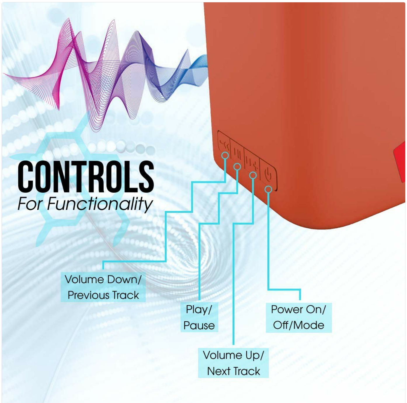
Image: Control buttons on the iBall Musi Play A1 speaker.