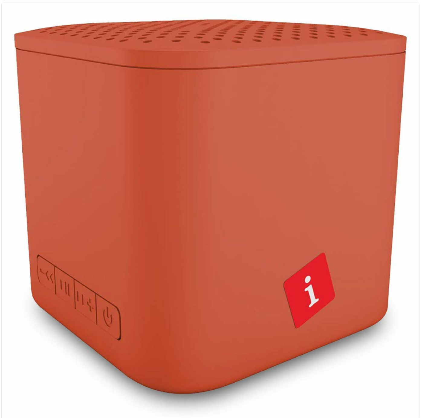
Image: iBall Musi Play A1 Wireless Ultra-Portable Bluetooth Speaker (Burnt Orange)