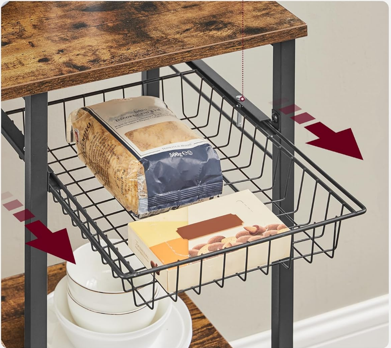
Figure 3: Pull-Out Wire Basket. A detailed view of the pull-out wire basket, illustrating its design for easy access to contents and the safety button that prevents it from accidentally falling out when fully extended.