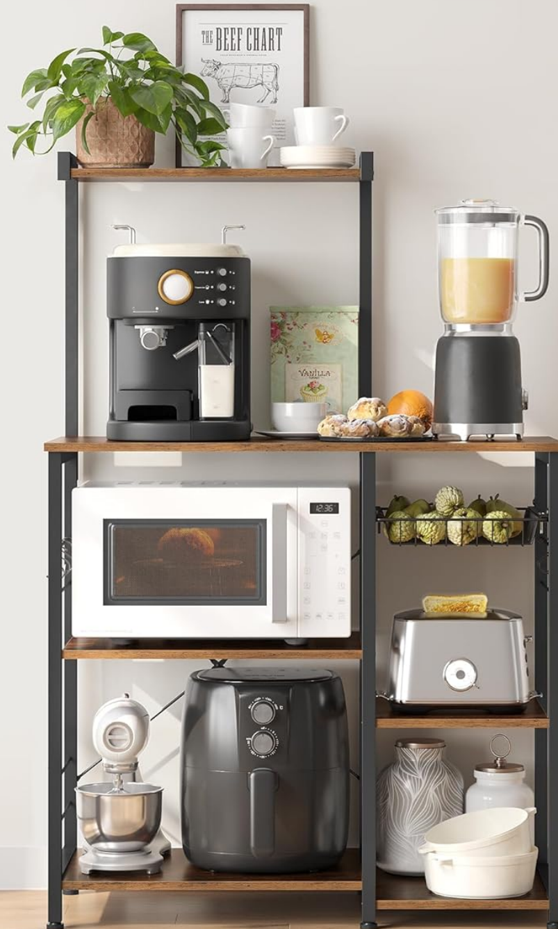
Figure 2: Organized Storage. This image demonstrates the various storage possibilities of the kitchen shelf, showcasing a microwave, coffee maker, blender, and other kitchen items neatly arranged on its multiple shelves and using the integrated hooks.