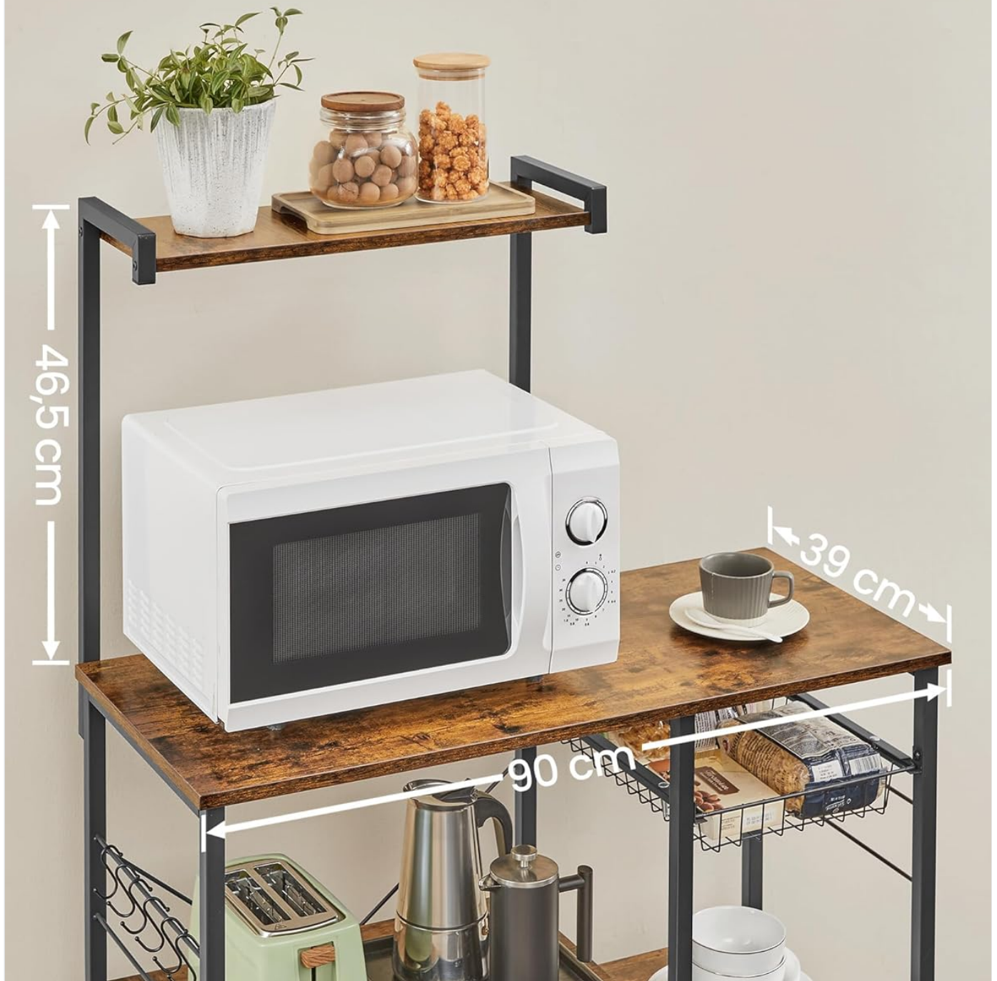
Figure 5: Product Dimensions. This diagram provides a comprehensive overview of the kitchen shelf's dimensions, including its overall height, width, and depth, as well as the specific measurements for each shelf and compartment.

La grande surface de 39 x 90 cm est suffisamment large pour accueillir vos appareils de cuisine.