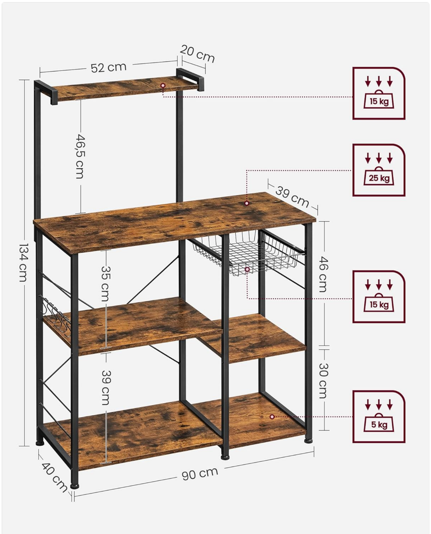
Figure 6: Main Surface Area. This image illustrates the spacious main surface of the kitchen shelf, highlighting its dimensions (90 cm width x 39 cm depth) and demonstrating its capacity to comfortably accommodate a microwave oven and other kitchen items.