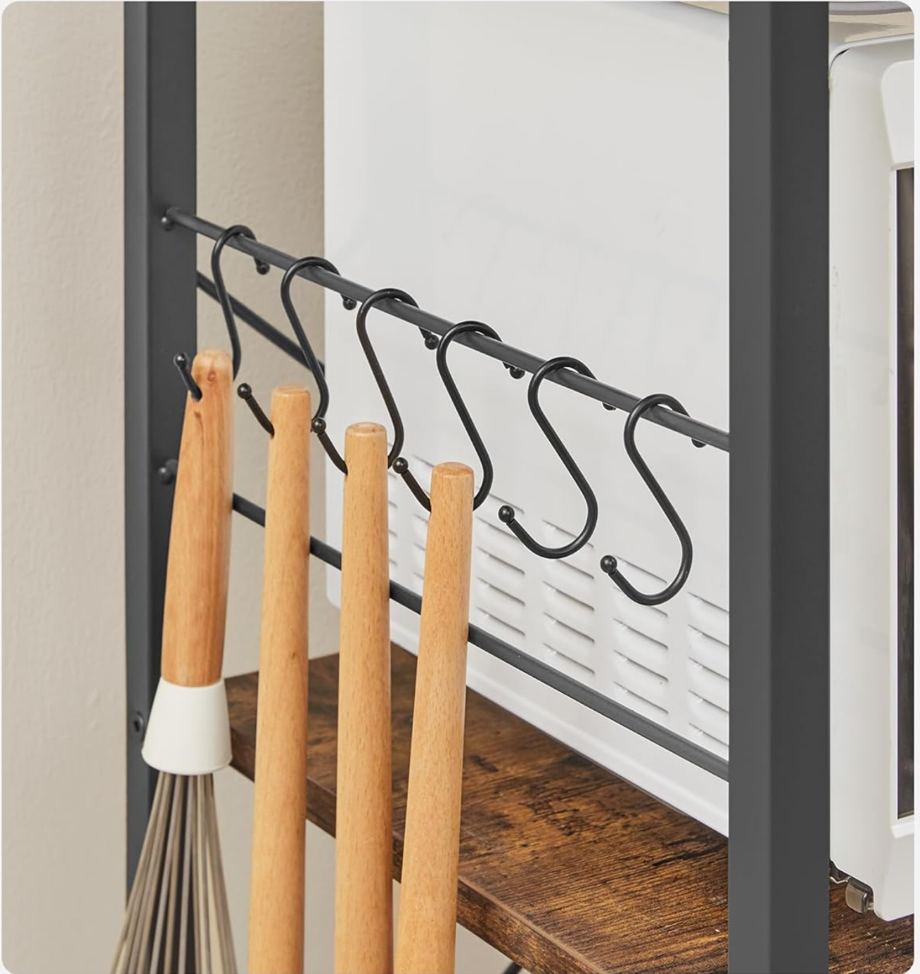
Figure 4: S-Shaped Hooks. This image provides a close-up of the six S-shaped hooks, demonstrating how they can be used to conveniently hang kitchen utensils like ladles and spatulas, keeping them organized and readily accessible.

Pour suspendre les louches, les spatules et les tasses.