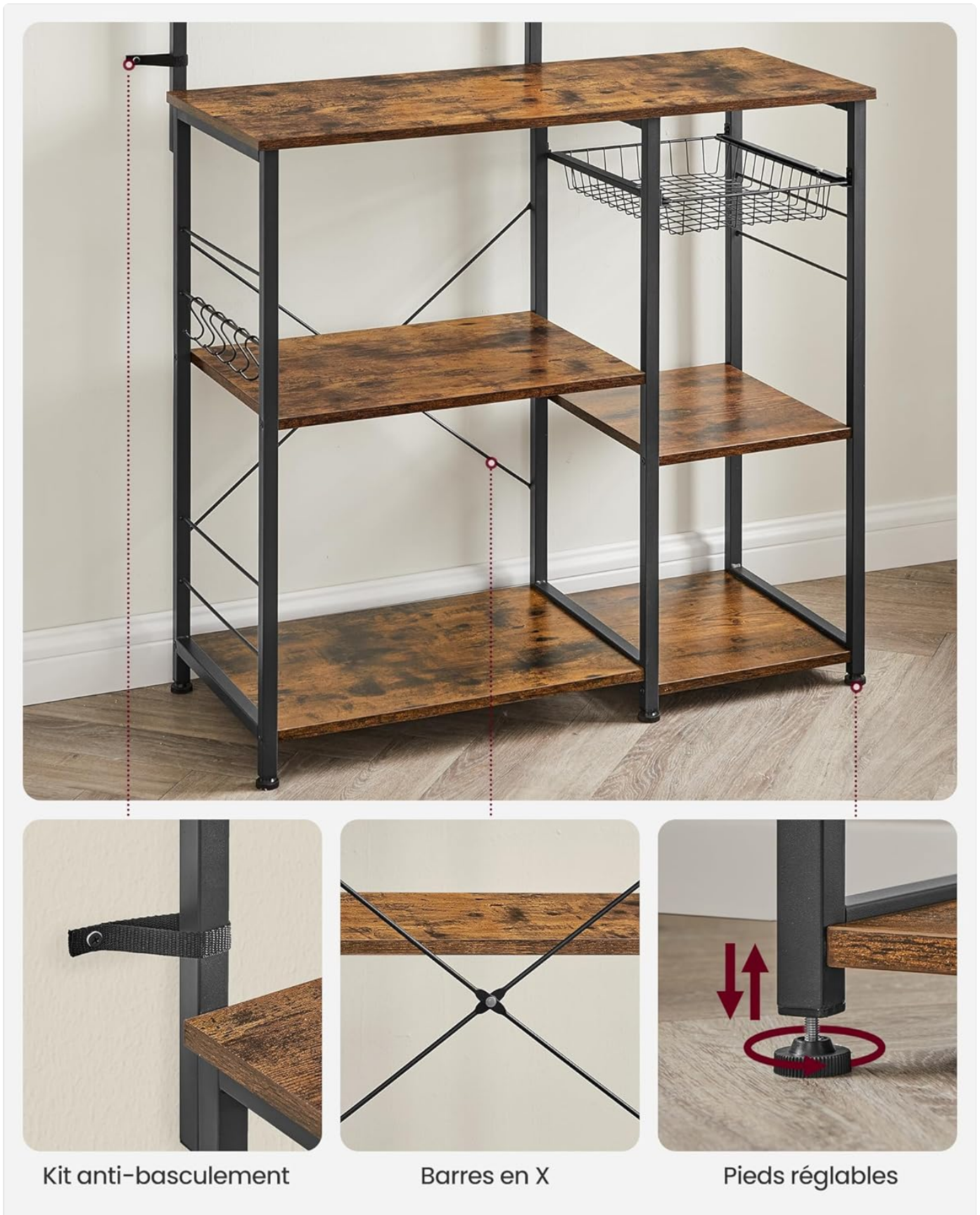
Figure 1: Stability Features. This image highlights the key stability features of the VASAGLE Kitchen Shelf, including the anti-tipping kit for wall attachment, the X-shaped bars providing structural rigidity, and the adjustable feet for leveling on uneven floors. These components are crucial for ensuring the safety and stability of the unit.