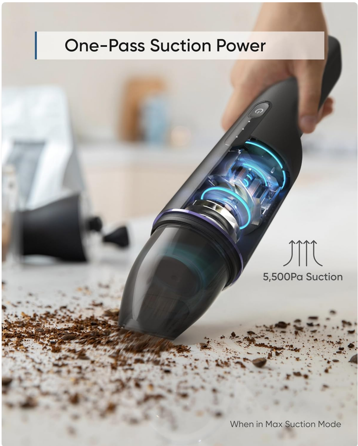
Image: The eufy HomeVac H11 with its nozzle close to a countertop, demonstrating its 5500Pa suction power on spilled coffee grounds.