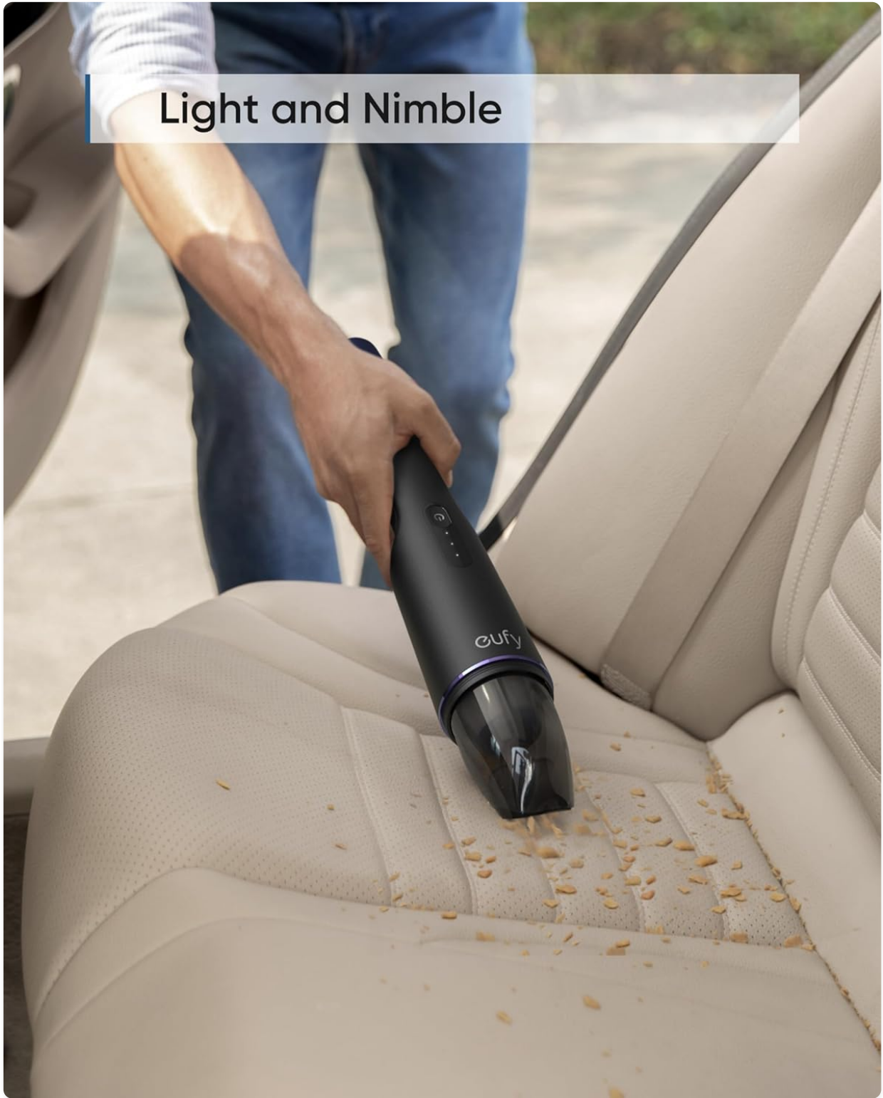
Image: A person using the eufy HomeVac H11 to clean debris from a sofa cushion.