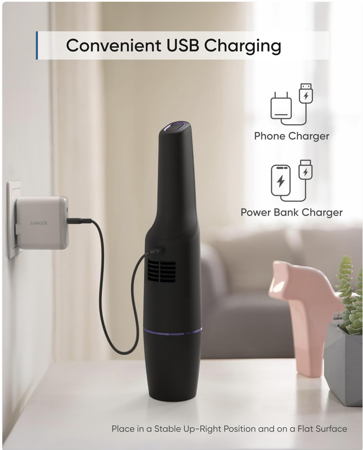
Image: The eufy HomeVac H11 charging via a USB cable connected to a wall adapter on a countertop.