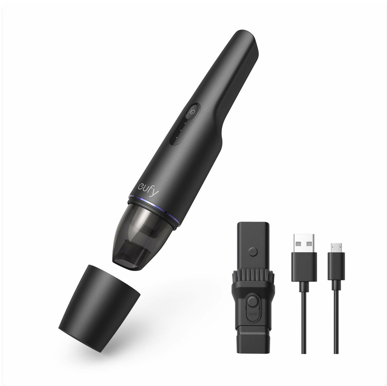
Image: The eufy HomeVac H11 in black, a sleek, compact handheld vacuum cleaner.