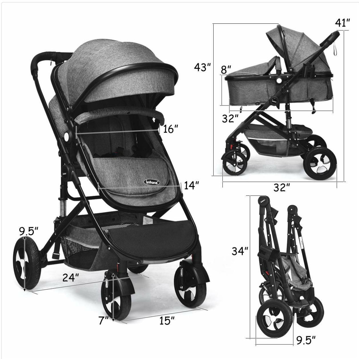
Figure 5.5: Stroller dimensions and folded configuration.