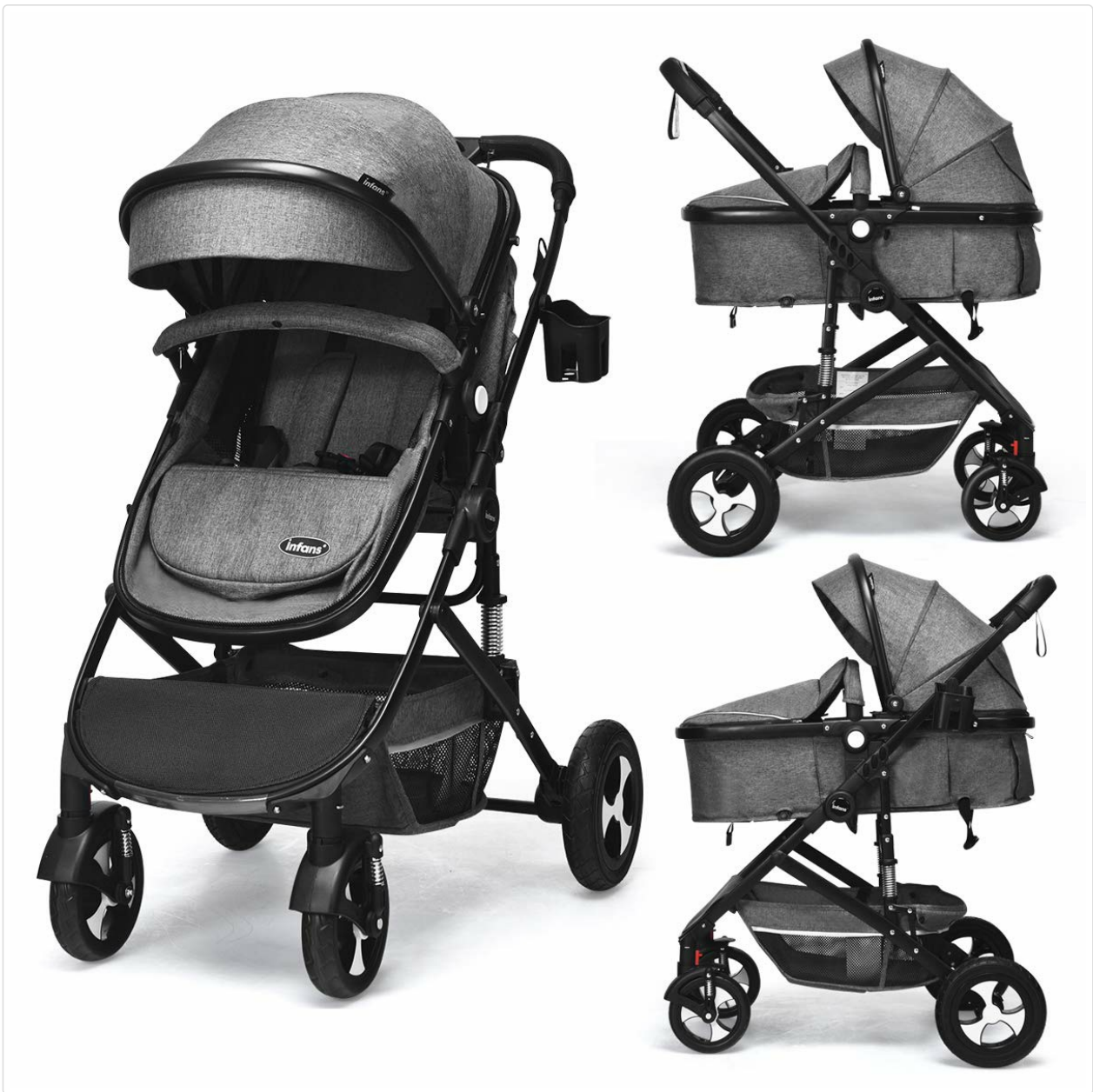
Figure 5.1: Different angle adjustments for the bassinet/seat unit.