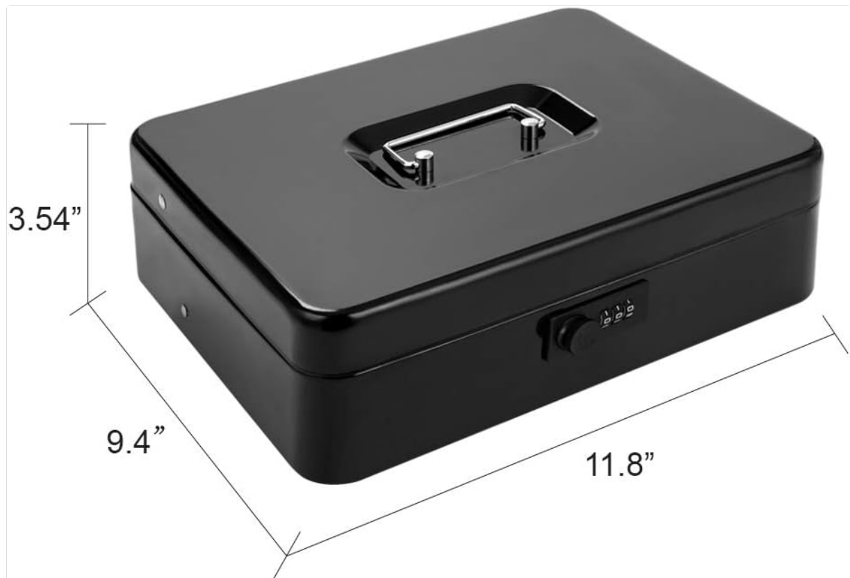
Diagram illustrating the dimensions of the cash box: 11.8 inches wide, 9.4 inches deep, and 3.54 inches high.