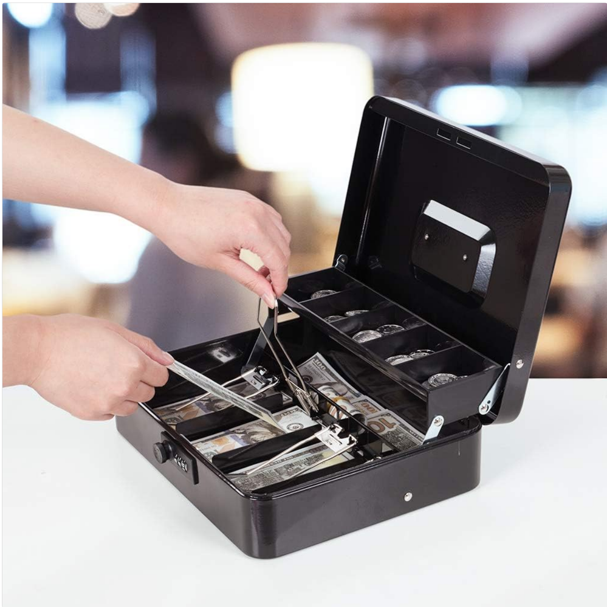
A user demonstrating how to place bills securely under the spring clips in the cash box.