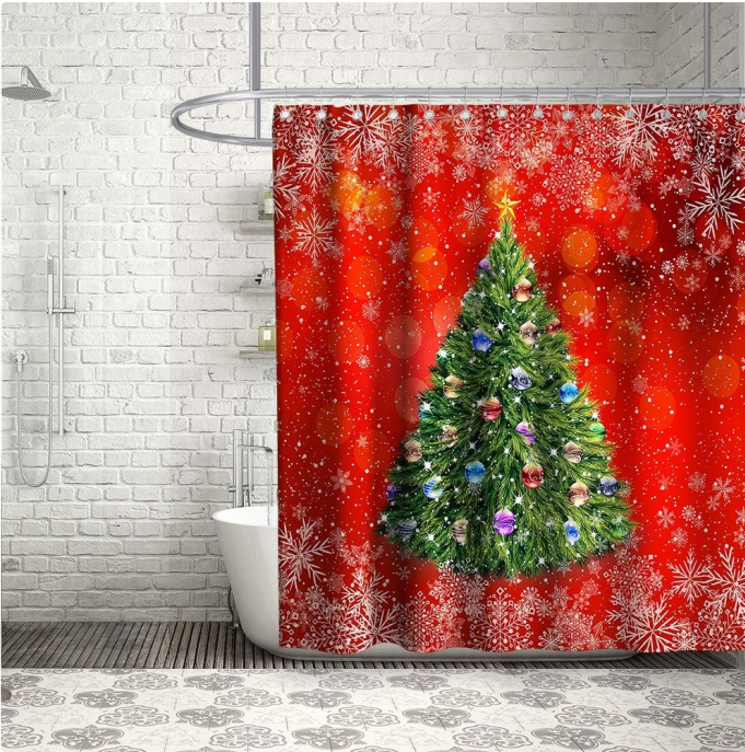
Image Description: A shower curtain featuring the same festive Christmas tree design as the previous image, shown installed in a bathroom setting. The bathroom has white brick walls, a white bathtub, and a patterned floor, illustrating a product in use within a home environment.

Image Description: A vibrant red background featuring numerous white snowflake patterns. In the center, a lush green Christmas tree is decorated with various colorful spherical ornaments and topped with a golden star. This image represents a festive theme.