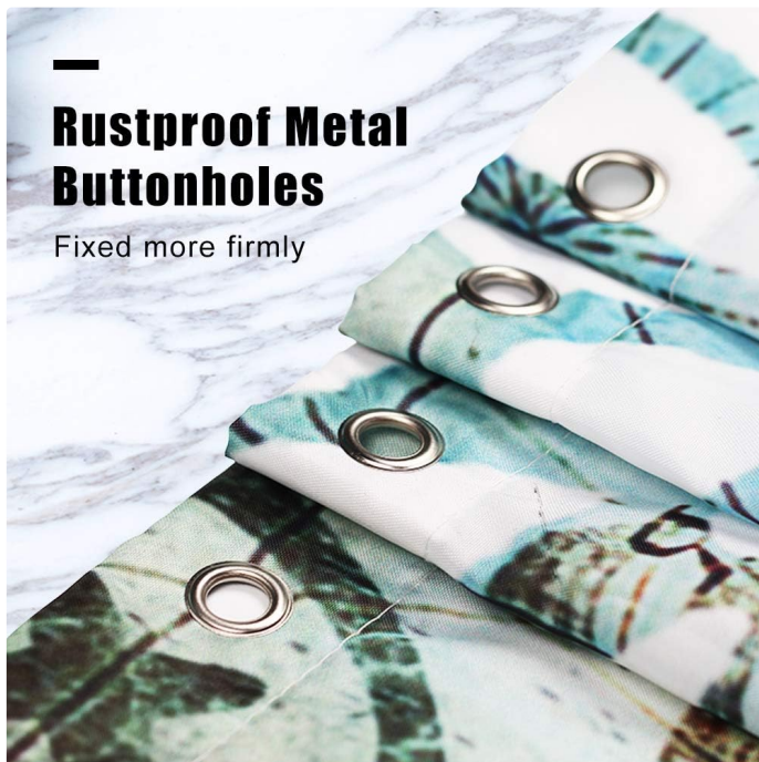
Image Description: A close-up view of a fabric material, likely a curtain, showing several rustproof metal buttonholes. The text "Rustproof Metal Buttonholes" and "Fixed more firmly" are visible, highlighting a durable feature of the material.

Image Description: A shower curtain featuring the same festive Christmas tree design as the previous image, shown installed in a bathroom setting. The bathroom has white brick walls, a white bathtub, and a patterned floor, illustrating a product in use within a home environment.