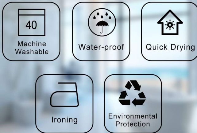
Image Description: A graphic displaying five icons related to product care and features. These include symbols for "Machine Washable" (at 40 degrees), "Water-proof," "Quick Drying," "Ironing," and "Environmental Protection," providing a visual summary of maintenance guidelines.