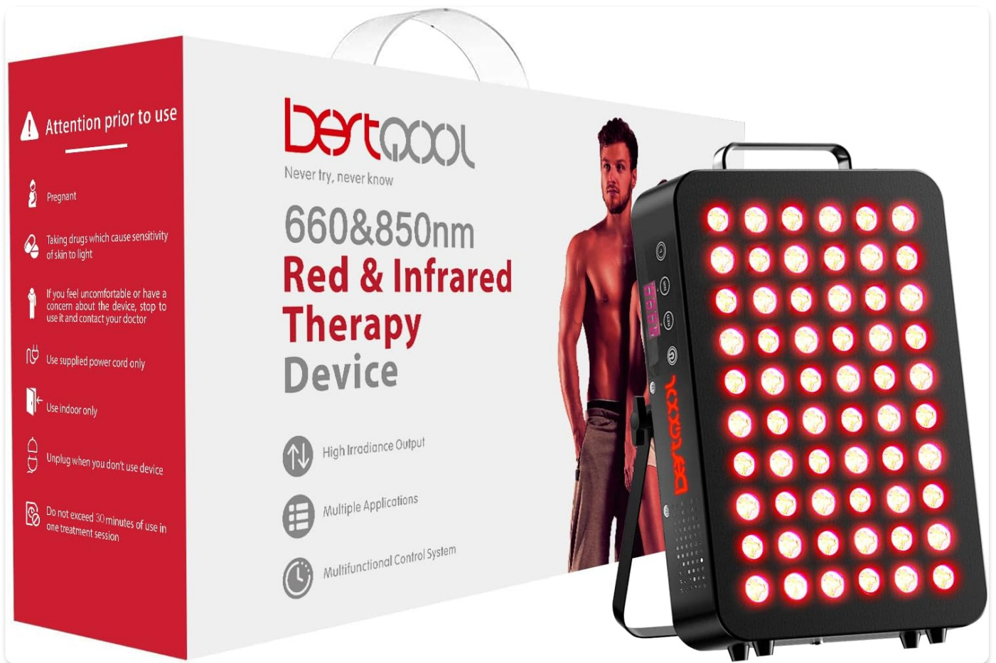
Figure 7: Key benefits include reduced joint pain, improved sleep, and boosted energy.