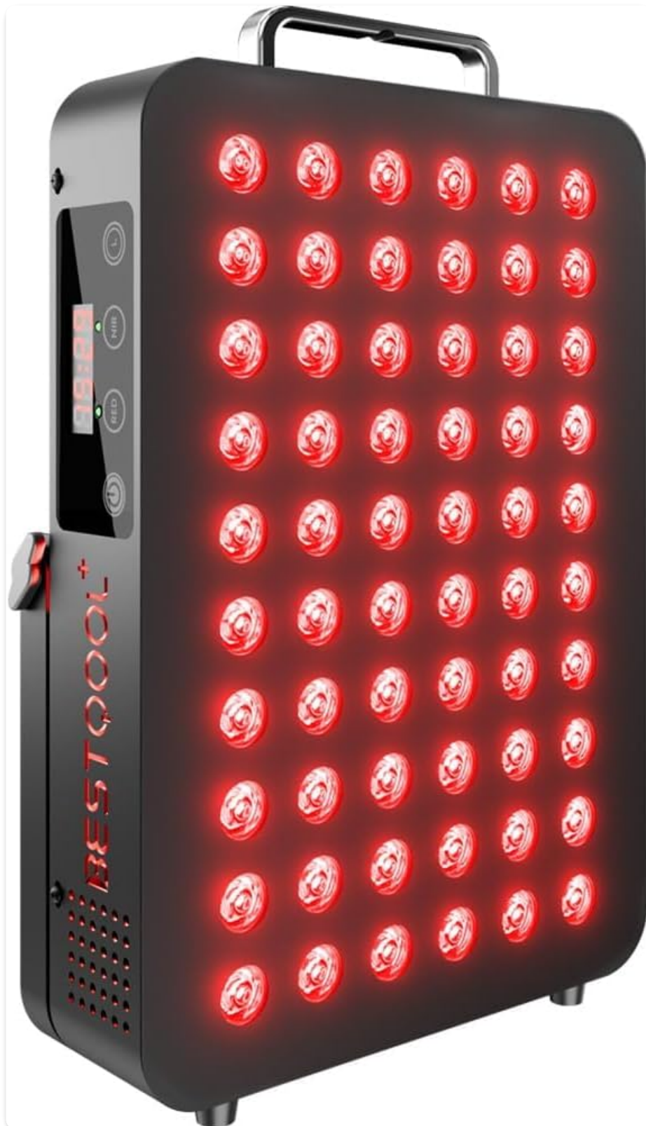
Figure 1: Bestqool Red Light Therapy Device (Model X60)