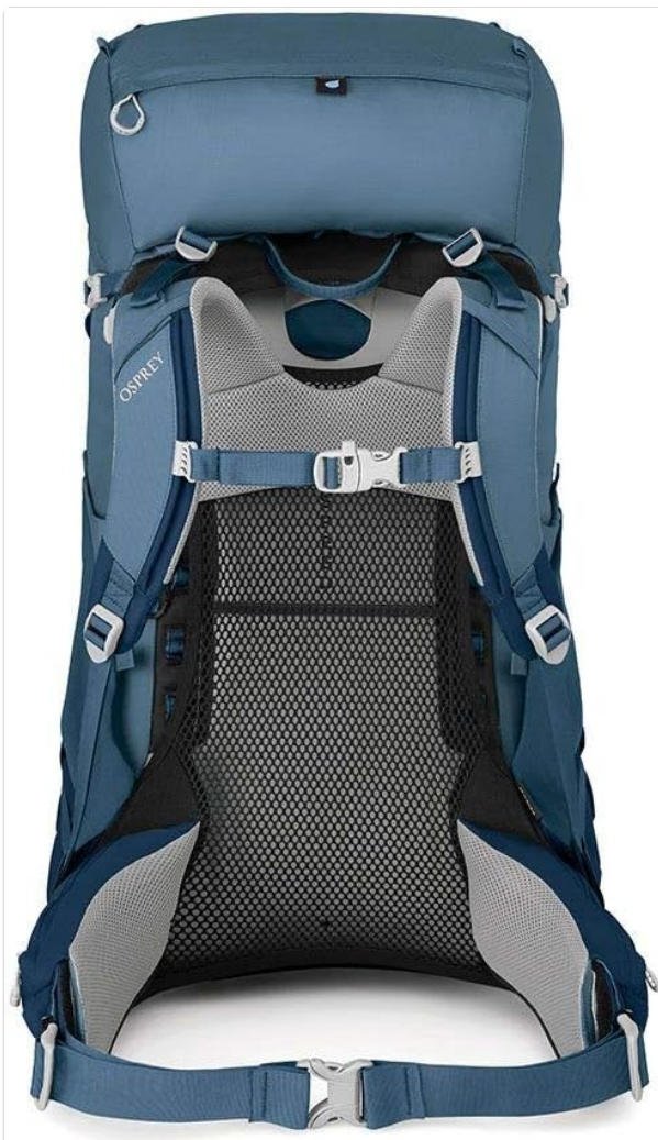
Rear view of the backpack, highlighting the tensioned