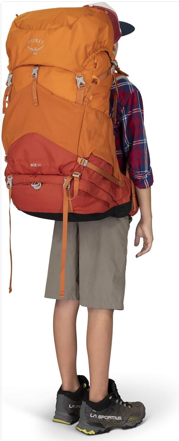
Adjustable sleeping pad straps at the bottom of the pack for external gear attachment.