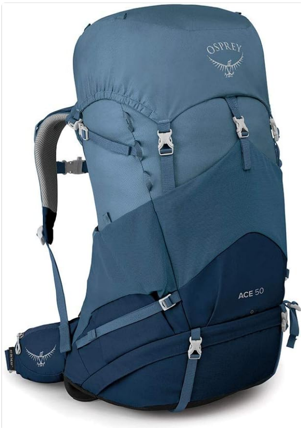
The Osprey Ace 50L Backpack in Blue Hills, showcasing its overall design and side profile.