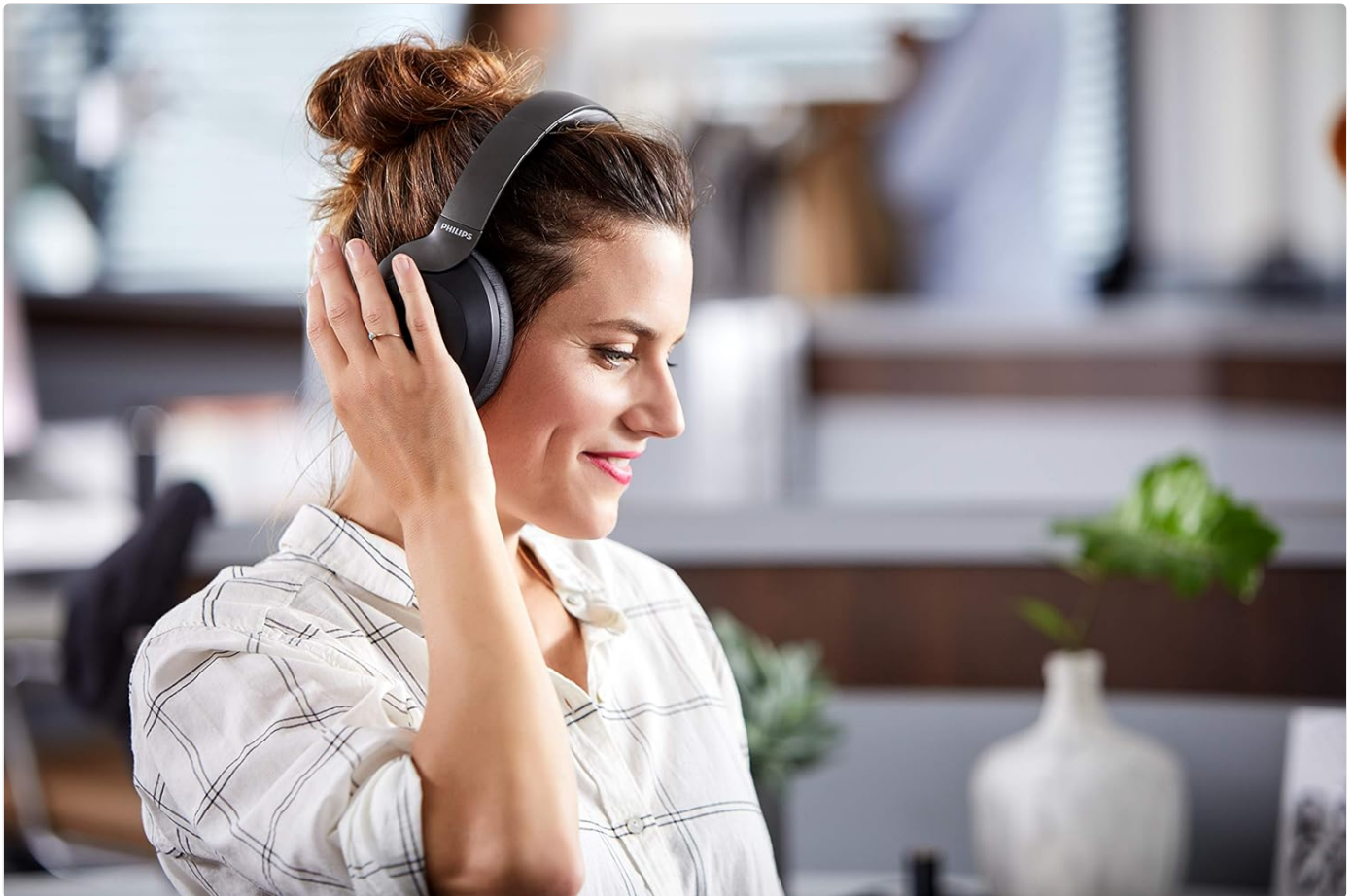
Image: A woman wearing the Philips TAPH805BK headphones, demonstrating comfortable usage.

Your browser does not support the video tag.