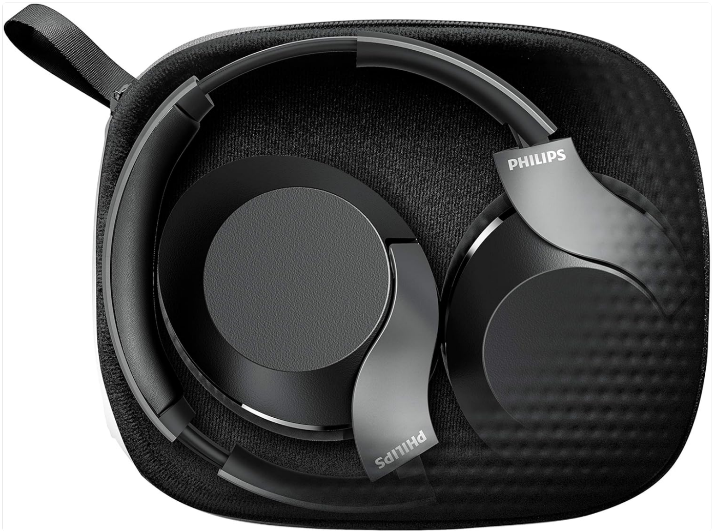
Image: Philips TAPH805BK Headphones folded neatly inside their protective carrying case.