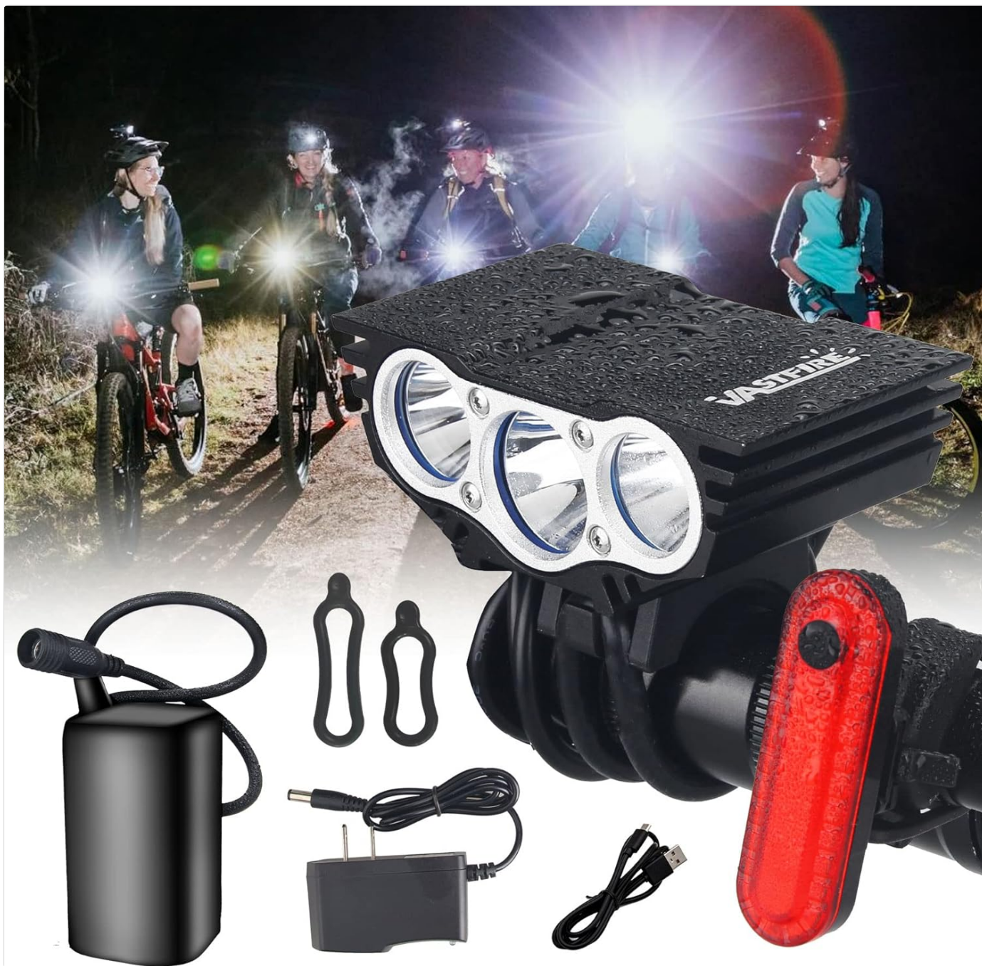
Image: Headlight mounting bracket with adjustable strap, suitable for handlebars and headbands.