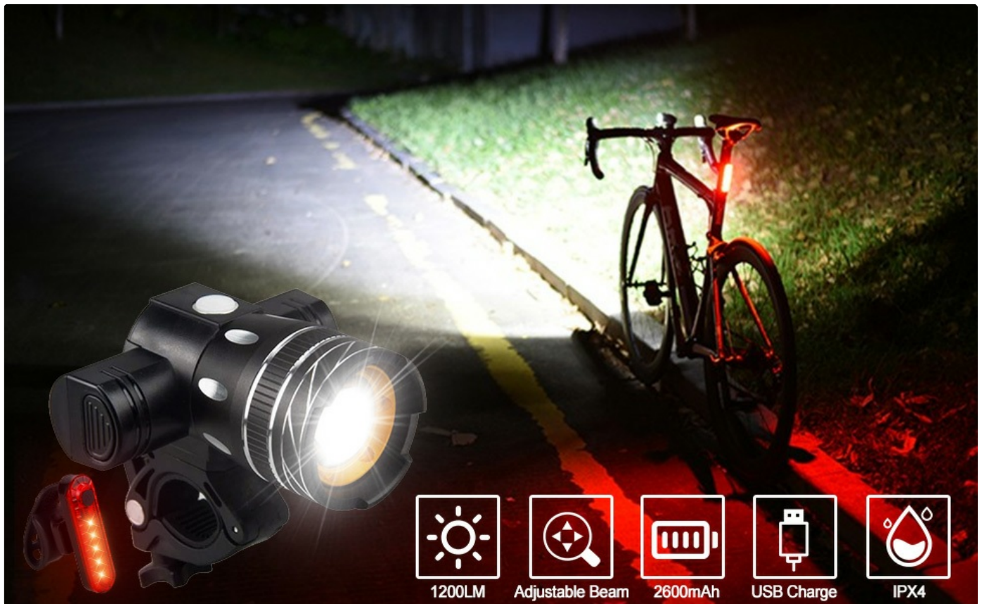
Image: Headlight with external battery pack indicating up to 24 hours of lasting power for extended cycling.