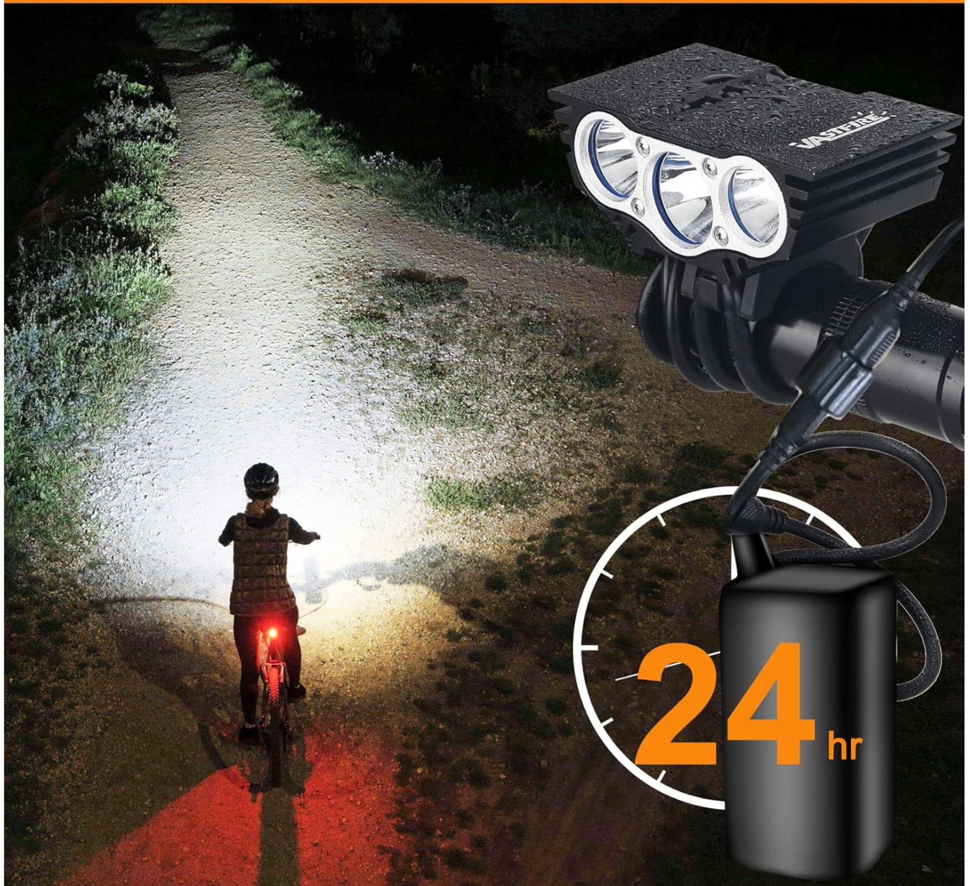
Image: VASTFIRE headlight illuminating a path during night riding, demonstrating its long-range capability.