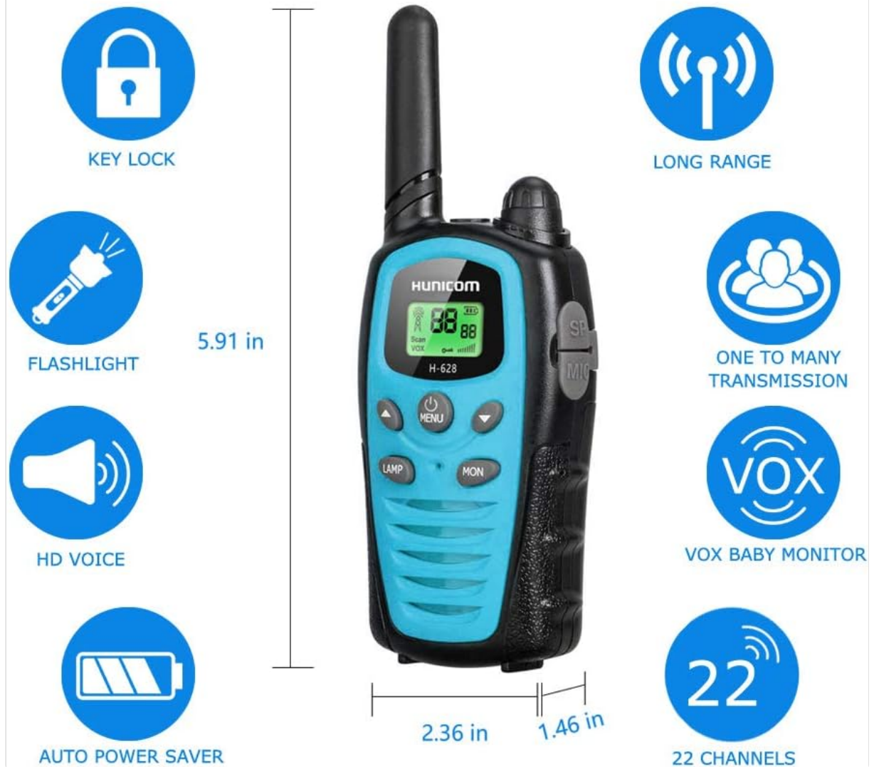
Image: HUNICOM H-628 Walkie Talkie highlighting its compact size (5.91 inches tall, 2.36 inches wide) and key features such as Key Lock, Long Range, Flashlight, One to Many Transmission, HD Voice, VOX Baby Monitor, Auto Power Saver, and 22 Channels.