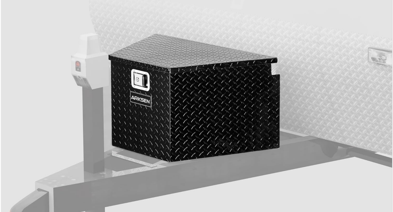
Figure 4.1: Versatile applications of the ARKSEN tool box, including pickup trucks, RVs, and trailers.