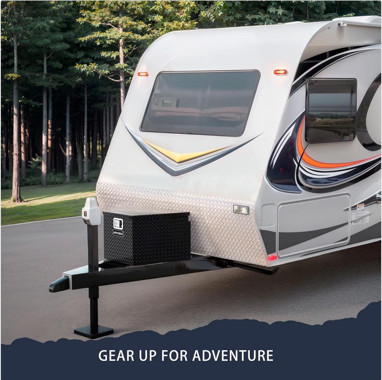
Figure 4.2: Example of the ARKSEN tool box securely mounted on a trailer tongue.