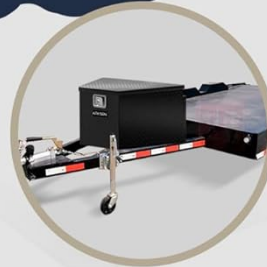
Used in Trailers