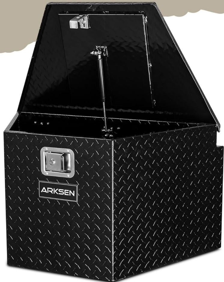
Figure 5.1: The ARKSEN tool box with its lid open, revealing the spacious interior and robust construction.