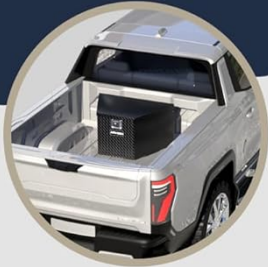
Used in Pick-up

Can be Used in Pick-up, RVs, ATVs, Trailers, Garages