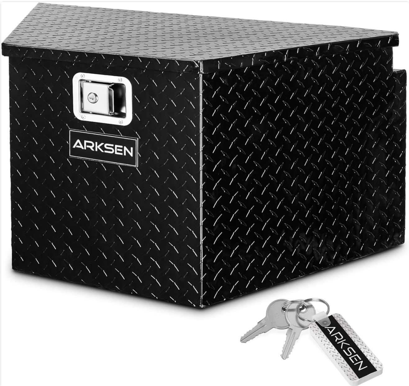
Figure 1.1: ARKSEN 33 Inch Black Diamond Plate Aluminum Trailer Tongue Box with included keys.