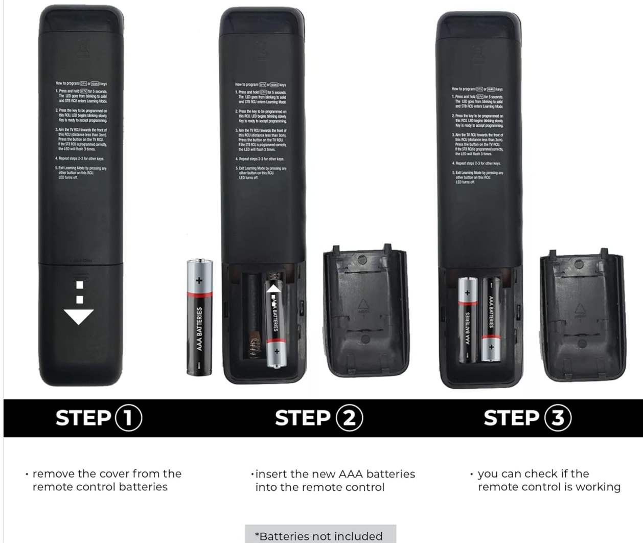
Figure 3.1: Visual guide for battery installation and the three-step process for programming the remote control's learning keys.