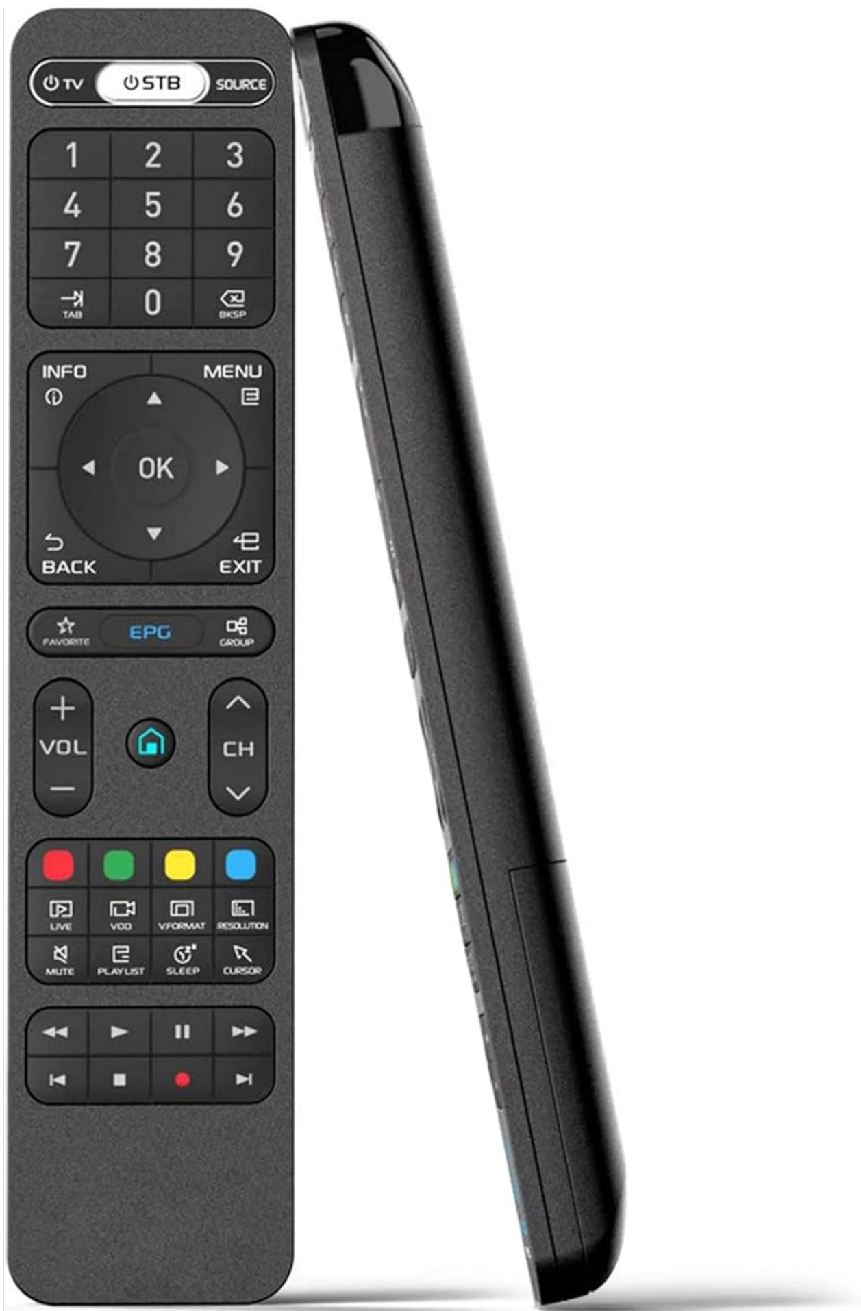
Figure 2.1: Front and side view of the Formuler Original Remote Control, highlighting its ergonomic design and button layout.