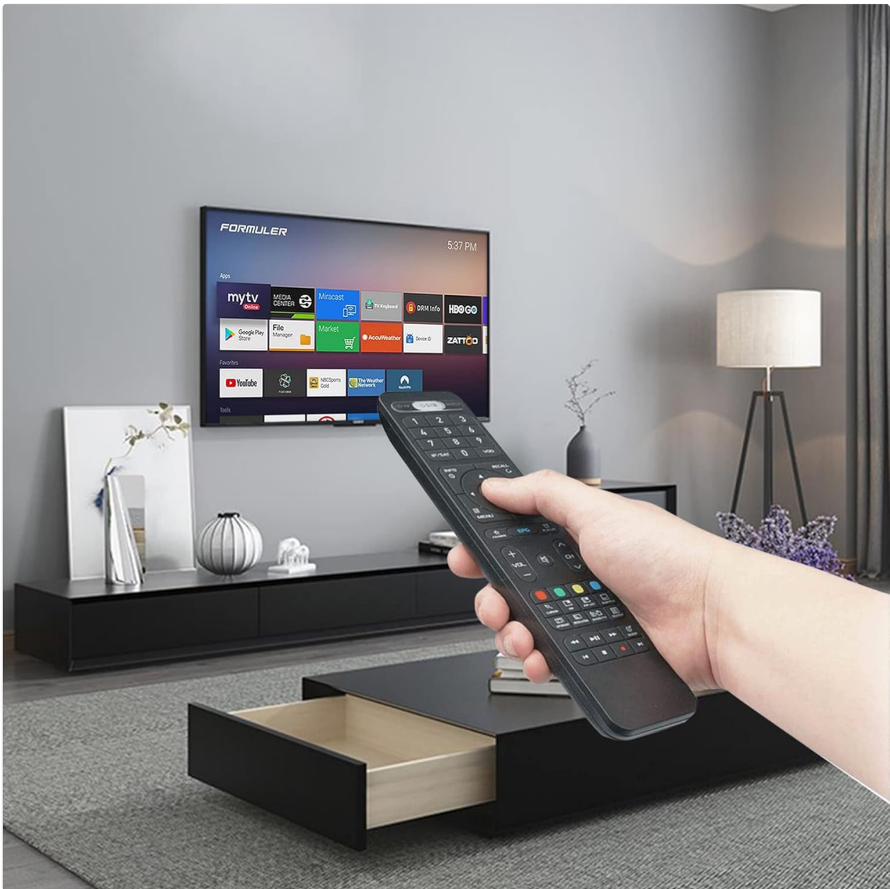
Figure 4.1: The Formuler remote control in use, demonstrating its comfortable grip and ease of operation while controlling a Formuler device connected to a television.