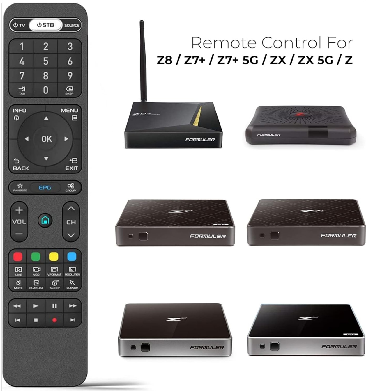
Figure 2.2: The Formuler remote control displayed with several compatible Formuler IPTV box models, illustrating its intended use with these devices.