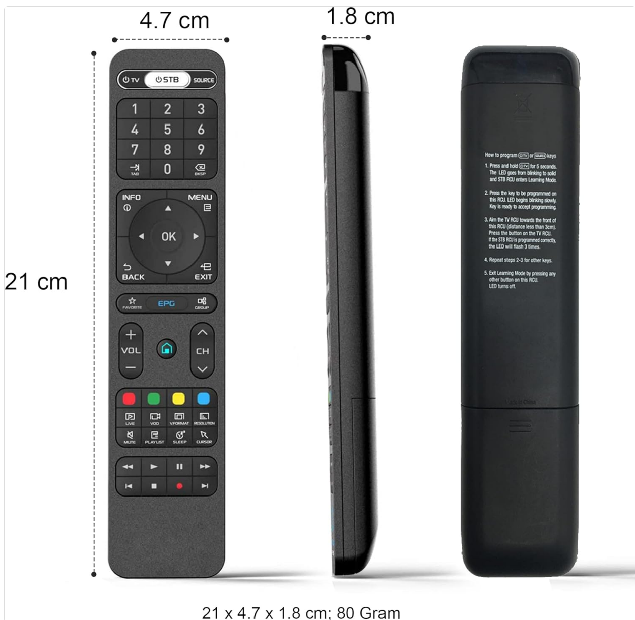
Figure 7.1: Dimensional overview of the Formuler remote control, indicating its length, width, and thickness in centimeters.