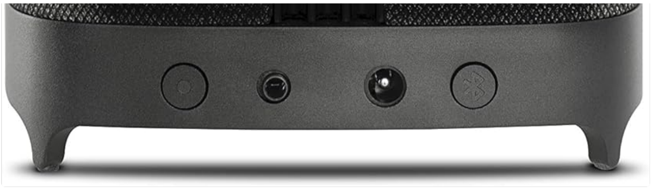
Rear view of the Altice Amplify Smart Speaker, showing the optical input and power port.