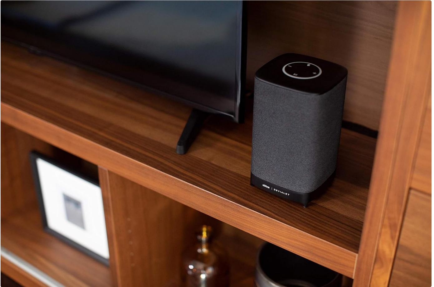
The Altice Amplify speaker positioned on a shelf, ideal for TV audio.

Place your Altice Amplify speaker indoors on a stable, flat surface such as a tabletop or floor. Ensure it is positioned to provide optimal sound distribution in your desired listening area.