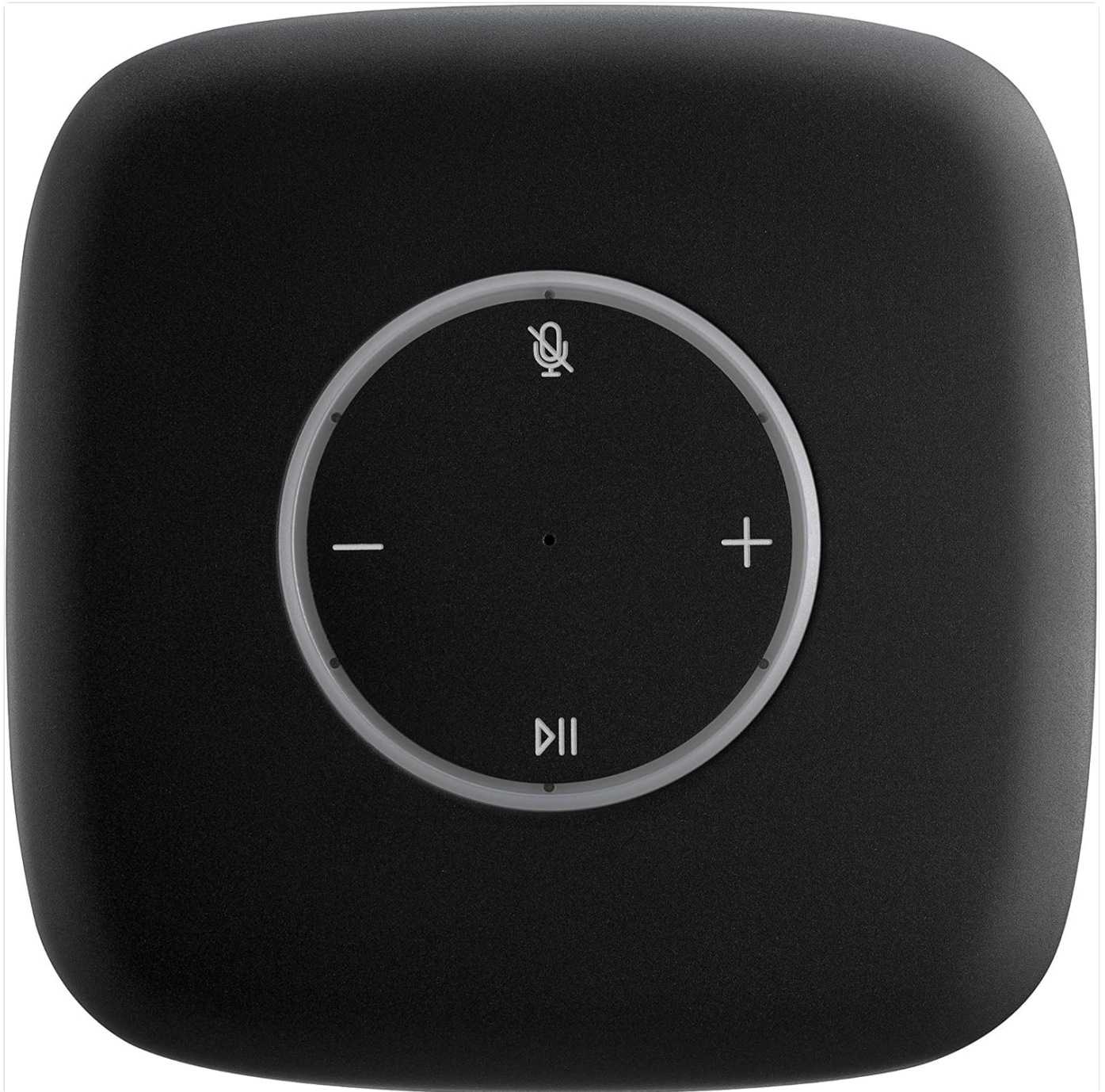
Top view of the Altice Amplify Smart Speaker, highlighting the touch-sensitive control panel for volume, play/pause, and microphone mute.