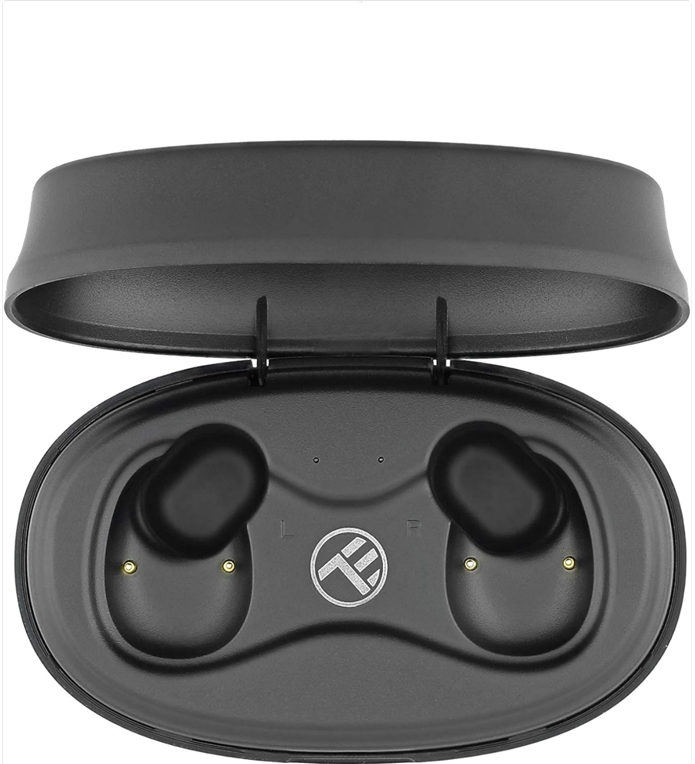
Image: A close-up view of the TELLUR Mood Earbuds charging contacts within the charging case, illustrating how the earbuds connect for power.

Note: A full charge for the earbuds takes approximately 1 hour. The charging case battery is 420mAh, and each earbud battery is