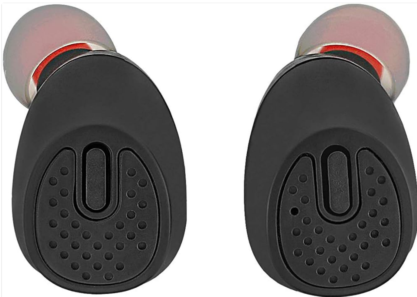
Image: Close-up of the TELLUR Mood Earbuds, indicating the touch-sensitive area for control inputs.