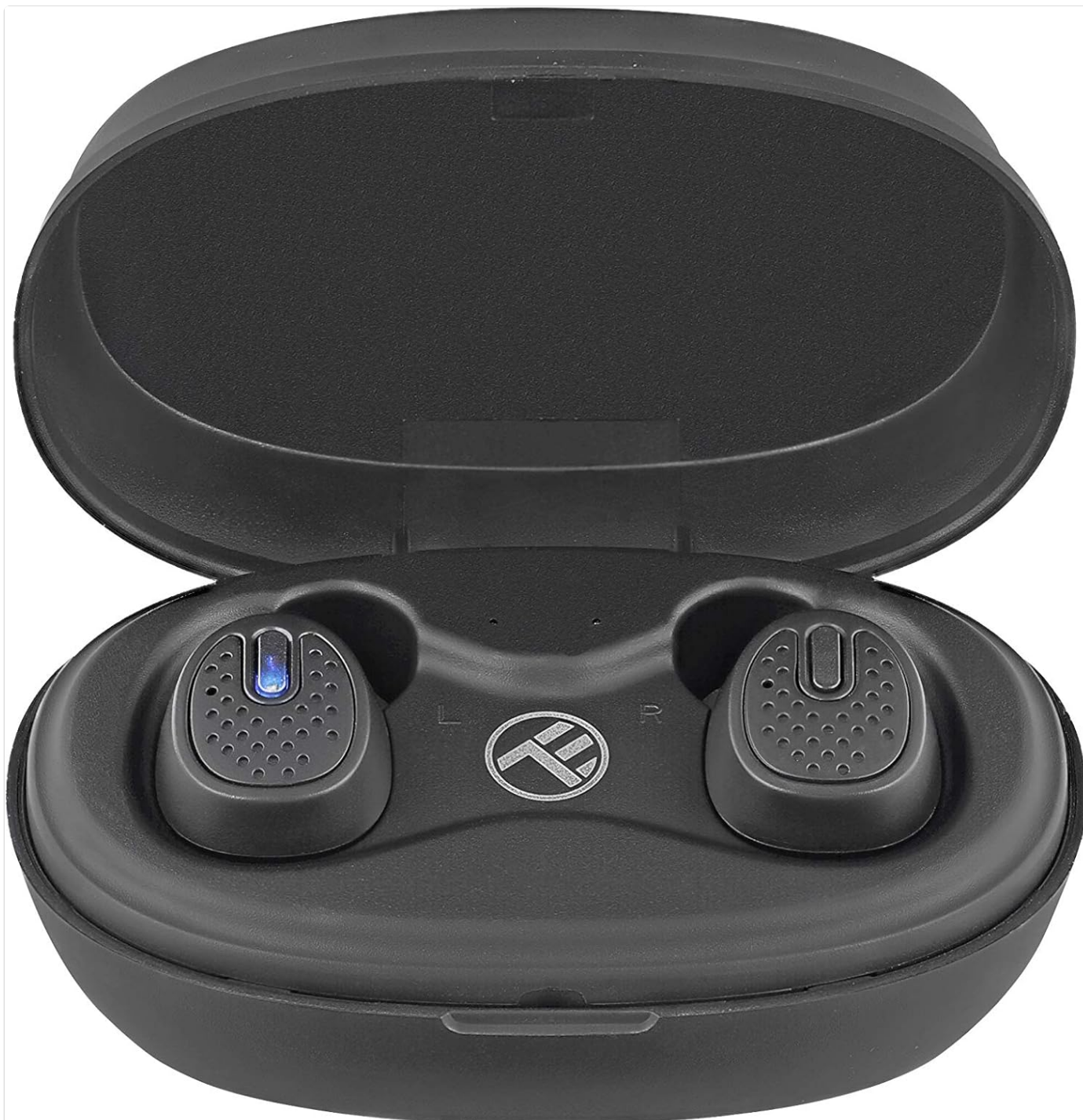
Image: The TELLUR Mood True Wireless Earbuds resting inside their open charging case, showcasing their compact design and the charging contacts.