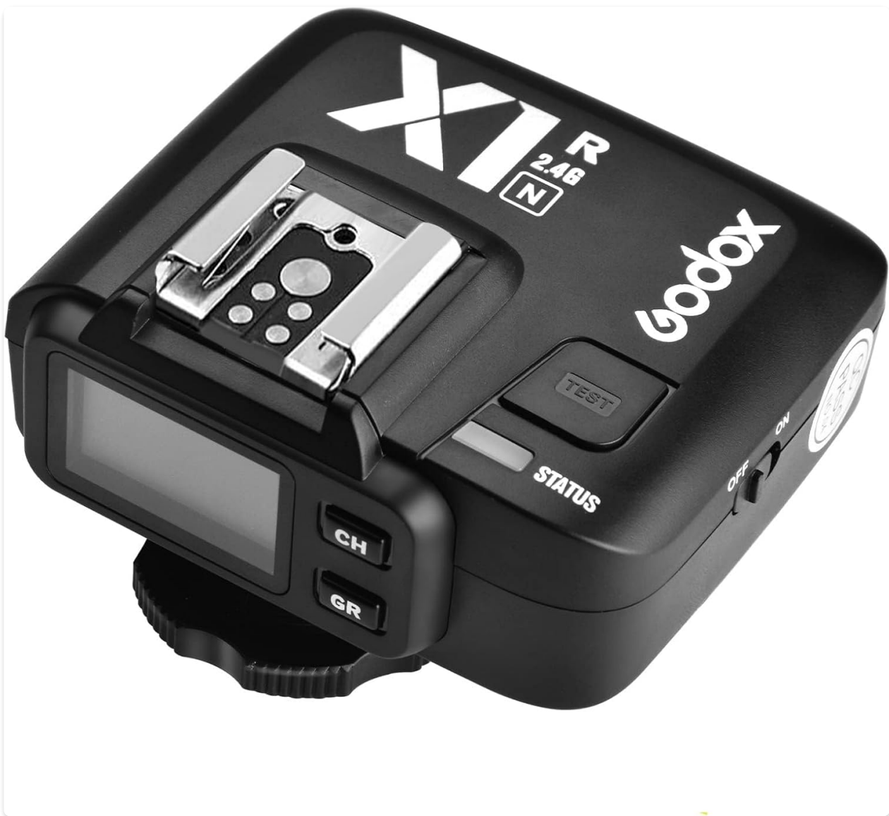
Figure 1.1: Godox X1R-N Wireless Flash Trigger Receiver.