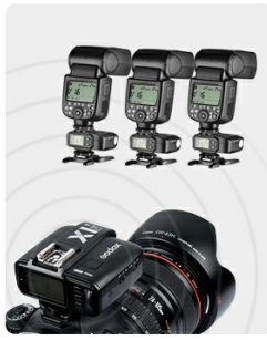
Wireless Speedlite Trigger