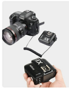
Wireless camera shutter