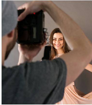
Off camera shooting