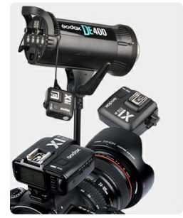
wireless Studio Flash Trigger