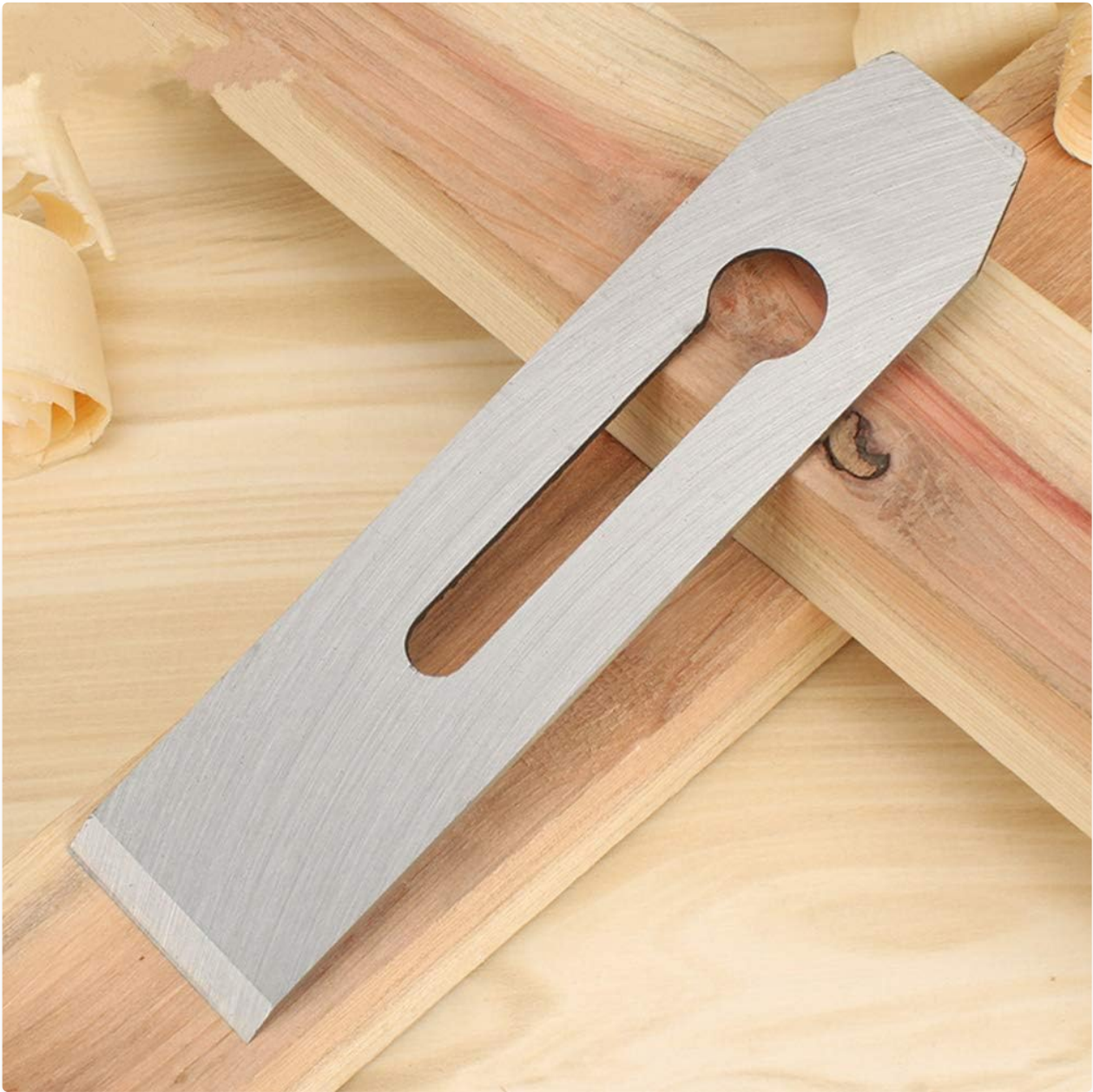
SEAFRONT 44mm HSS Hand Planer Blade resting on a wooden surface with wood shavings, illustrating its function in woodworking.