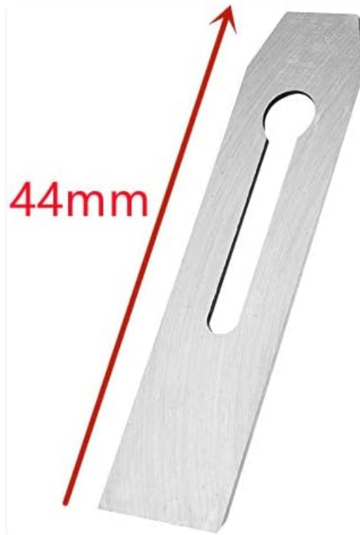
Image illustrating the 44mm width of the SEAFRONT HSS Hand Planer Blade, clearly indicating its size.