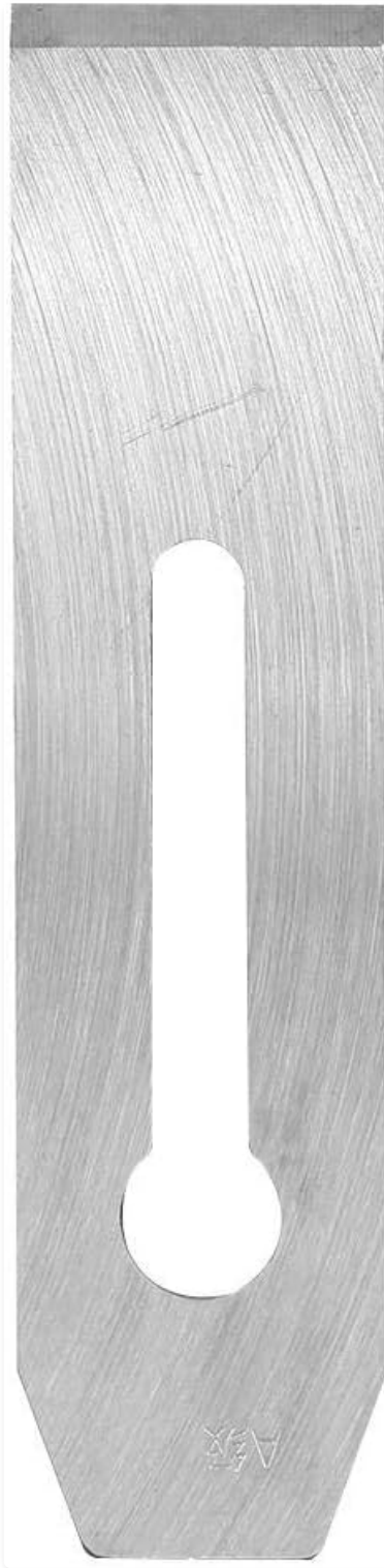
SEAFRONT 44mm HSS Hand Planer Blade. This image shows the full length of the planer blade, highlighting its metallic finish and central slot for mounting.