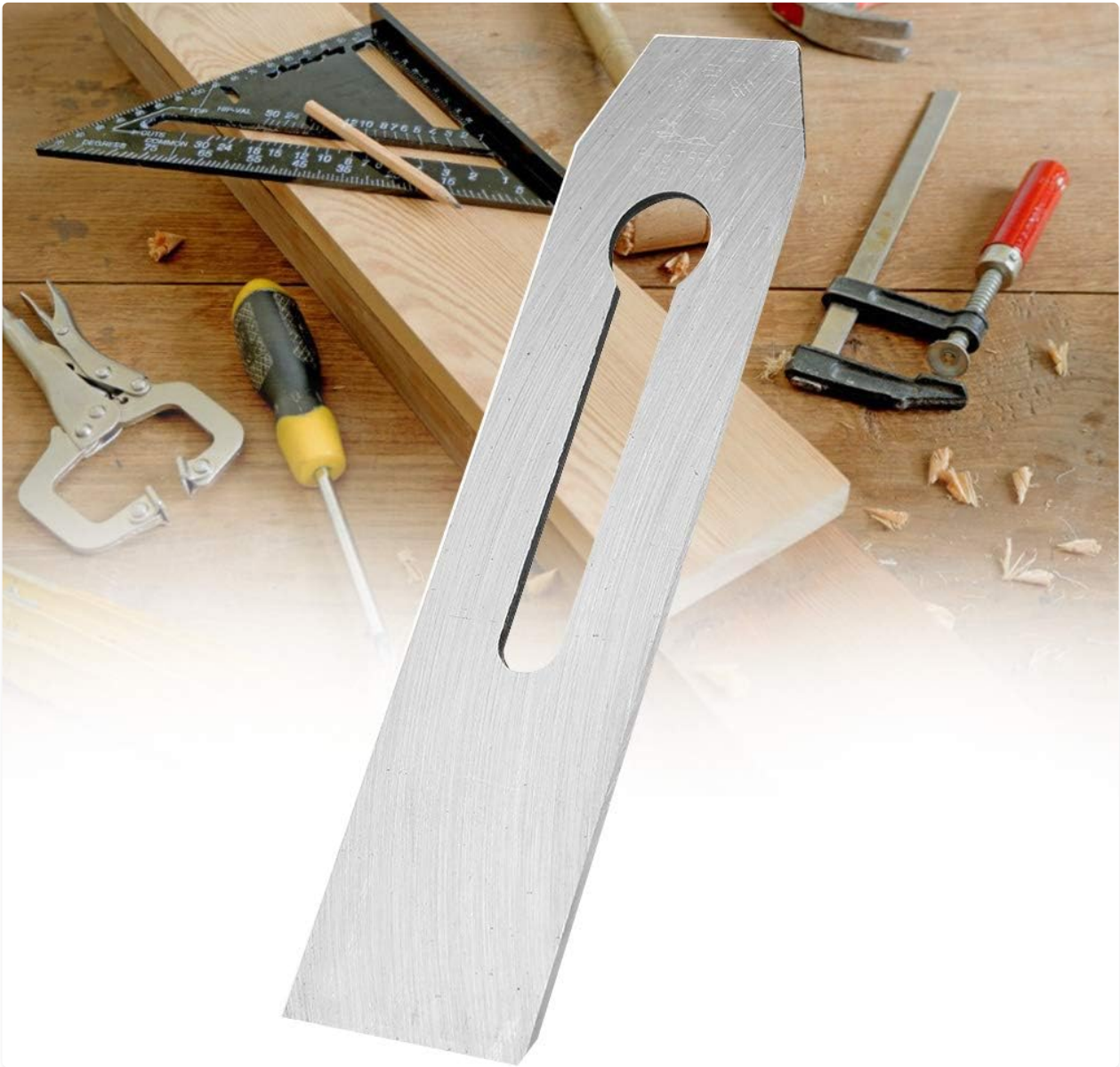
SEAFRONT 44mm HSS Hand Planer Blade shown in a woodworking environment, suggesting its application in a hand planer.