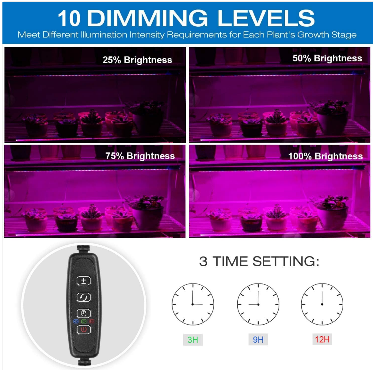
Image 4: Visual representation of the four dimmable brightness levels.