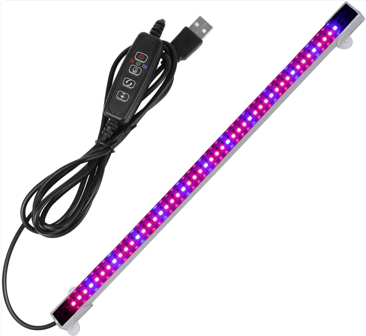
Image 1: The Sondiko LED Grow Light Strip with its attached controller and USB cable.

The Sondiko LED Grow Light Strip features 48 high-quality LED bulbs designed to provide a full spectrum of light (420-800nm) essential for plant growth. It includes an integrated controller for managing power, brightness, and timing functions.