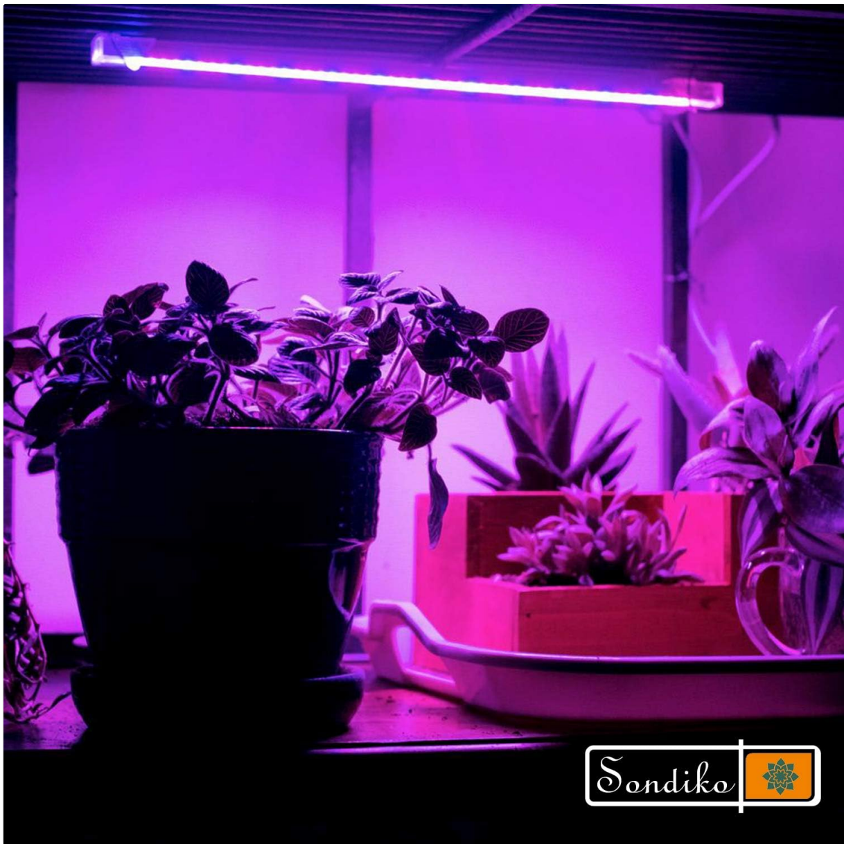
Image 3: Example installation of the grow light strip above indoor potted plants.