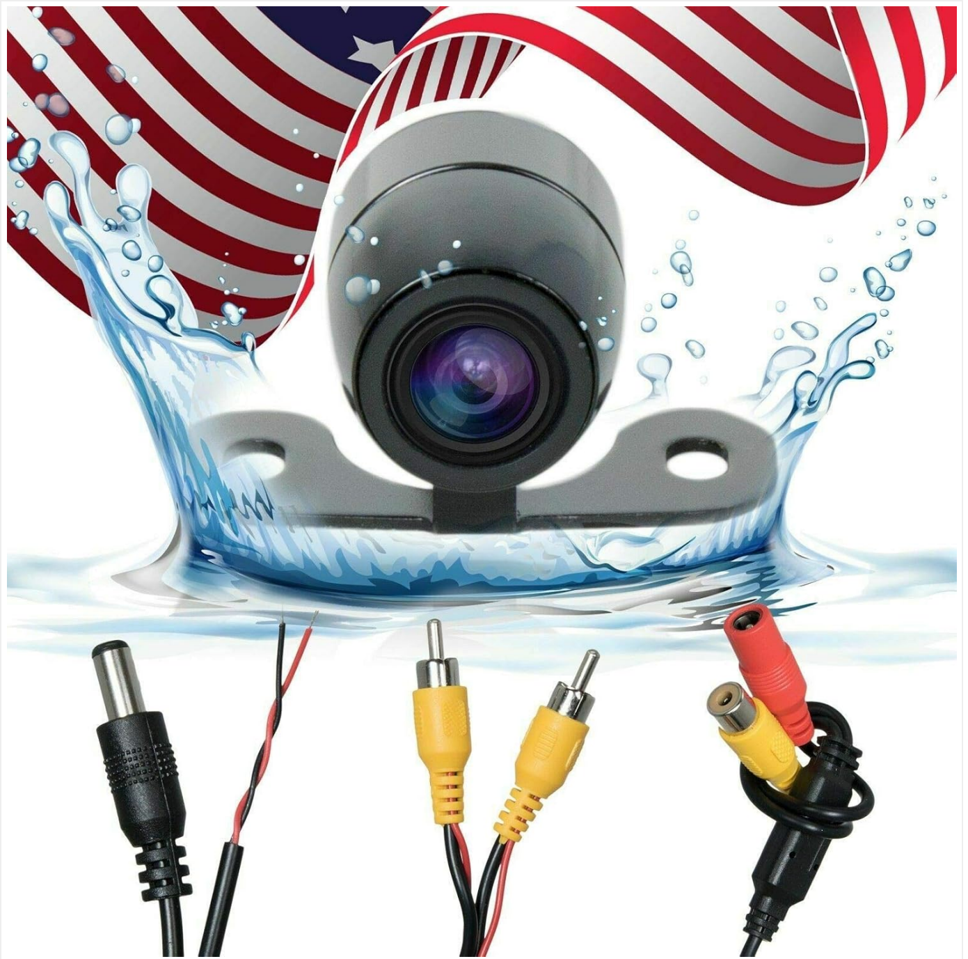
Figure 2: Optional rear view camera and its connection cables.