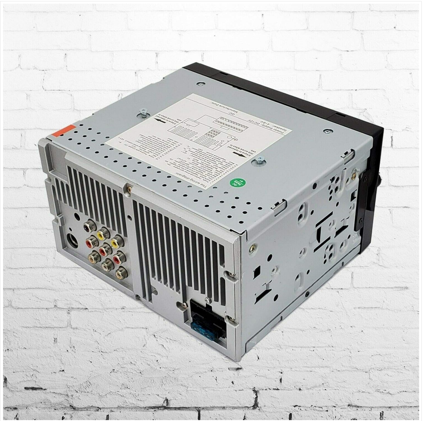
Figure 4: Rear view of the car stereo unit with connection ports. The rear panel houses all necessary connections for power, speakers, and external devices.