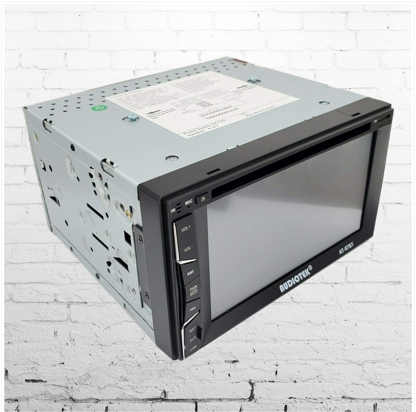
Figure 3: Front view of the car stereo unit.

The front panel features a 6.2-inch digital TFT touchscreen display. On the left side, you will find physical buttons for common functions: