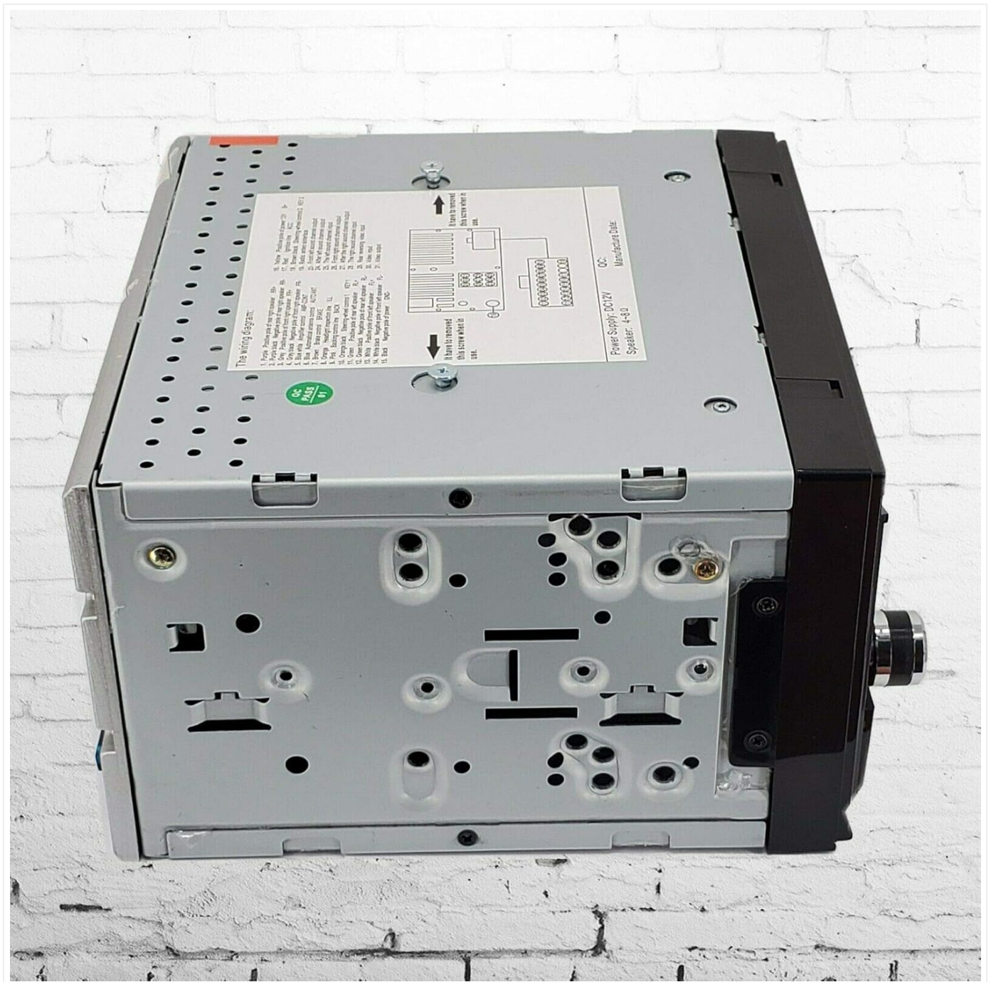
Figure 5: Side view of the car stereo unit.