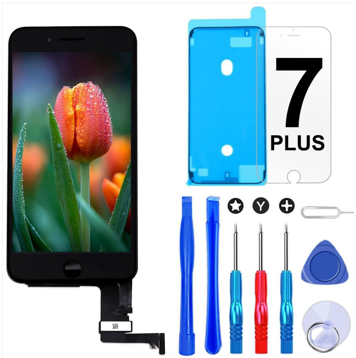
Image 1.1: The Brinonac iPhone 7 Plus screen replacement kit, including the LCD digitizer assembly and a set of repair tools.