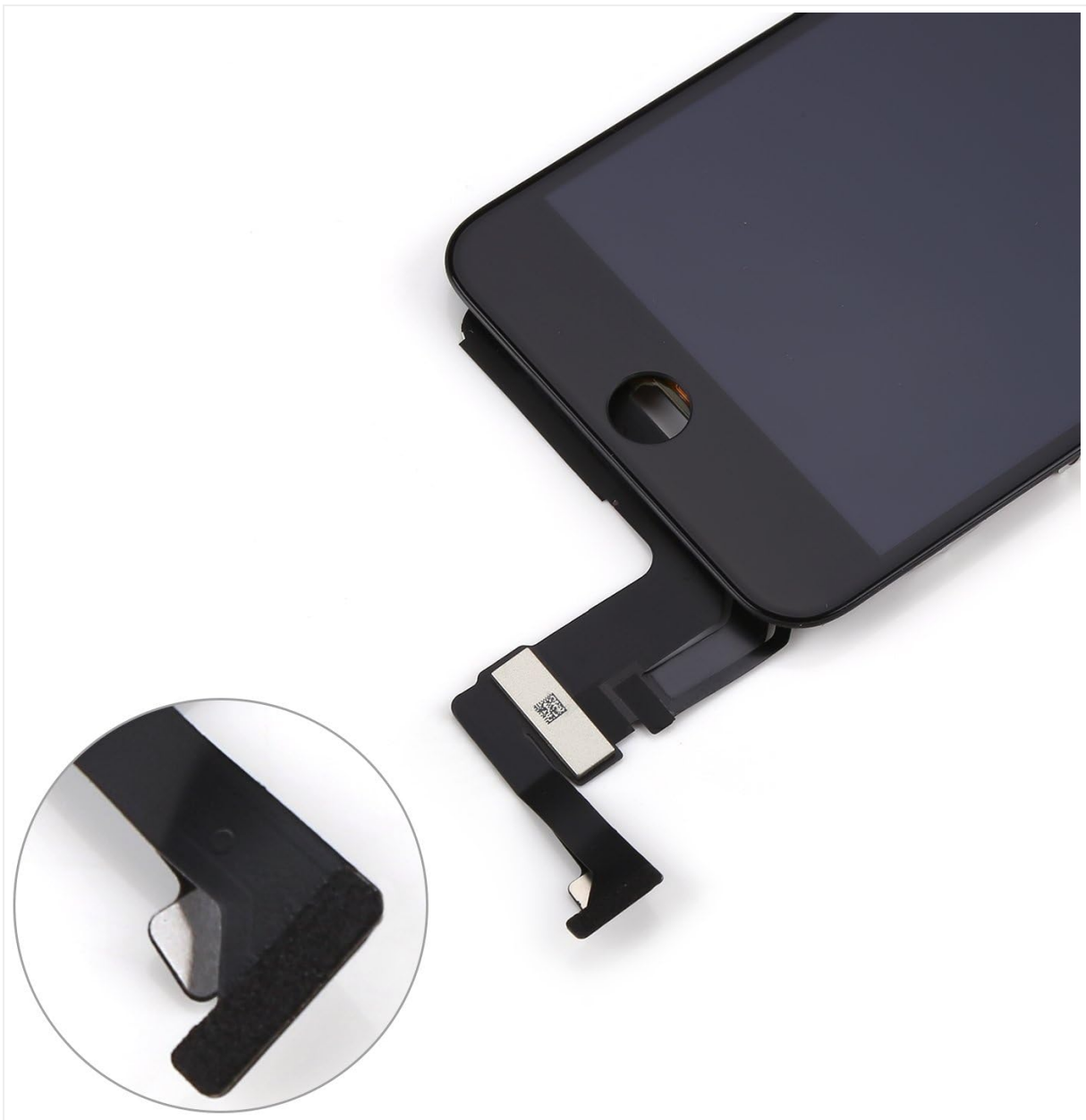
Image 4.1: A close-up view of the flexible ribbon cables and connectors on the back of the replacement screen, which connect to the iPhone's logic board.