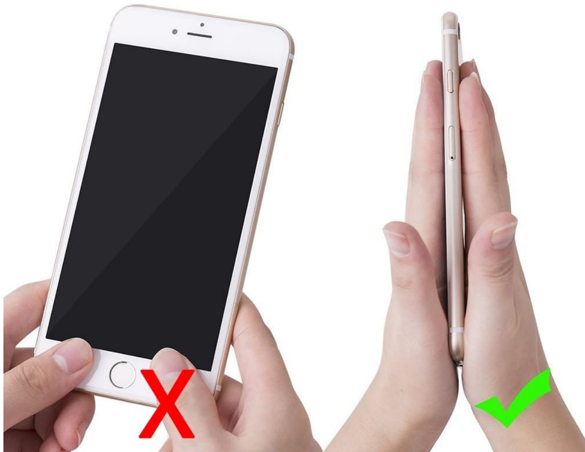
Image 2.2: Illustration demonstrating the correct method for installing the screen to prevent damage, contrasting with an incorrect method.