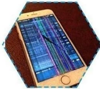
Display and color issue