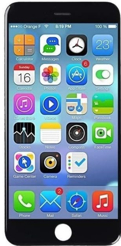
Image 2.1: Visual reminder to test the screen's functionality before completing the installation process.