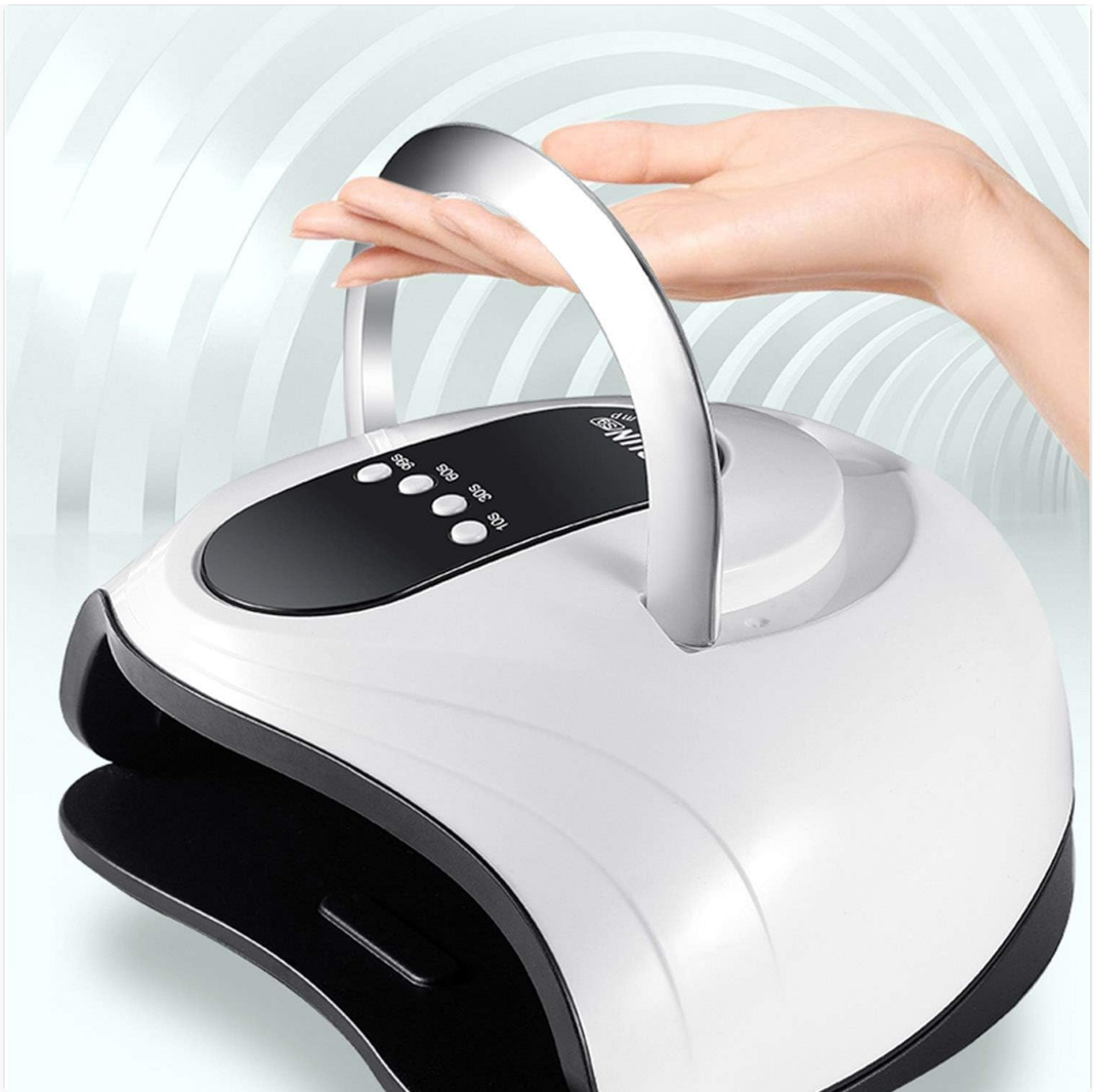
Figure 4: The detachable base allows for versatile use and easy cleaning.