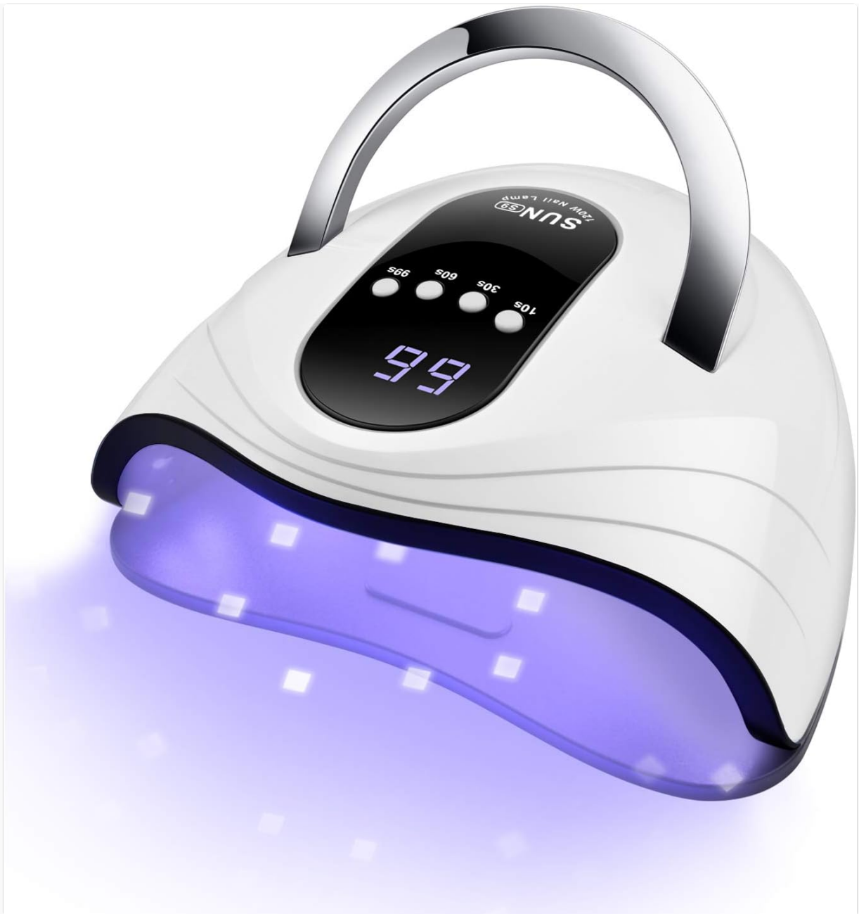
Figure 1: The Sunrich UV Gel Nail Lamp connected to its power adapter, ready for operation.