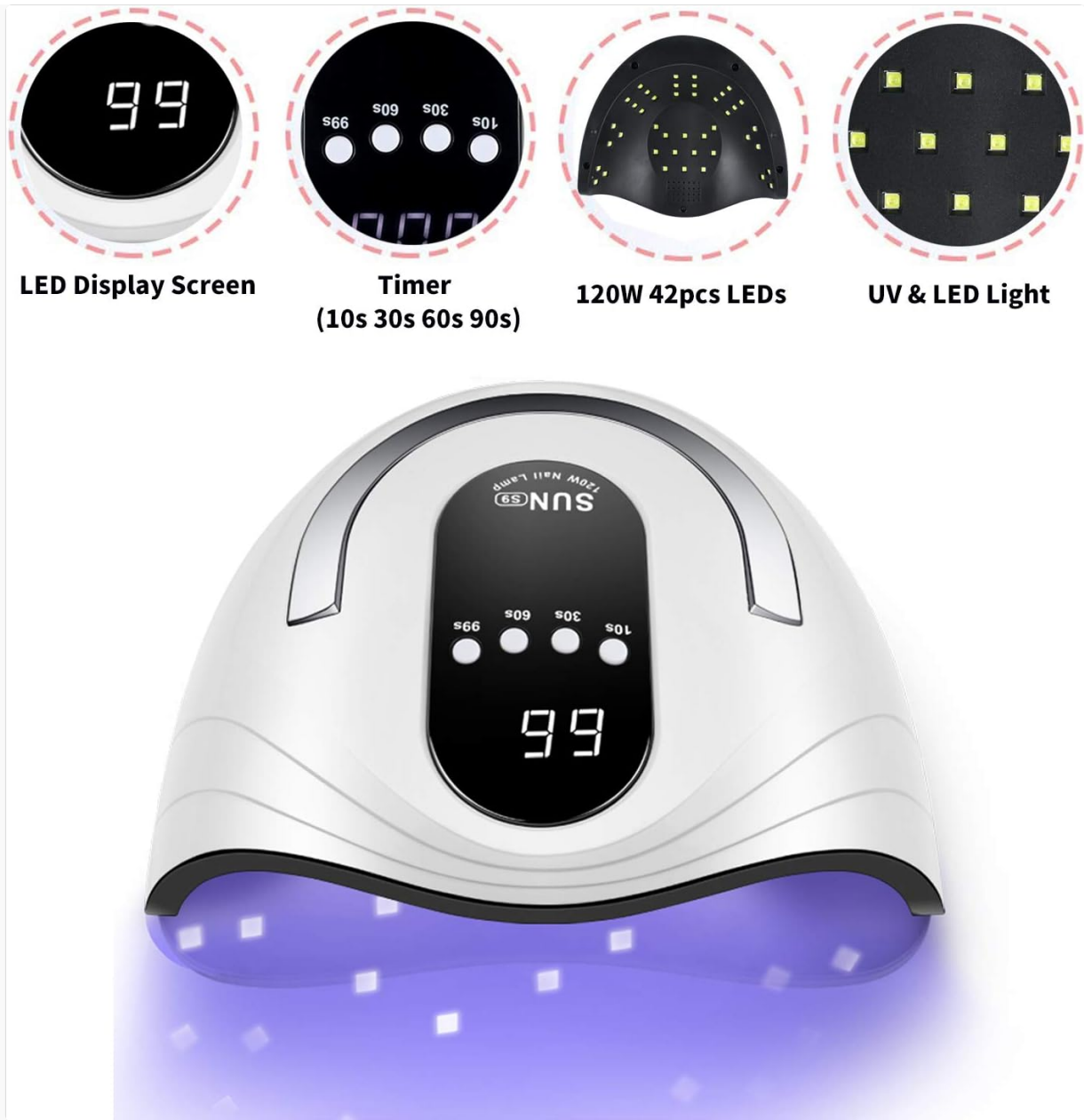
Figure 2: The control panel showing the timer buttons and digital display.