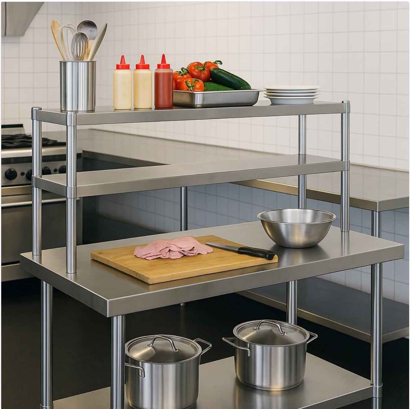
Figure 4.2: The work table providing a clean and spacious surface for food preparation tasks.