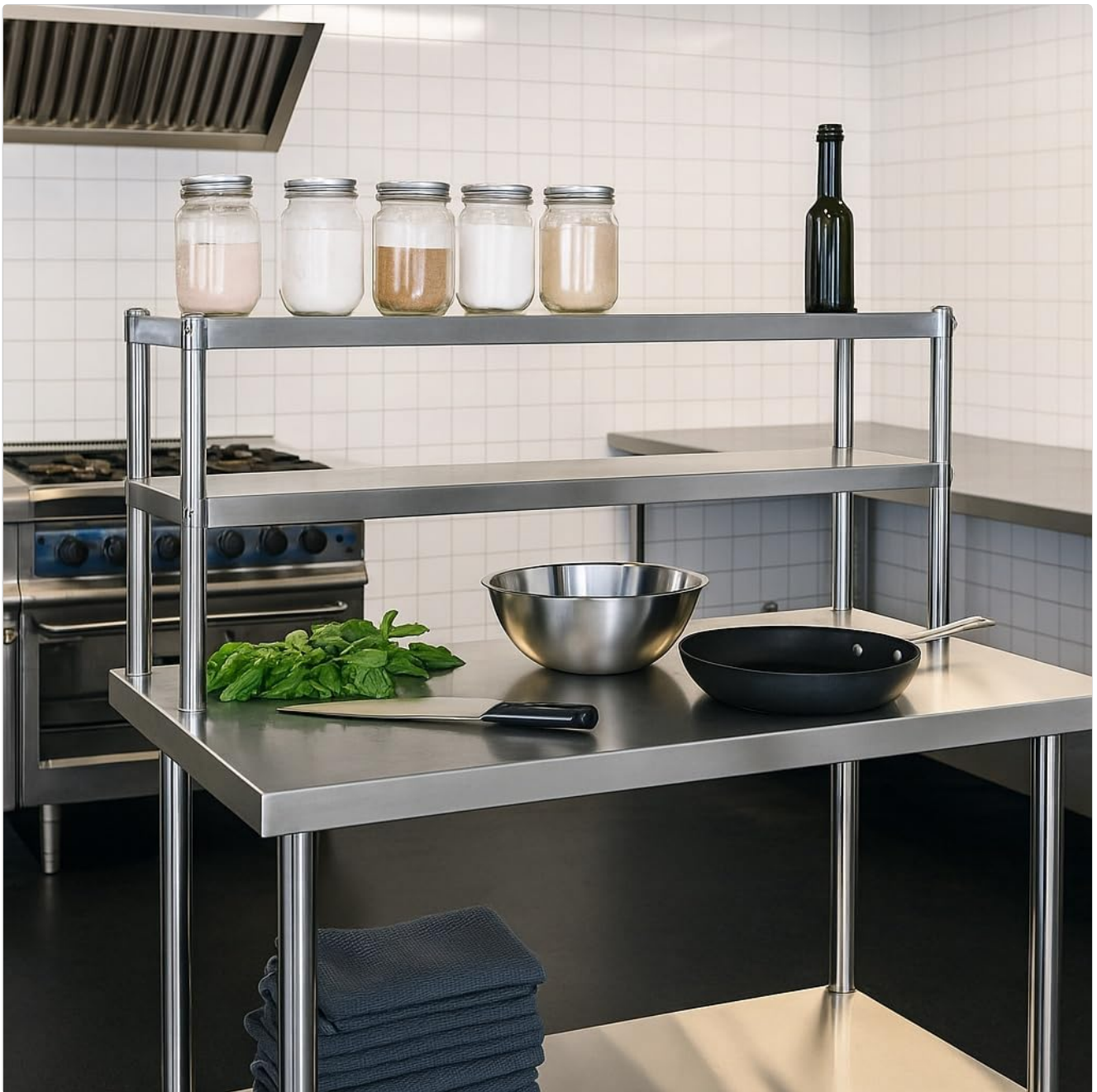
Figure 4.1: The work table in a kitchen environment, demonstrating its use for organizing ingredients and small appliances.