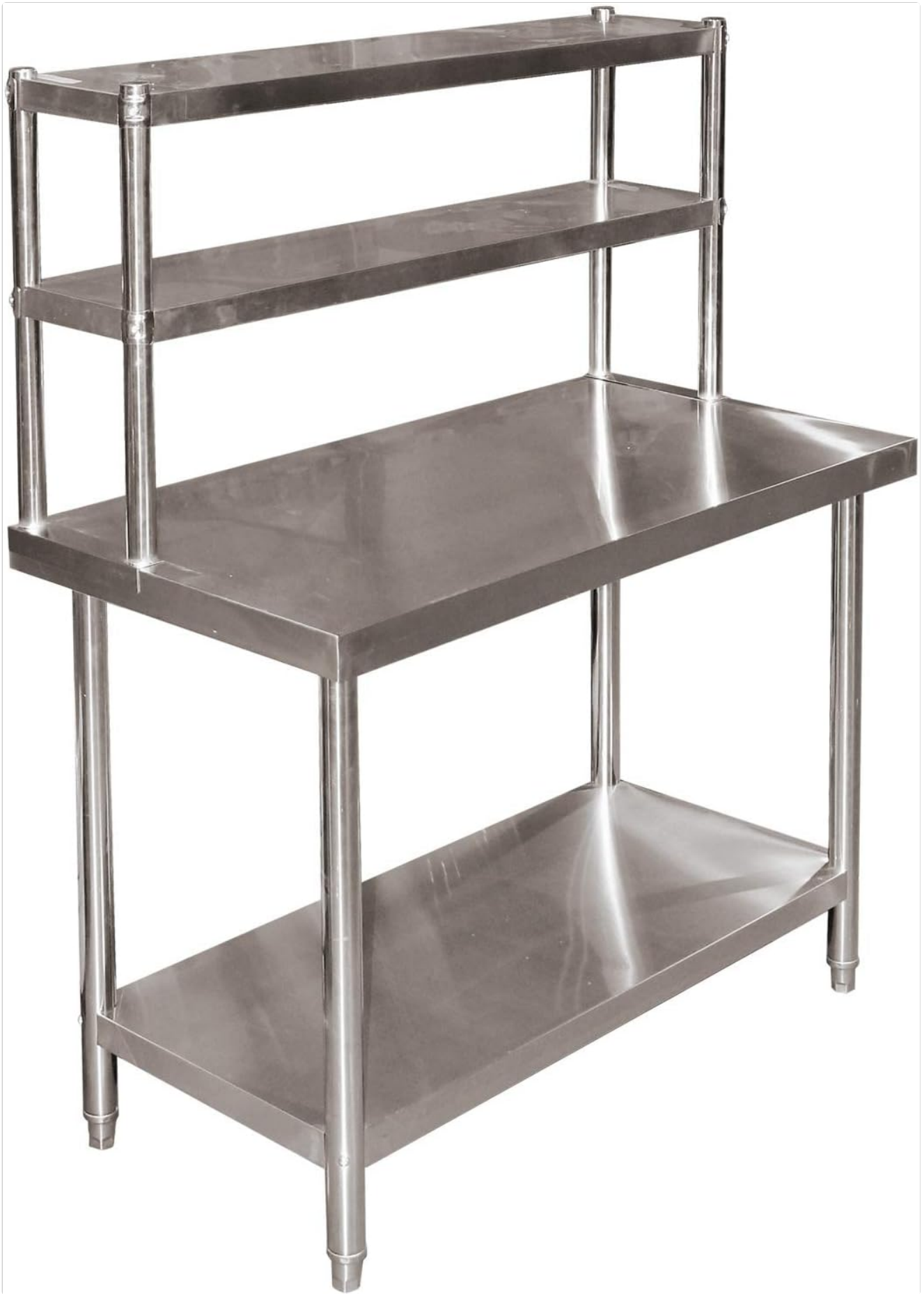
Figure 2.1: The WilTec Stainless Steel Work Table, Model 61841, featuring its main work surface and integrated 2-tier upper shelf.