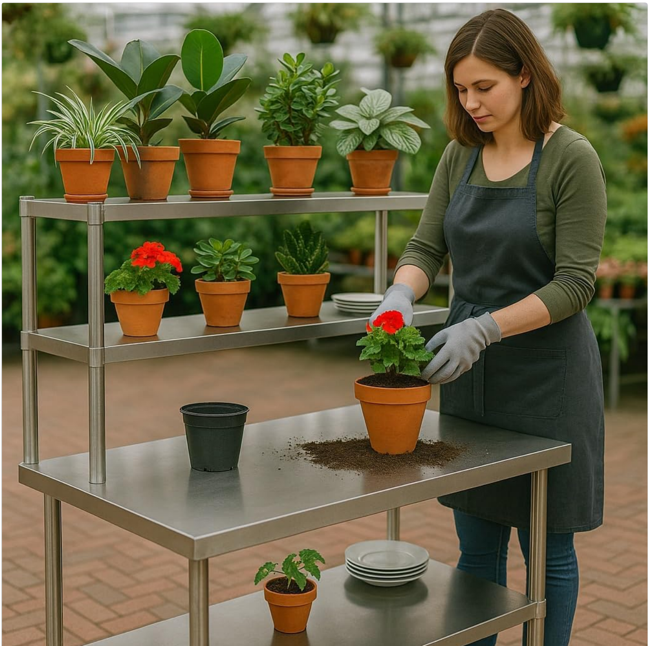
Figure 4.3: A user performing gardening tasks on the work table, highlighting its versatility for various applications.