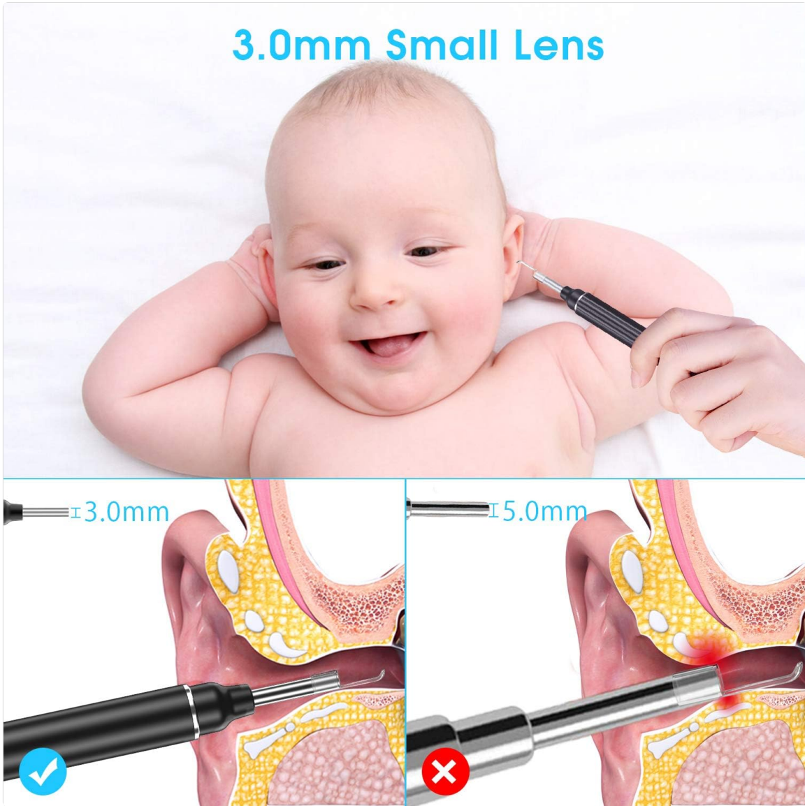
Image: Diagram illustrating the smaller 3.0mm lens size for safer and more comfortable insertion into the ear canal, contrasting it with a larger 5.0mm lens.