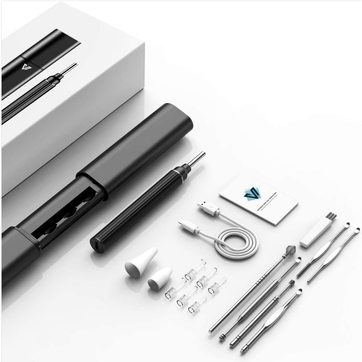
Image: All components included in the VITCOCO Otoscope Ear Camera package, including the otoscope, various ear spoons, charging cable, and protective caps.