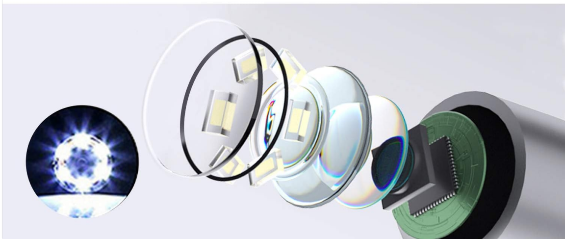
Image: Visual comparison demonstrating the superior clarity of the 5 Megapixel 1920P HD lens compared to a standard 720P lens, showing detailed views of the eardrum.