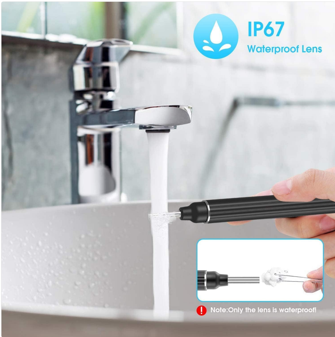
Image: The IP67 waterproof lens of the VITCOCO otoscope being cleaned under running water, demonstrating its resistance to liquids.