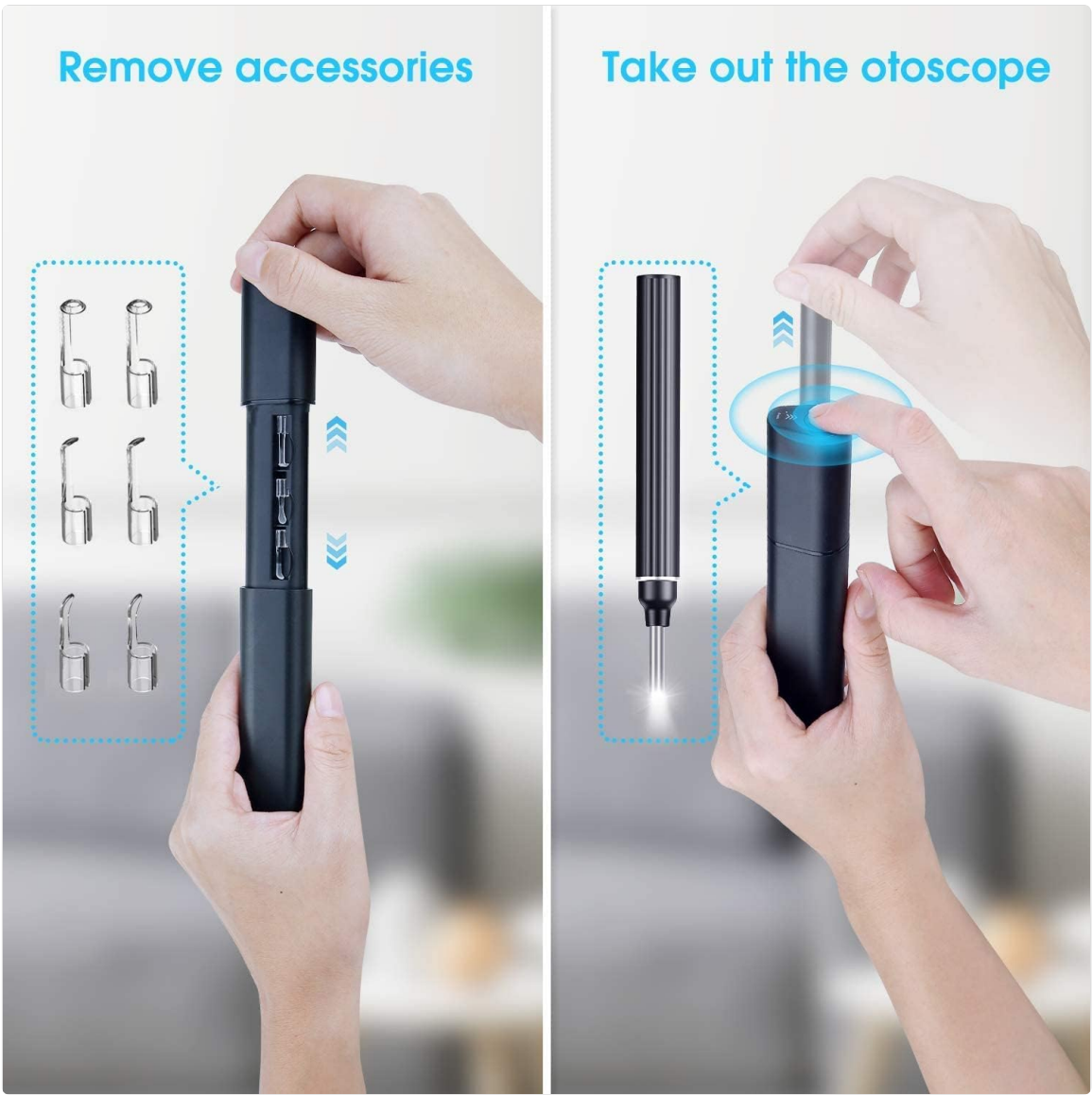
Image: Instructions on how to access the ear spoons from the integrated storage and how to properly remove the otoscope from its protective casing.