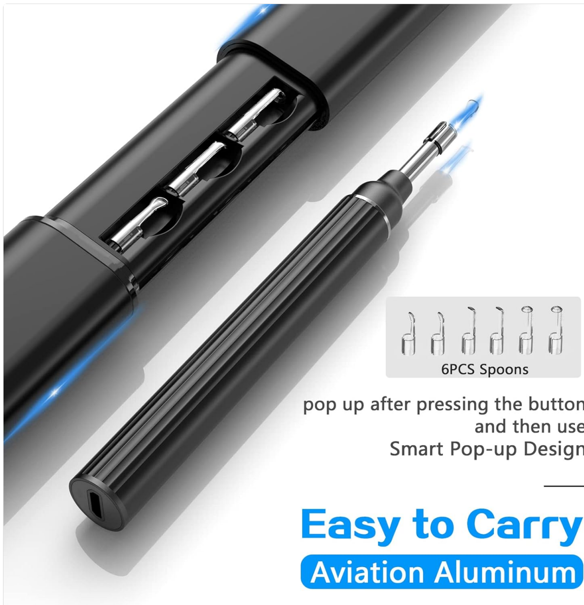
Image: The smart pop-up design of the otoscope, revealing six ear spoons stored conveniently within the device handle.