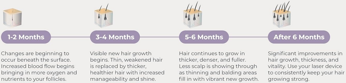
Image 5.2: A visual timeline illustrating the expected hair growth progression over 1-2 months, 3-4 months, 5-6 months, and after 6 months of consistent Hairmax treatment.