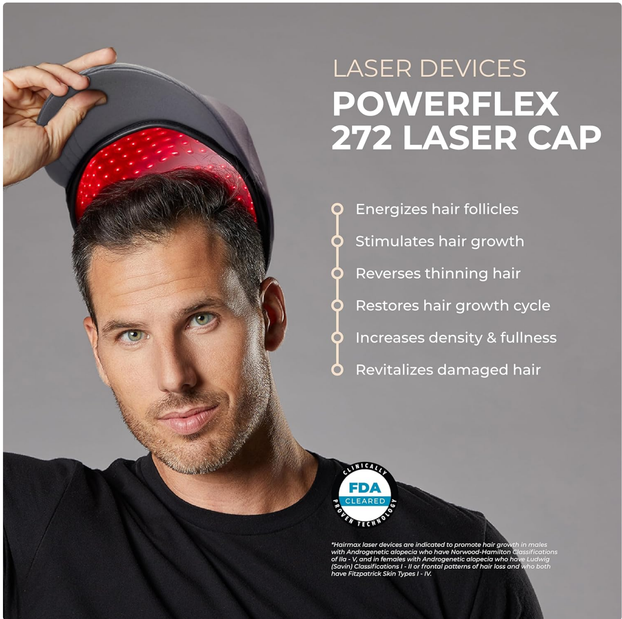
Image 1.2: A man wearing the Hairmax PowerFlex 272 Laser Cap, illustrating how the device energizes hair follicles, stimulates hair growth, reverses thinning, restores hair growth cycle, increases density, and revitalizes damaged hair.