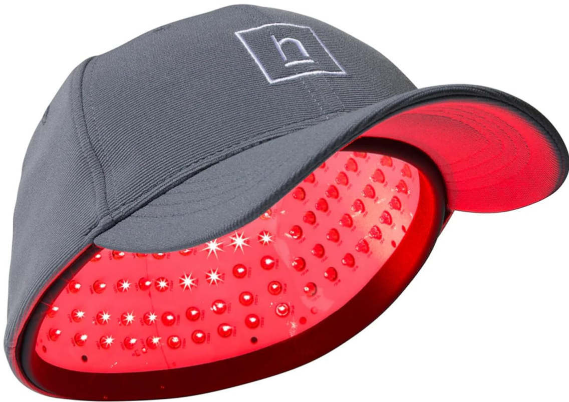
Image 1.1: The Hairmax PowerFlex 272 Laser Cap, a flexible cap with red laser diodes visible inside.