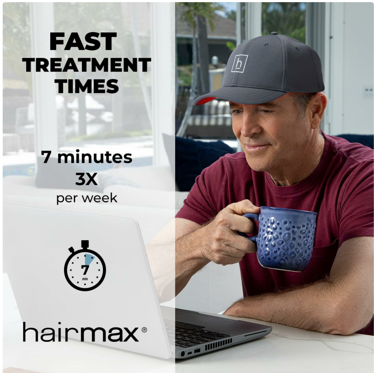
Image 5.1: A man wearing the Hairmax PowerFlex 272 Laser Cap while working on a laptop and drinking coffee, demonstrating the hands-free and convenient 7-minute treatment time, 3 times per week.