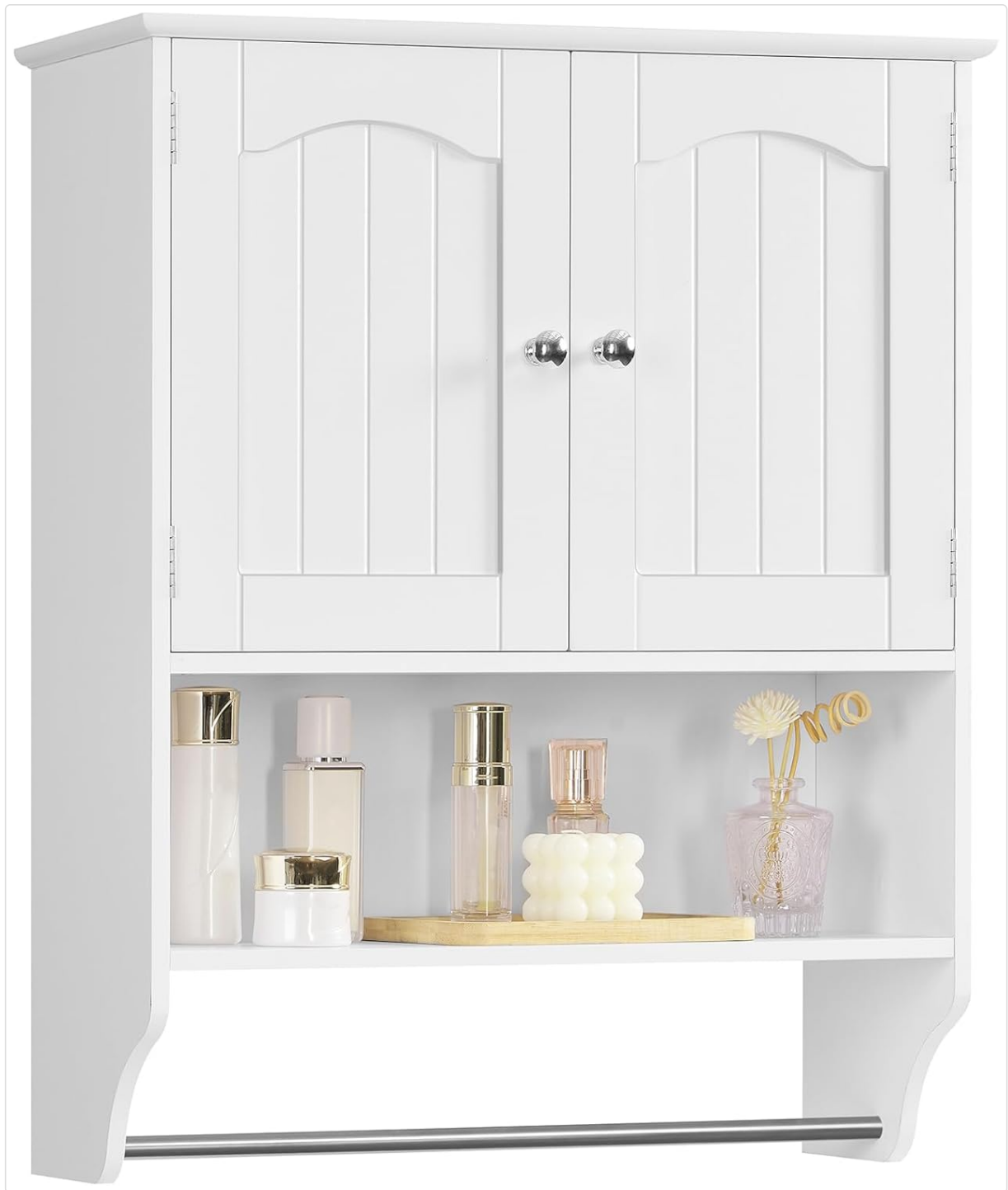
Figure 2.1: Front view of the Iwell Bathroom Wall Cabinet.