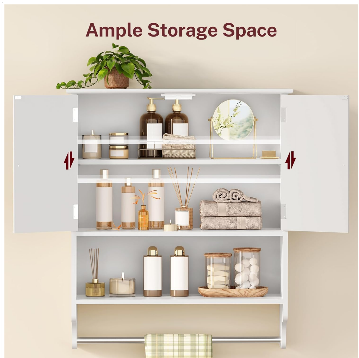
Figure 4.1: Cabinet interior demonstrating ample storage and adjustable shelf use.