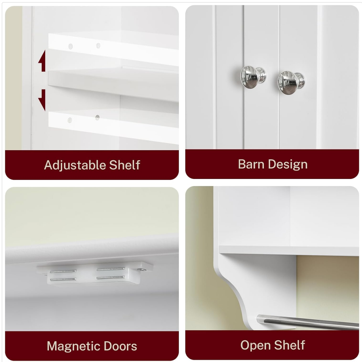
Figure 2.2: Detailed view of cabinet features, including the adjustable shelf mechanism, door design, magnetic closures, and the open shelf with towel bar.