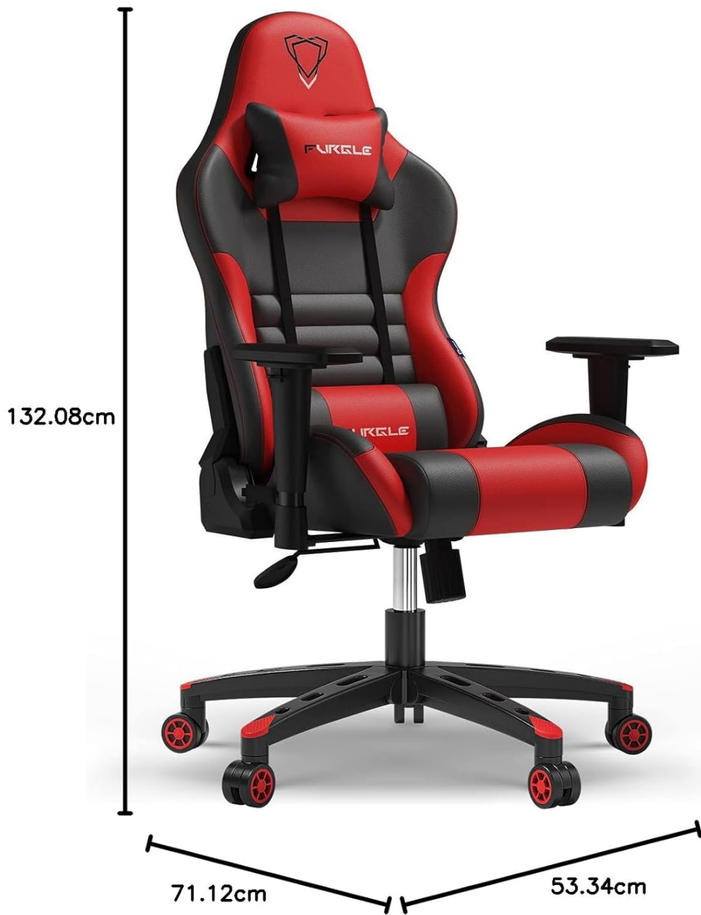
Image 9.2: Detailed dimensions of the Furgle RE2 Gaming Chair in centimeters.