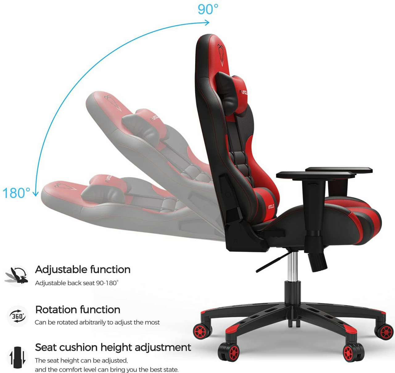
Image 6.1: Illustration of the adjustable backrest (90-180 degrees), 360-degree rotation, and seat cushion height adjustment.