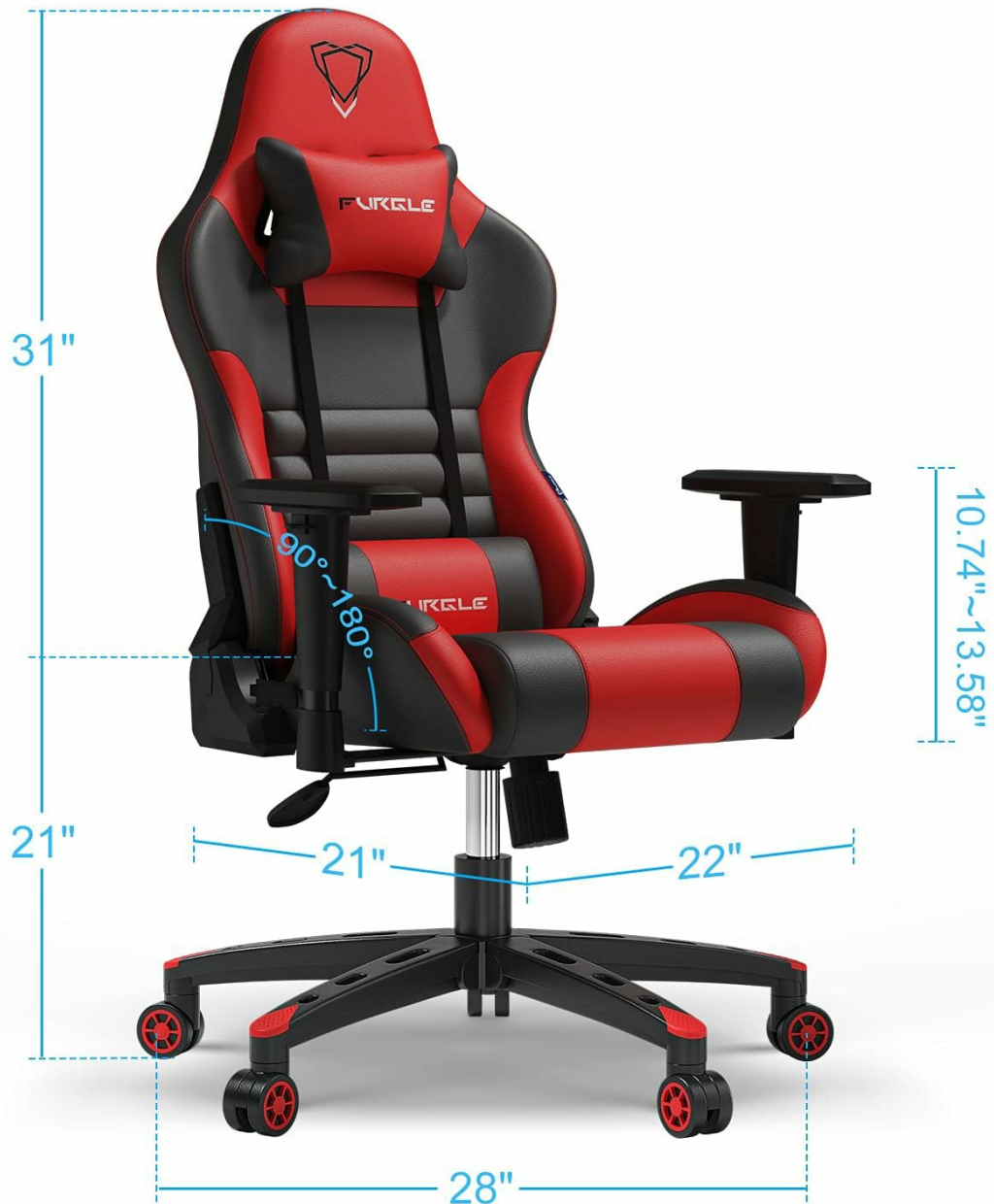
Image 9.1: Detailed dimensions of the Furgle RE2 Gaming Chair in inches.