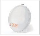
Sunrise Alarm Clock ACA-002-MB (English version)

Comprehensive user manual for the Sunrise Alarm Clock ACA-002-MB, detailing features, setup, alarm functions, sleep aid, ambient light, and FM radio operation.