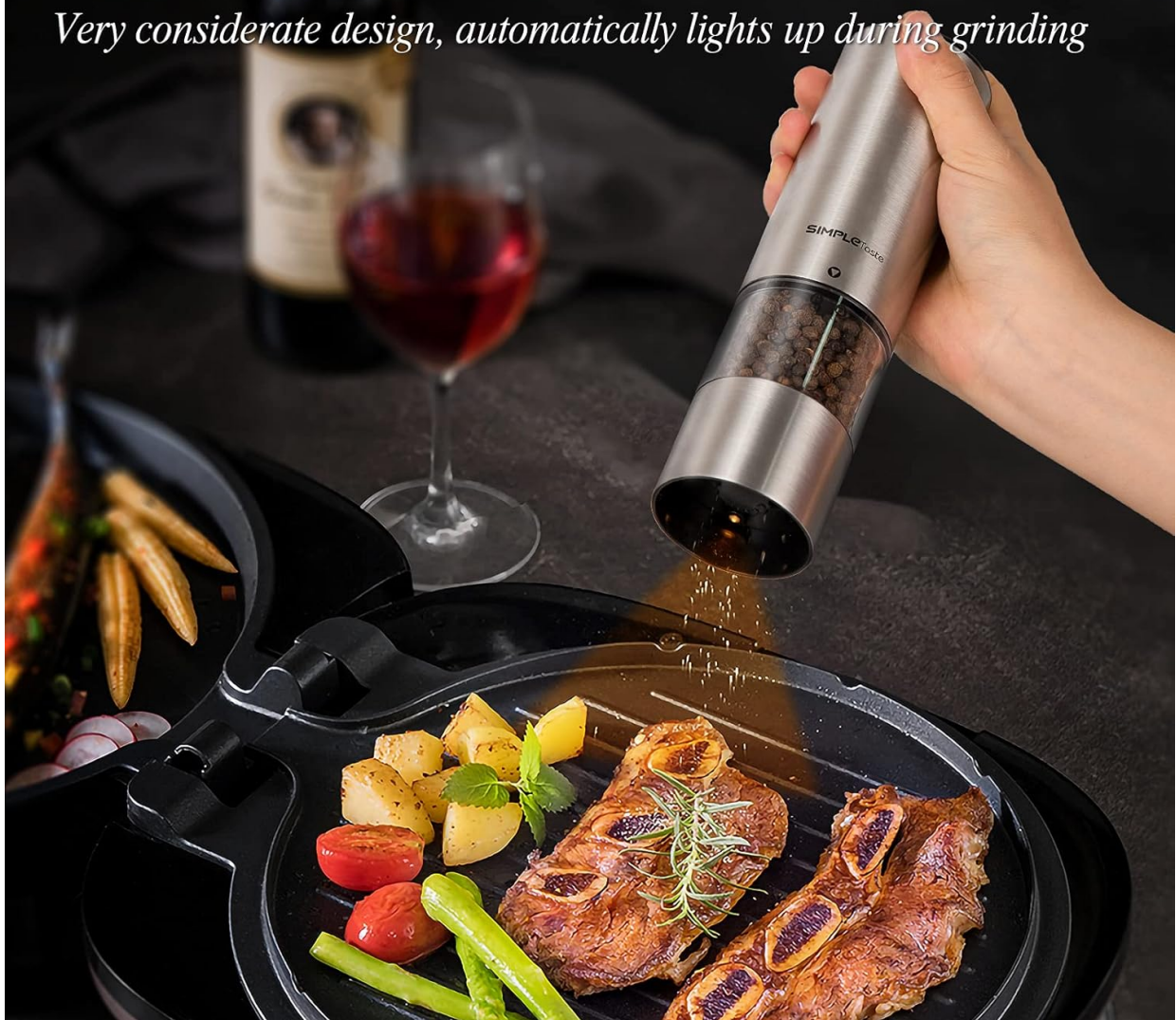
Figure 3: The grinder in use, demonstrating the integrated LED light illuminating the seasoning area.

Very considerate design, automatically lights up during grinding