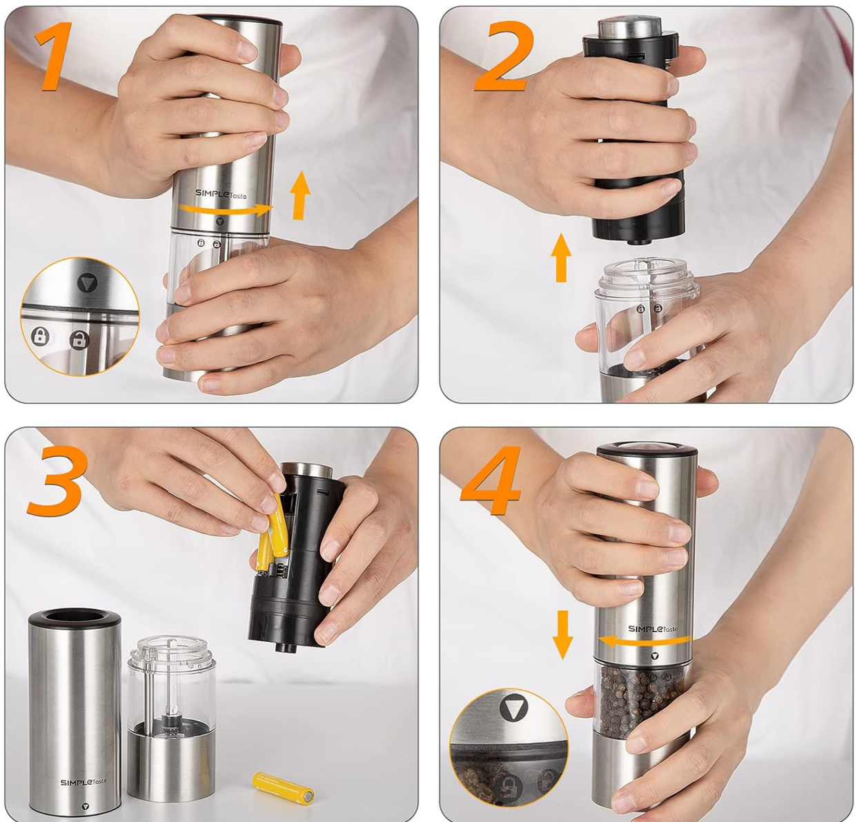
Figure 2: Visual guide for disassembling, installing batteries, and refilling the grinder.