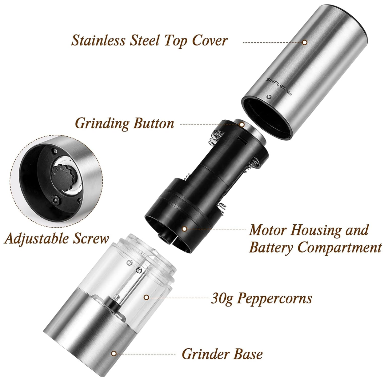
Figure 1: Exploded view of the grinder, highlighting the stainless steel top cover, grinding button, motor housing and battery compartment, adjustable screw, 30g peppercorns capacity, and grinder base.