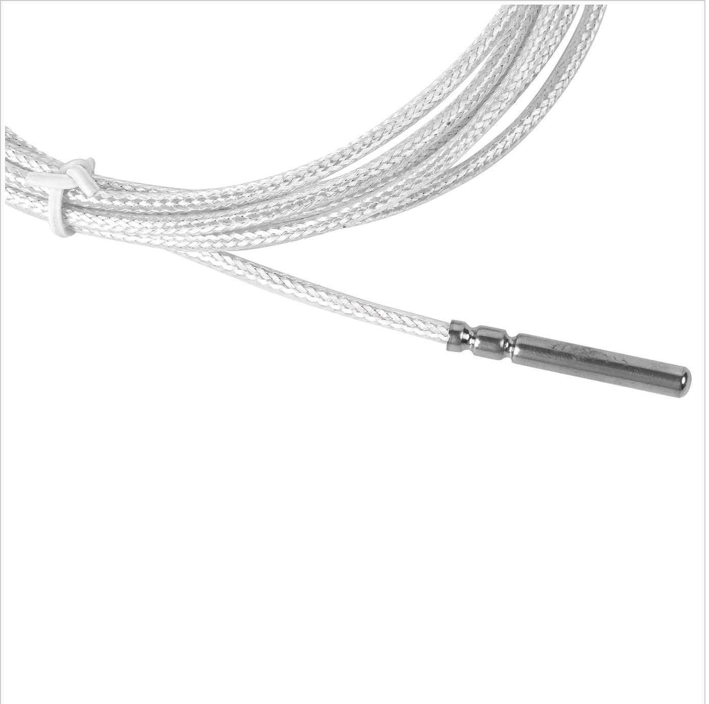
Figure 2: Detailed view of the stainless steel probe tip, which houses the Pt100 element.