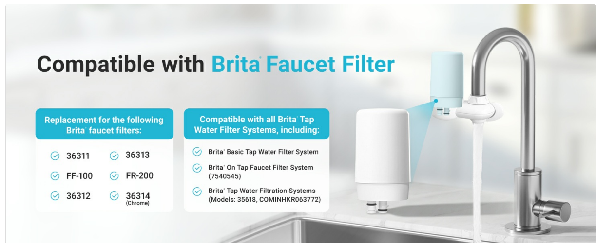
Figure 2.1: Compatibility details for AQUA CREST 7027W filter with Brita faucet systems.