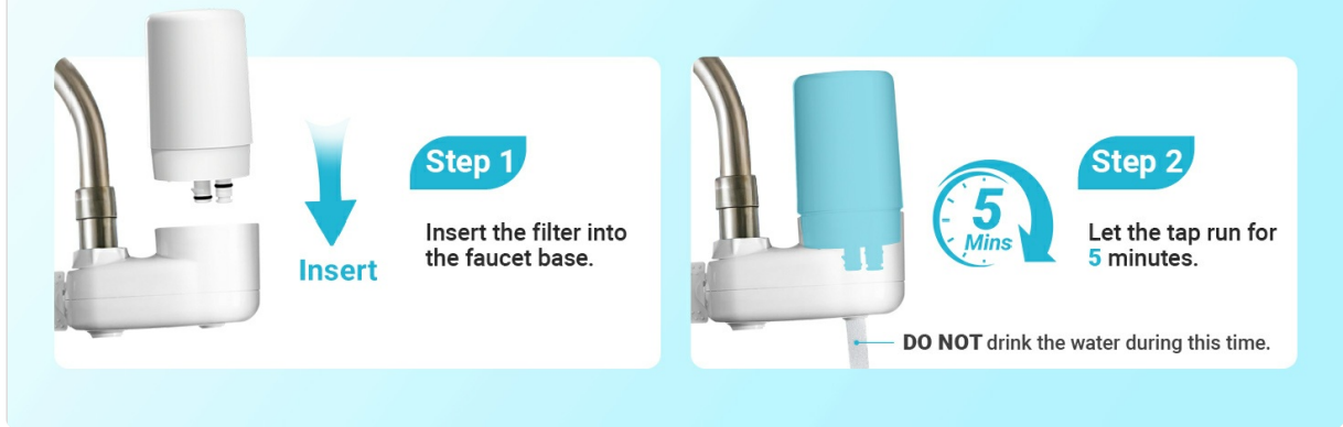
Figure 4.1: Simple two-step installation process for the faucet filter.