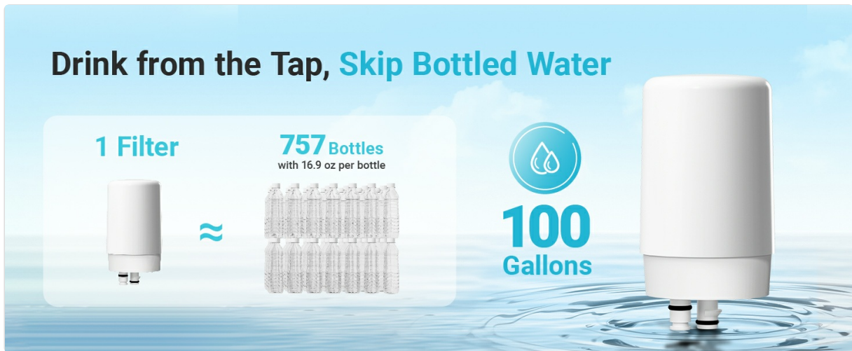
Figure 6.1: One filter provides 100 gallons of filtered water.