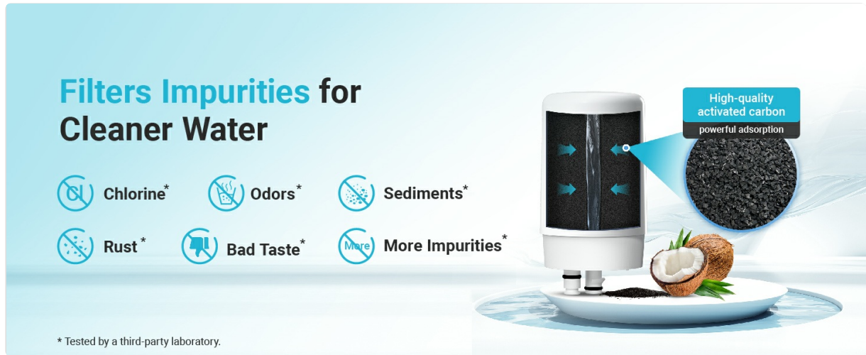
Figure 3.1: Illustration of the filter's ability to remove chlorine, odors, sediments, rust, and bad taste.

This filter utilizes a premium natural coconut activated carbon block. It is designed to reduce chlorine, heavy metals, and improve taste and odor. It also helps in reducing sediment and rust particles from your tap water.