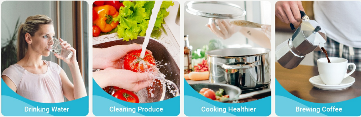
Figure 5.2: Various everyday uses for clean filtered water.