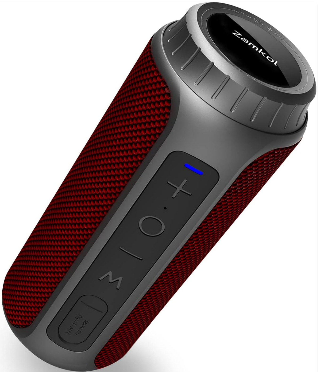
Close-up of the control panel on the Zamkol ZK202 speaker, showing the volume buttons, power/play button, mode button, and Micro SD/AUX ports.