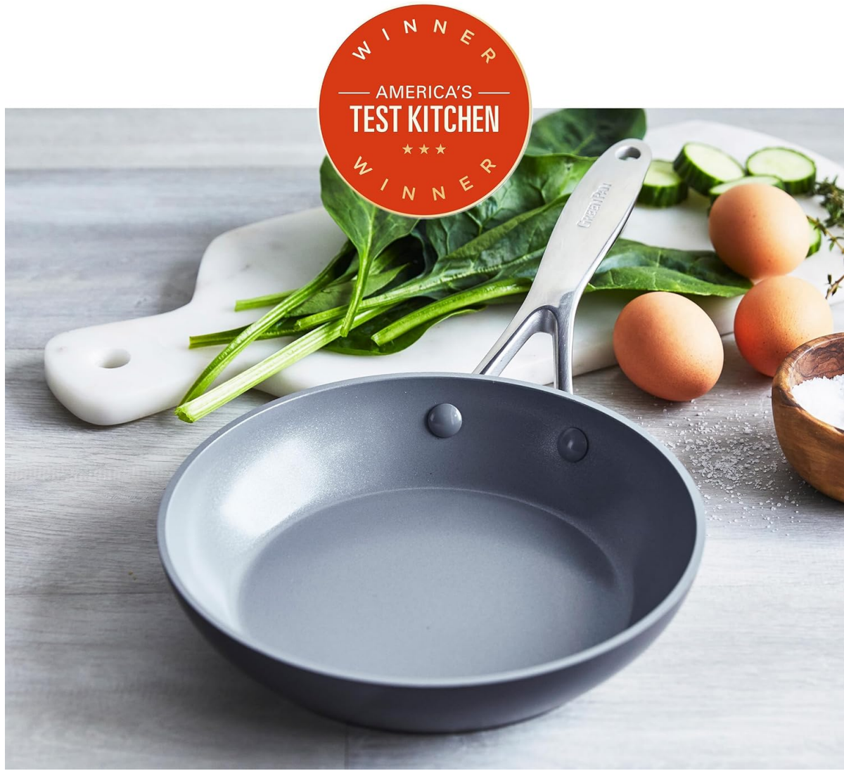
Image: Front view of the GreenPan Valencia Pro 8-inch Frying Pan Skillet.