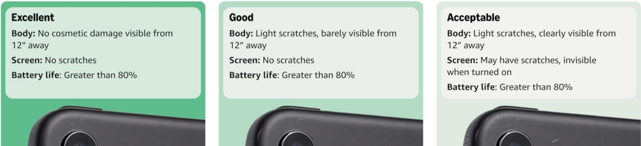
Image: An informational graphic detailing the conditions for Amazon Renewed products, categorizing them as Excellent, Good, or Acceptable based on cosmetic damage visibility and battery life.

Example body scratches and dents – not actual products