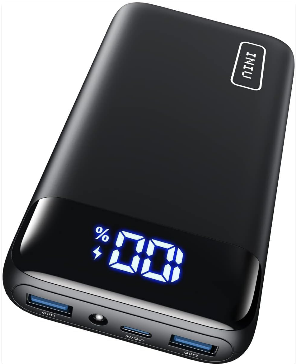
Image: The INIU 22.5W 20000mAh Portable Charger, showcasing its sleek black design with an LED display indicating 100% charge and multiple charging ports.