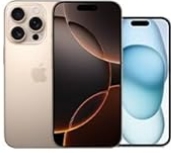
iPhone 16-11 Series