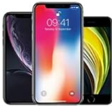
iPhone X / XR and Earlier