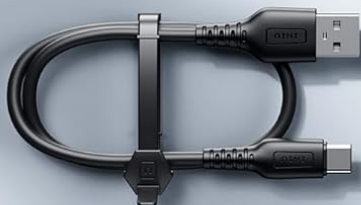
1ft USB-A to USB-C Cable