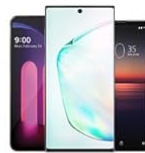
Samsung / Sony / LG