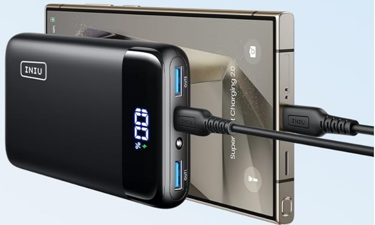
Image: Two separate illustrations showing the INIU Power Bank fast charging an iPhone 16 to 65% and a Samsung S24 to 60% in 25 minutes, highlighting its rapid charging capability.