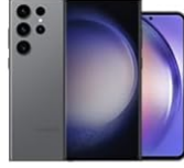
Samsung Galaxy S / A Series