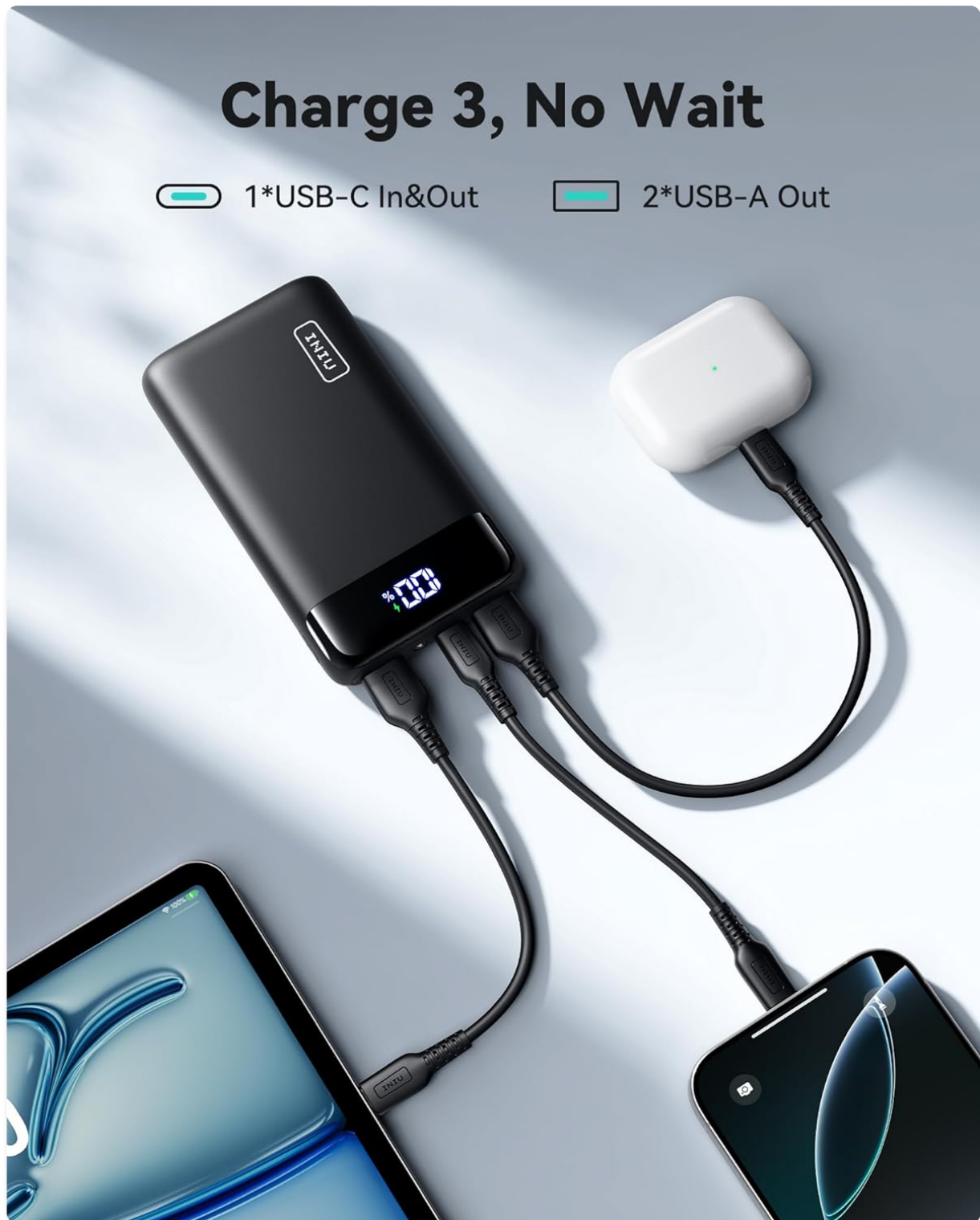
Image: The INIU Power Bank connected via cables to an iPad, an iPhone, and a pair of wireless earbuds, demonstrating its ability to charge three devices simultaneously.