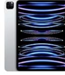
iPad Mini / Air / Pro