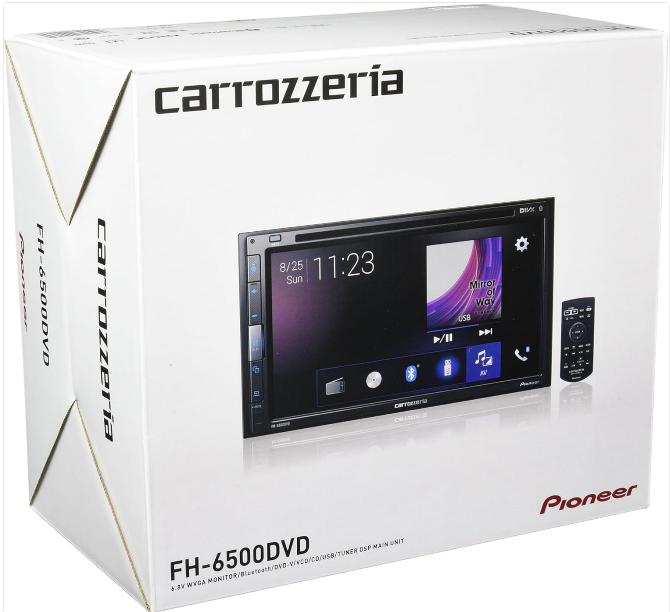
Figure 9.1: The Pioneer FH-6500DVD product packaging, showing the unit and remote control.

The Pioneer FH-6500DVD comes with a 1-year manufacturer warranty . Please retain your proof of purchase for warranty claims. For technical support, product registration, or further assistance, visit the official Pioneer website or contact their customer service department.