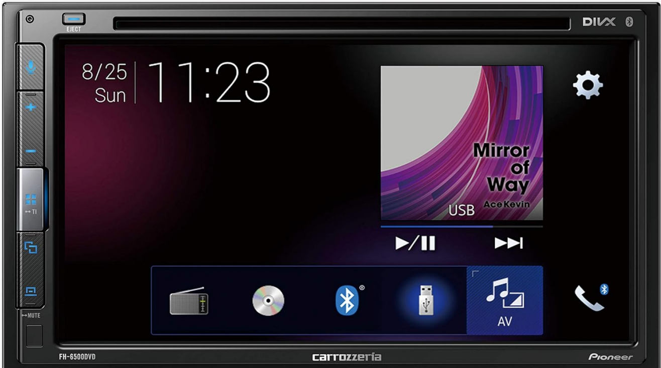
Figure 5.1: Front view of the Pioneer FH-6500DVD unit, showing the display interface with time and music information.

The unit features a 6.8-inch wide VGA display with touch screen functionality. You can interact with the interface using touch, flick, and slide gestures.