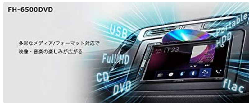
Figure 5.2: Illustration of the FH-6500DVD's media compatibility, including USB, Portable HDD, Full HD, CD, DVD, and FLAC audio.