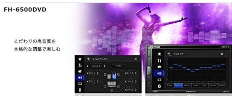
Figure 5.3: Screenshot of the FH-6500DVD's sound adjustment interface, showing options for Time Alignment and Equalizer settings.